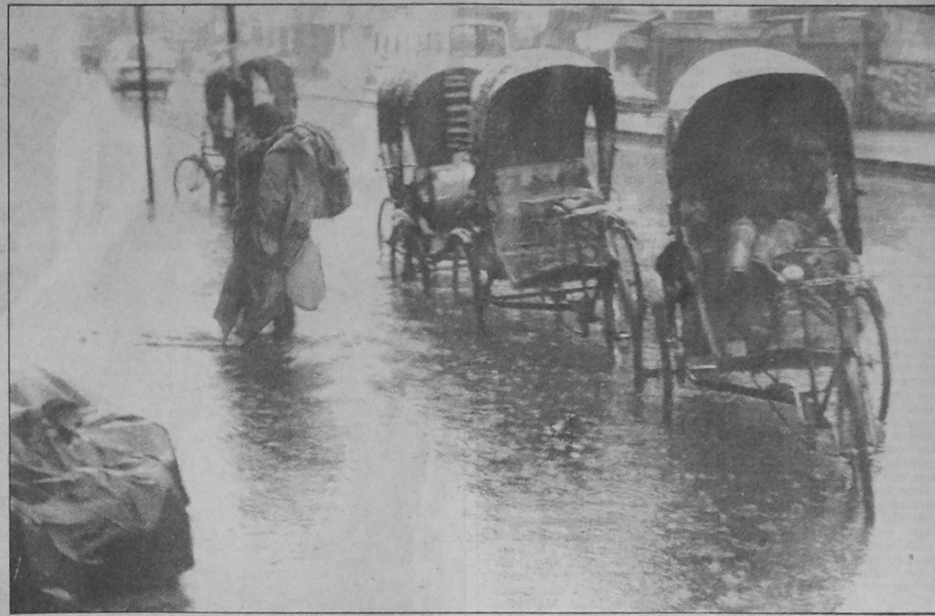
Untimely rain caught the city dwellers enjoying weekend off guard yesterday afternoon apart from leaving streets under water.