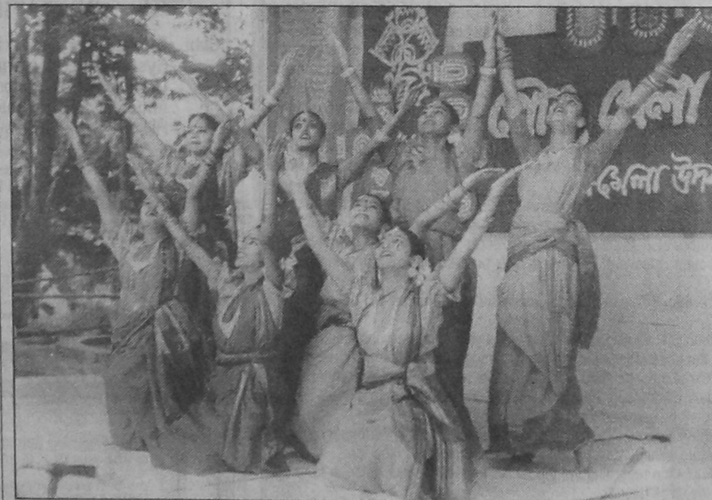
Artists perform a dance number celebrating Poushmela (winter festival) at Ramna Batamul in the city yesterday.