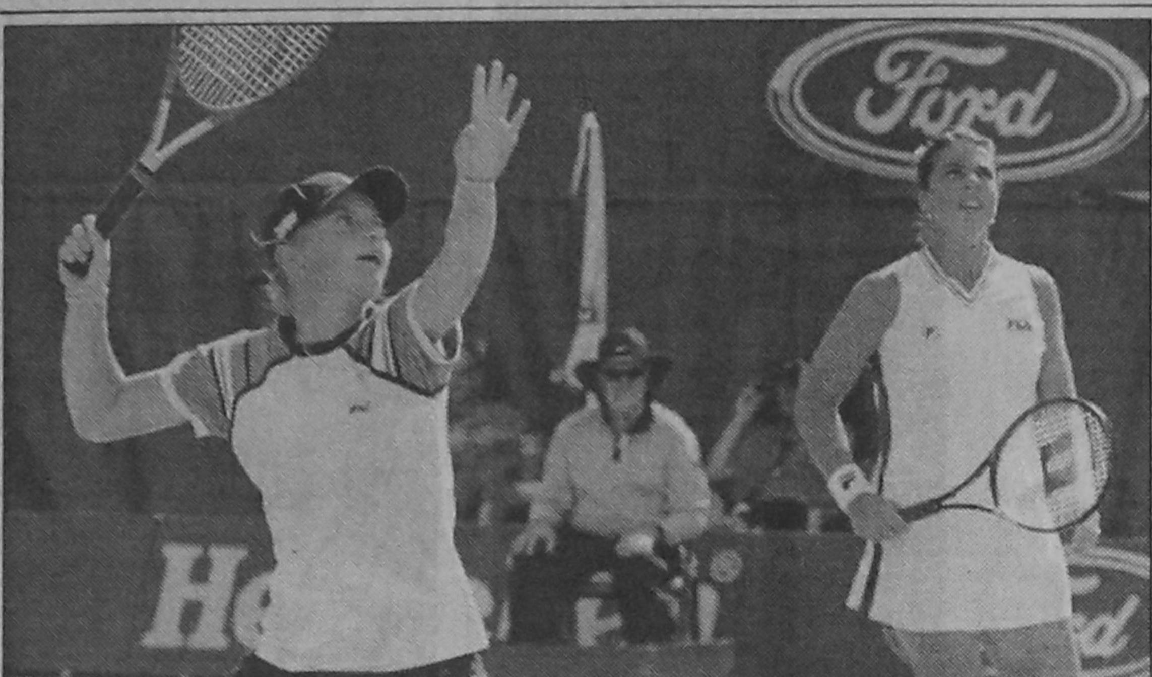
Australian teenager Jelena Dokic (L) about to smash the ball while her American partner Jennifer Capriati looks on during their women's doubles engagement against Spanish pair of Rosa Andres and Conchita Martinez at the Australian Open yesterday. Dokic-Capriati duo won 6-2, 6-0.

Van Gaal has reportedly given his blessing to the deal, but is asking Barcelona officials to sign Arsenal's Dutch left winger Marc Overmars as a tactical replacement.