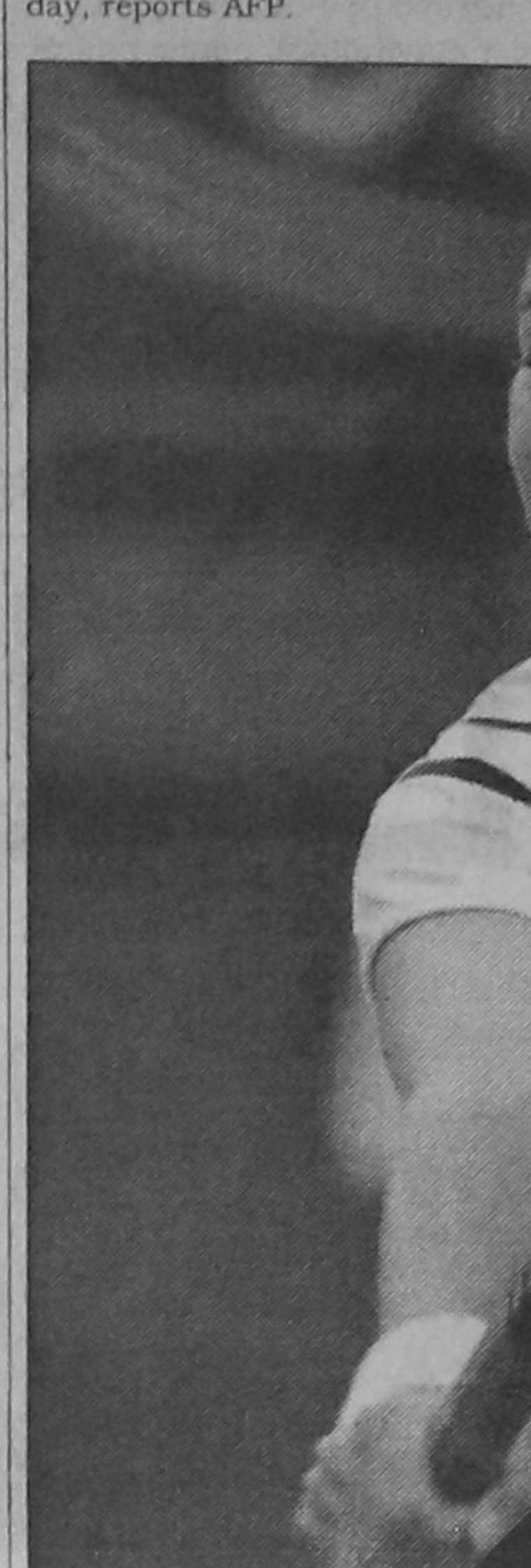
Swiss top seed Martina Hingis playing against Belgian Justine Henin at the Australian Open yesterday.

MELBOURNE, Jan 20: Defending women's champion Martina Hingis and Serena Williams, who beat her in last year's Open final, made startlingly different statements at the Australian Open here Thursday, reports AFP.