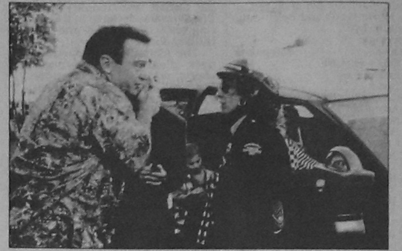
Carpool on Star Movies at 10.00 pm on January 30

In 1984, writer/director James Cameron and star Arnold Schwarzenegger combined their considerable talents