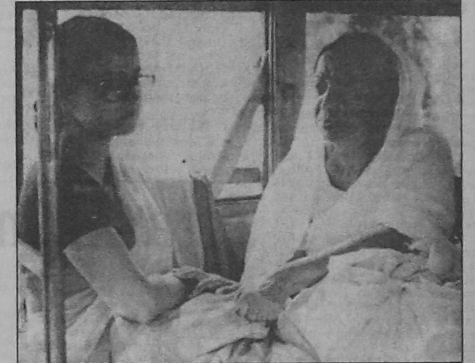
A scene from Chitra Nadir Parey