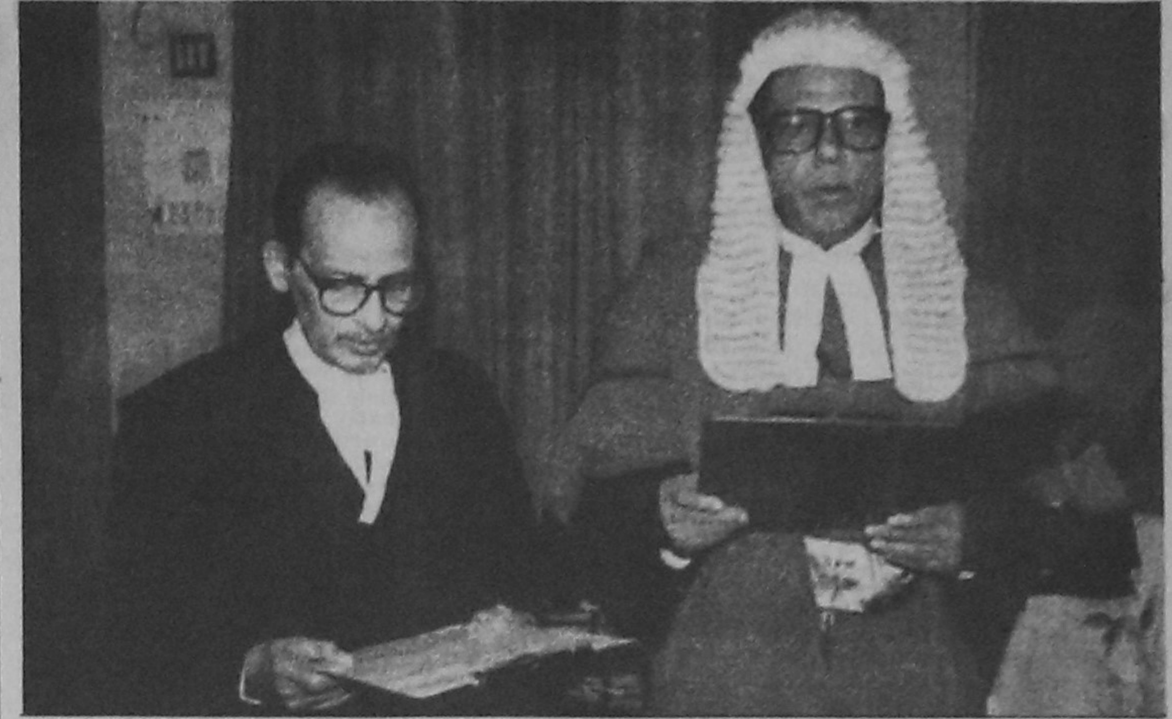
Chief Justice Latifur Rahman administering the oath of office to the newly-appointed judge of the Appellate Division of Bangladesh Supreme Court Kazi Ebadul Haq at his office yesterday.