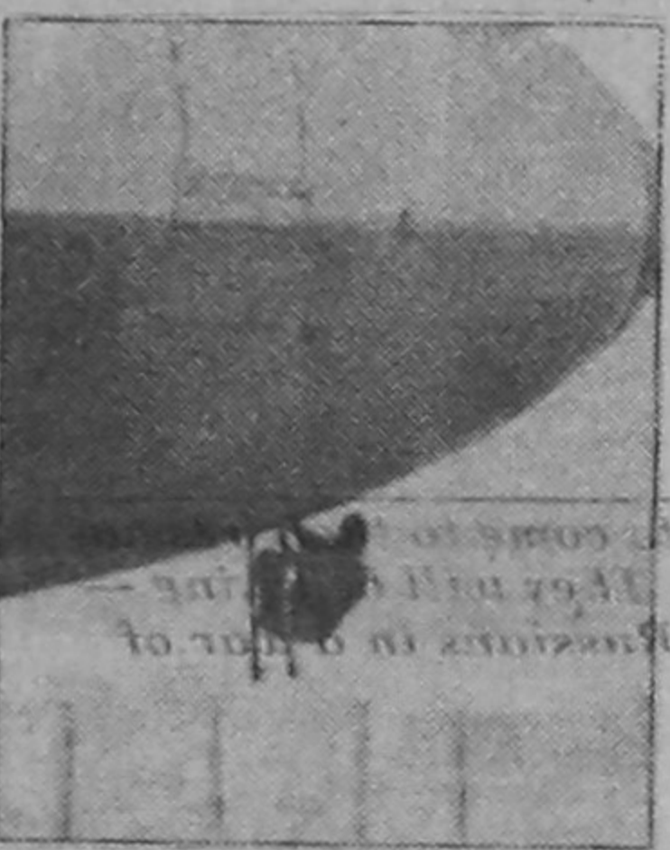
KANDAHAR: A hijacker hanging out of cockpit, to have a look of surrounding at the Kandahar Airport in Afghanistan on Dec 30...