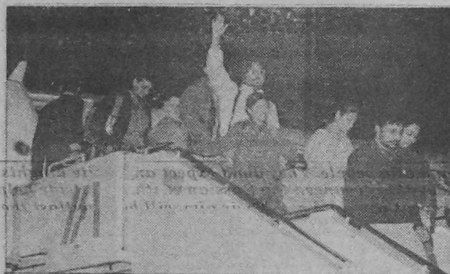
NEW DELHI: An unidentified hostage waves as a group of hostages disembark from a plane at New Delhi's international airport on Dec 31...