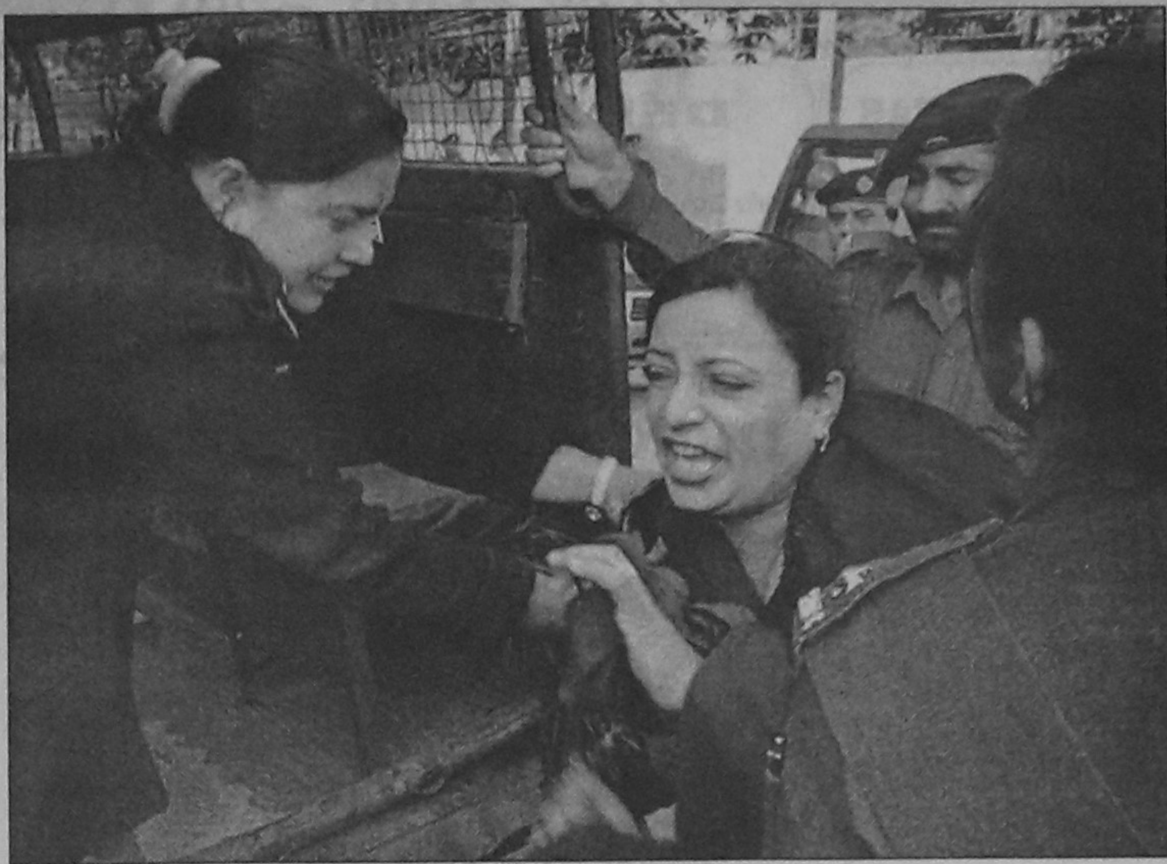
Police women arrest a supporter (C) of ousted Pakistani prime minister Nawaz Sharif outside an anti-terrorism court in Karachi yesterday. Sharif and six other officials, who were detained after army chief General Pervez Musharraf seized power in a coup three months ago, have still not been charged as the case was postponed again until January 18.

Khaleda assured the ambassador of her co-operation to discharge his responsibilities. The envoy said Bangladesh is a good friend and that France will help the people of Bangladesh achieve prosperity.