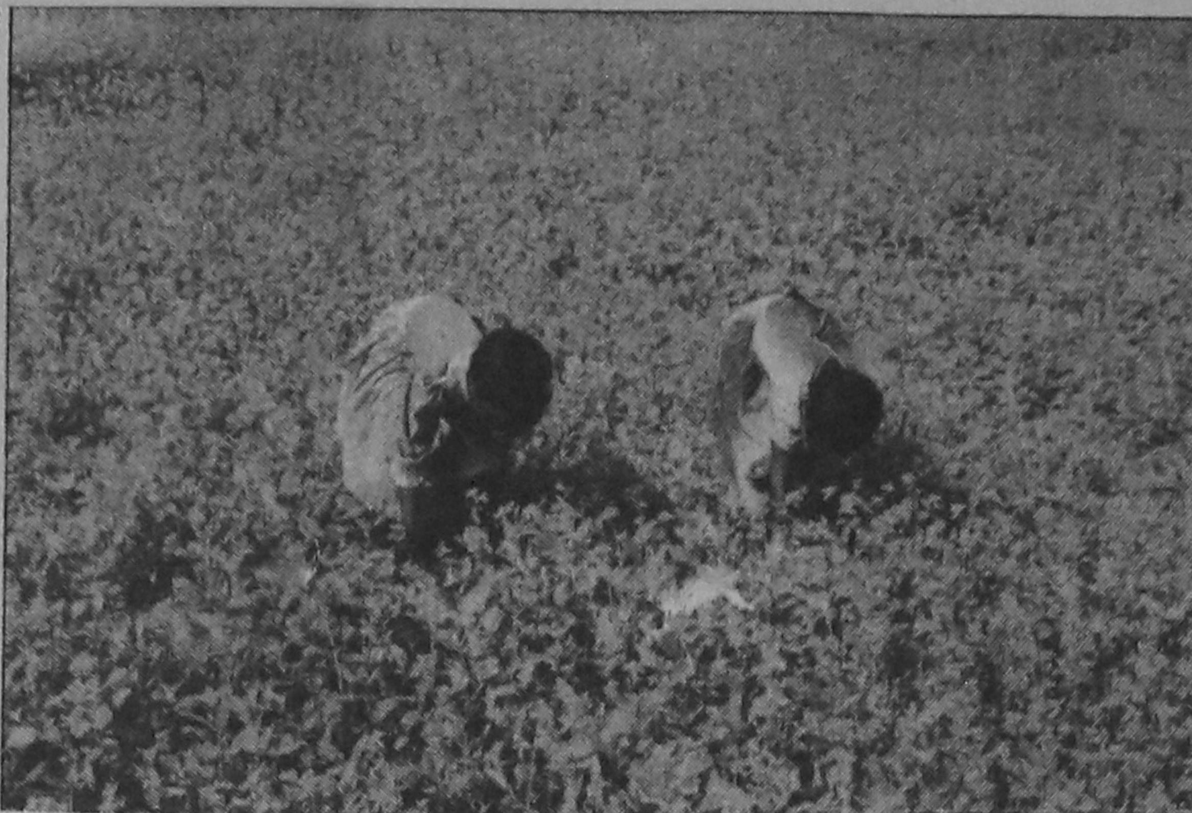
Two girls are seen in a mustard field in the district. Growers expect bumper production of the crop this season.

Addressing the district-level officials here, Asaduzzaman said overall development of the nation could not be possible, keeping a part of the country backward and underdeveloped. Keeping this idea in view, the present government, he said, had given priority to the solutions of long-standing problems of the Chittagong Hill Tracts and accomplished peace accord on it. The people of the hill tracts, the advisor said, have been living in peace following the signing of the peace agreement. He said that the government had laid special attention for the development of education and health to change the lot of the people of the hilly region.