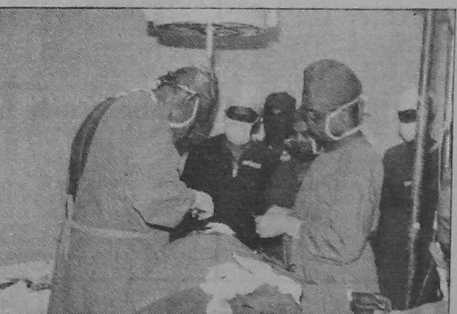
Feni Diabetic Association organised a medical camp recently where patients are being operated upon.