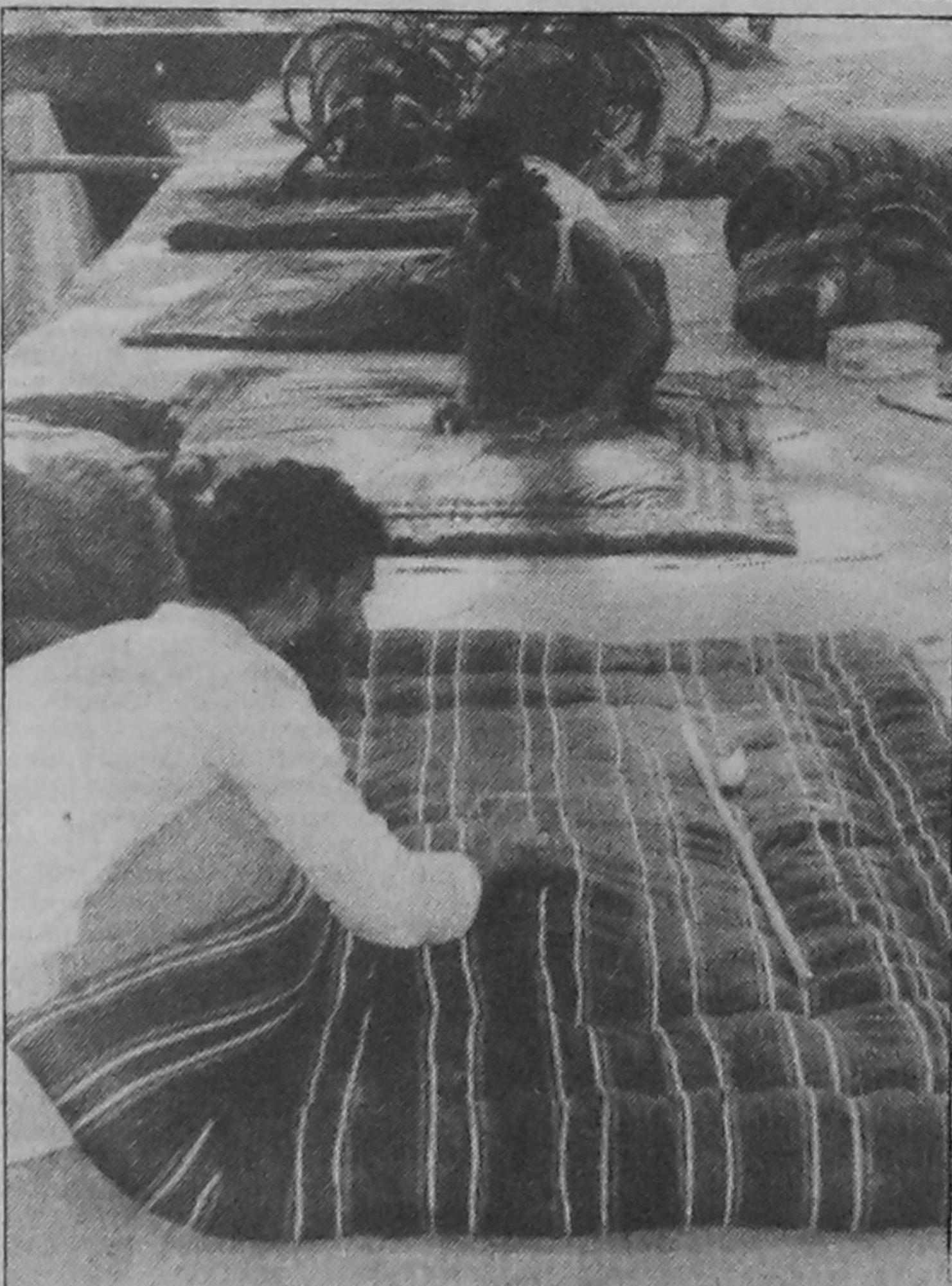
Quilt makers are busy making quilts in Magura town as cold wave sweeps across the country.