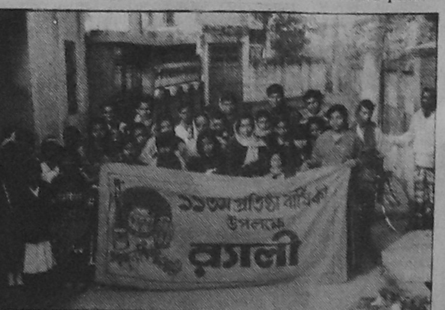
A procession was brought in Gaibandha town recently to mark the 11th founding anniversary of Spandan Shilpi Goshthi.