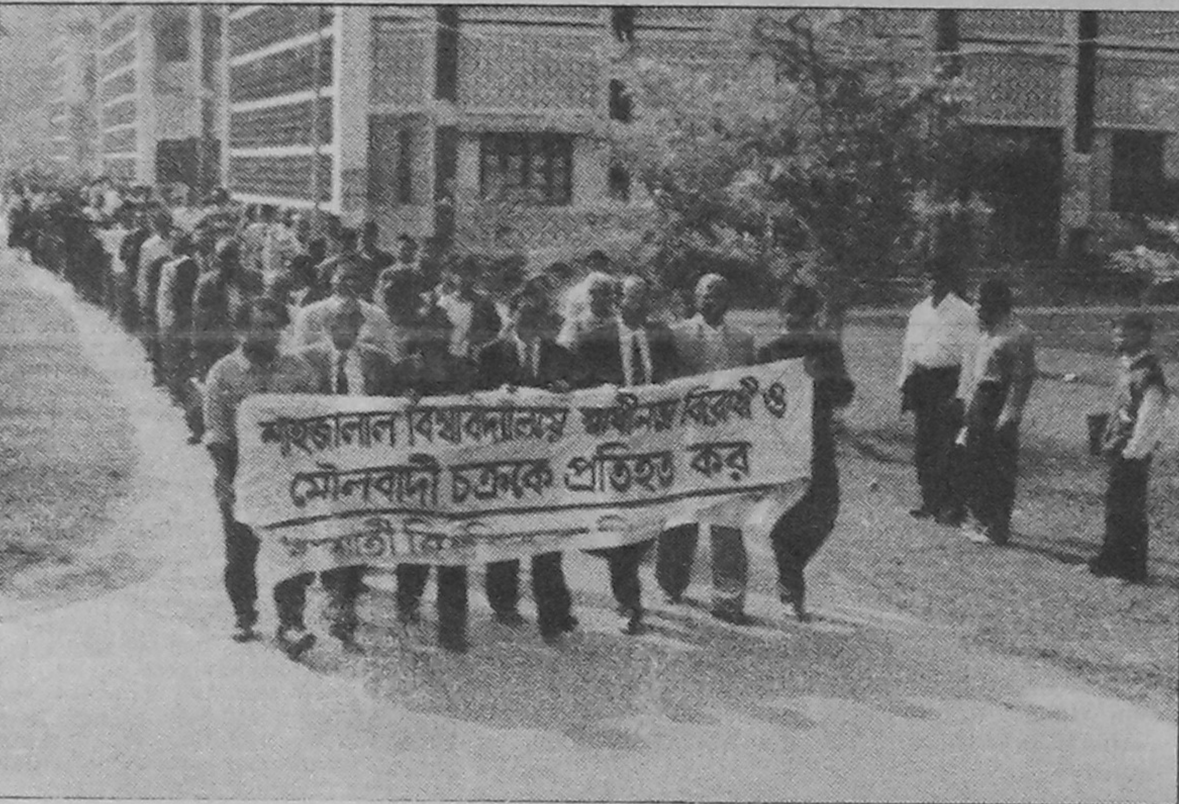
Rajshahi University Teachers Association (RUTA) brought out a silent procession on the campus recently, protesting the recent terrorist activities on Shaljalal University campus, Sylhet.

Last season 7,659 mt of mustard were produced by cultivating 8,215 hectares of land in the district.