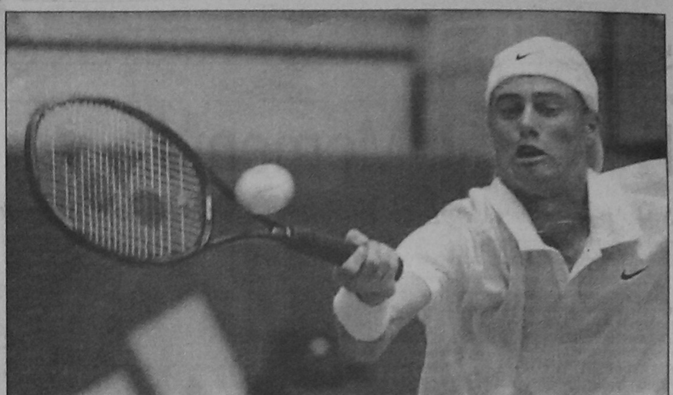
Australian Lleyton Hewitt stretches to make a forehand return against Jason Stoltenberg in the Sydney International final yesterday.

First round men's singles matches for the Australian Open start in Melbourne on Monday.