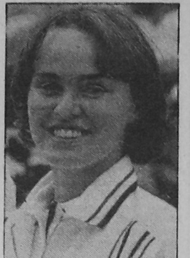
MARTINA HINGIS and second seed Yevgeny Kafelnikov...

a good week and continued training all the way through to coming down here. The prospect of faster courts at the Open - with the balls bouncing higher as the courts heat up in the Australian summer - are expected to favour the likes of defending champion