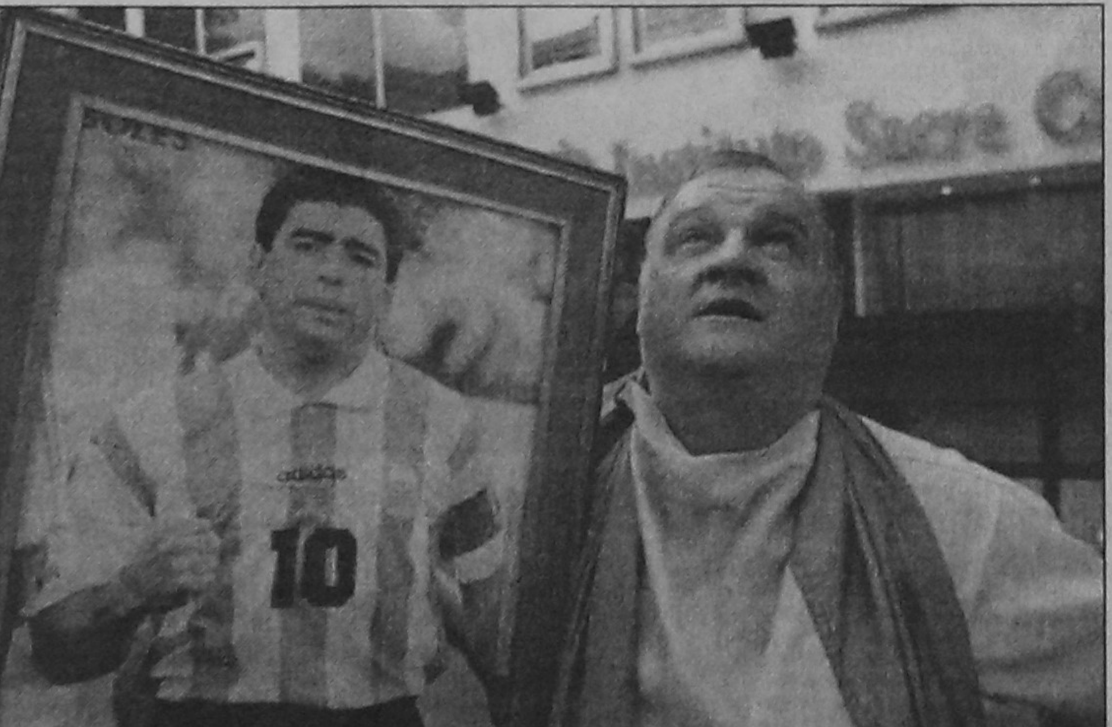
A fan of Diego Maradona holding a poster while waiting outside a Buenos Aires clinic where the Argentine soccer legend has been recuperating from heart ailment on January 14.