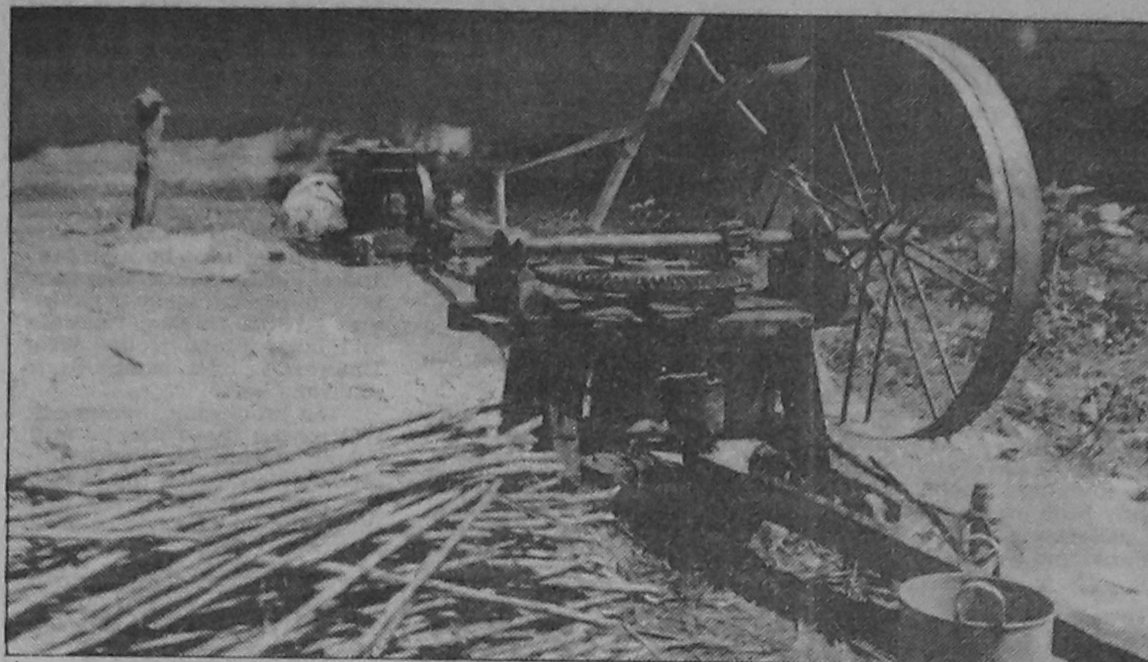
A power crusher is seen at a village under Natore district.