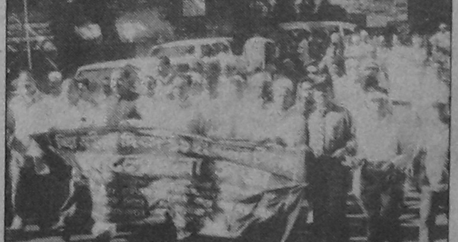
A colourful rally was brought out in Sylhet town in observance of World AIDS Day.