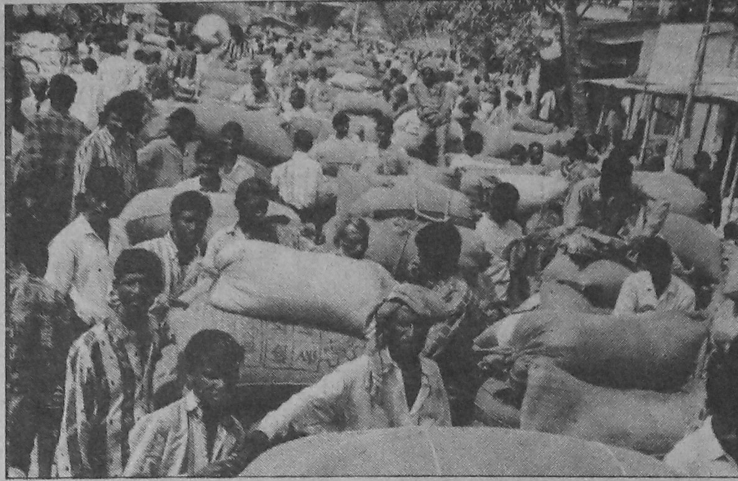
Paddy sellers occupy parts of a road in Kaliganj thana under Jhenidah district, disrupting smooth movement traffic movement.

The poor parents alleged hospitalised health complexes sell vitamin tablets to medicine shops instead of distributing free of cost to poor people.