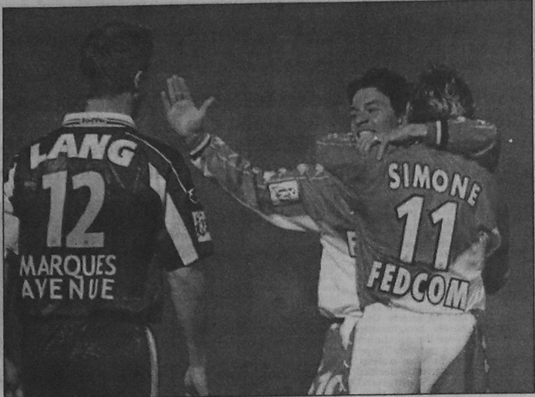
Monaco's Argentine playmaker Marcelo Gallardo (C) being congratulated by teammate Marco Simone after the former had scored his second goal against Troyes in a French First Division fixture at Troyes on January 12.

The Federation took the decision after it was amazed that the 28-year-old Parma midfielder, who played in the 1994 and 1998 World Cup finals, had not been banned for longer as he had spat in disgust at the decision to send him off.