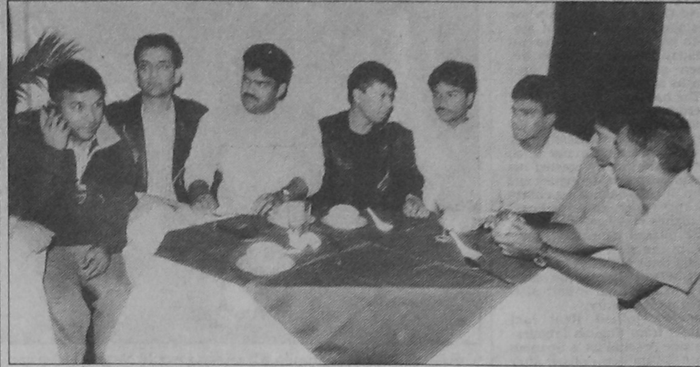
CWAB leaders discussing a point during a meeting at a city restaurant last night.

The first Test is scheduled to be held at the Wankhede Stadium here from February 24-28. The second Test is at Bangalore's Chinnaswamy Stadium from March 2-6.