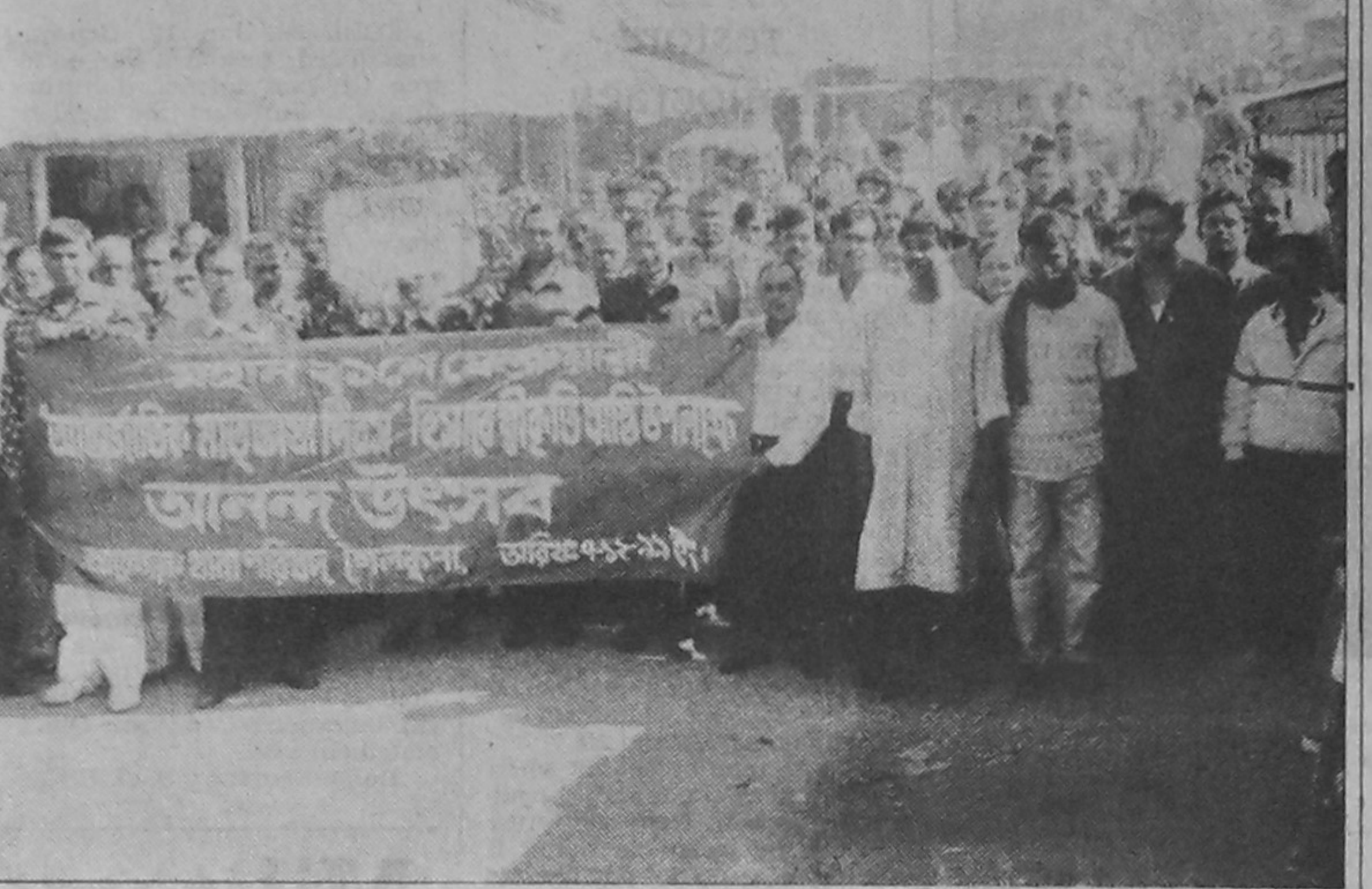
A procession was brought out in Shailakupa thana headquarters under Jhenedah district recently, hailing the Unesco decision to declare the 21st February as International Mother Language Day.