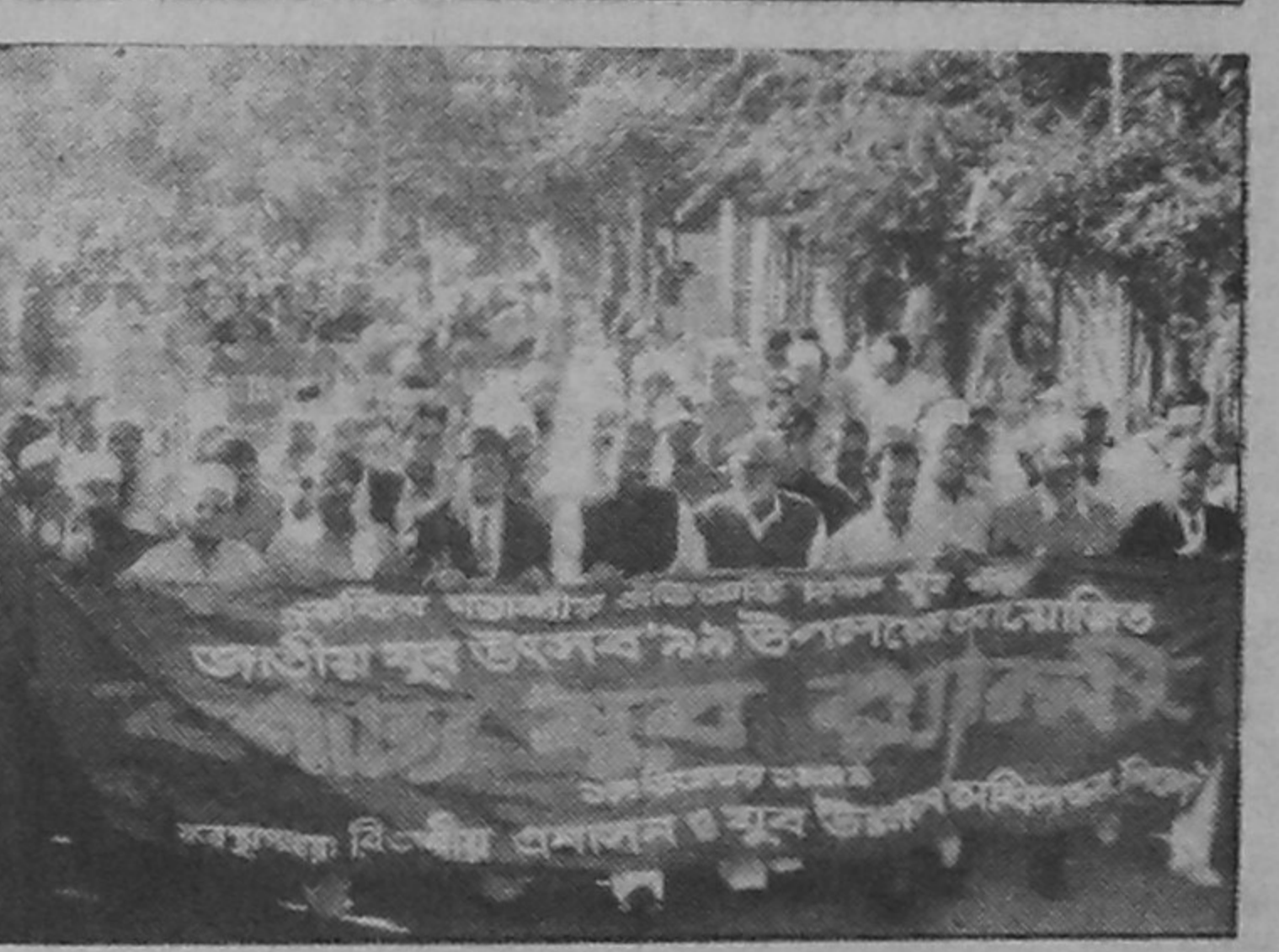
A colourful rally of youths was brought out in Sylhet town recently in observance of National Youth Day.