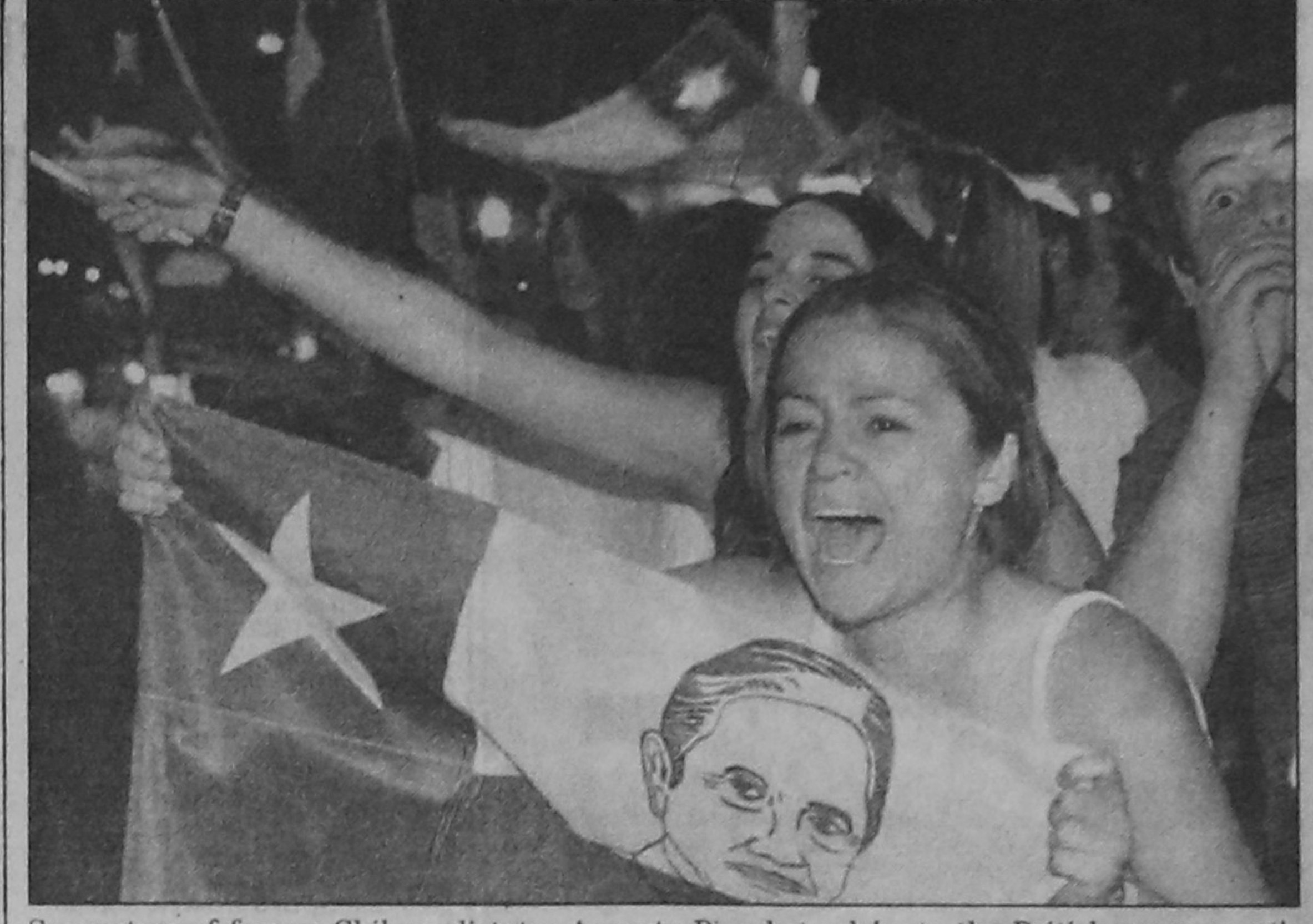
Supporters of former Chilean dictator Augusto Pinochet celebrate the British government's intention to release Pinochet on health grounds on Tuesday near the embassies of Great Britain and Spain in Santiago, Chile. The former strong man, who is under house arrest in London, was charged with torture and human rights violations during his 1973-1990 rule.

LONDON, Jan 12: Britain announced Tuesday it wanted to free Chilean former dictator Augusto Pinochet for health reasons, marking the beginning of the end to a controversial diplomatic and legal wrangle that has reverberated around the world, reports AFP.