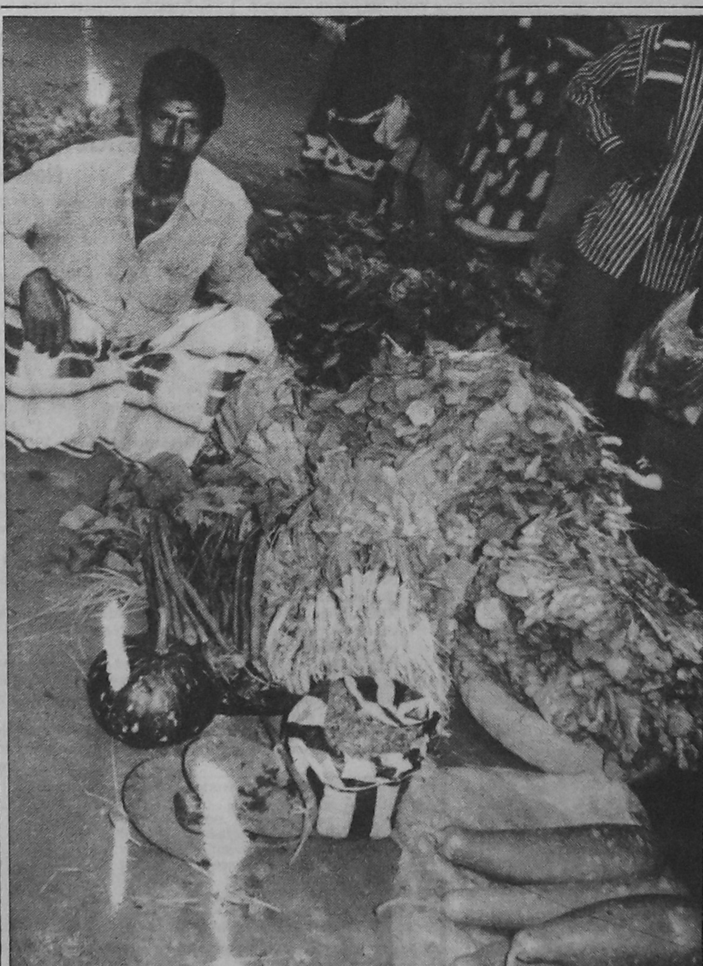
A vendor displays winter vegetables at a bazaar in Jamalpur recently. Vegetables start arriving in markets in the month of December, but the prices are abnormally high this year.