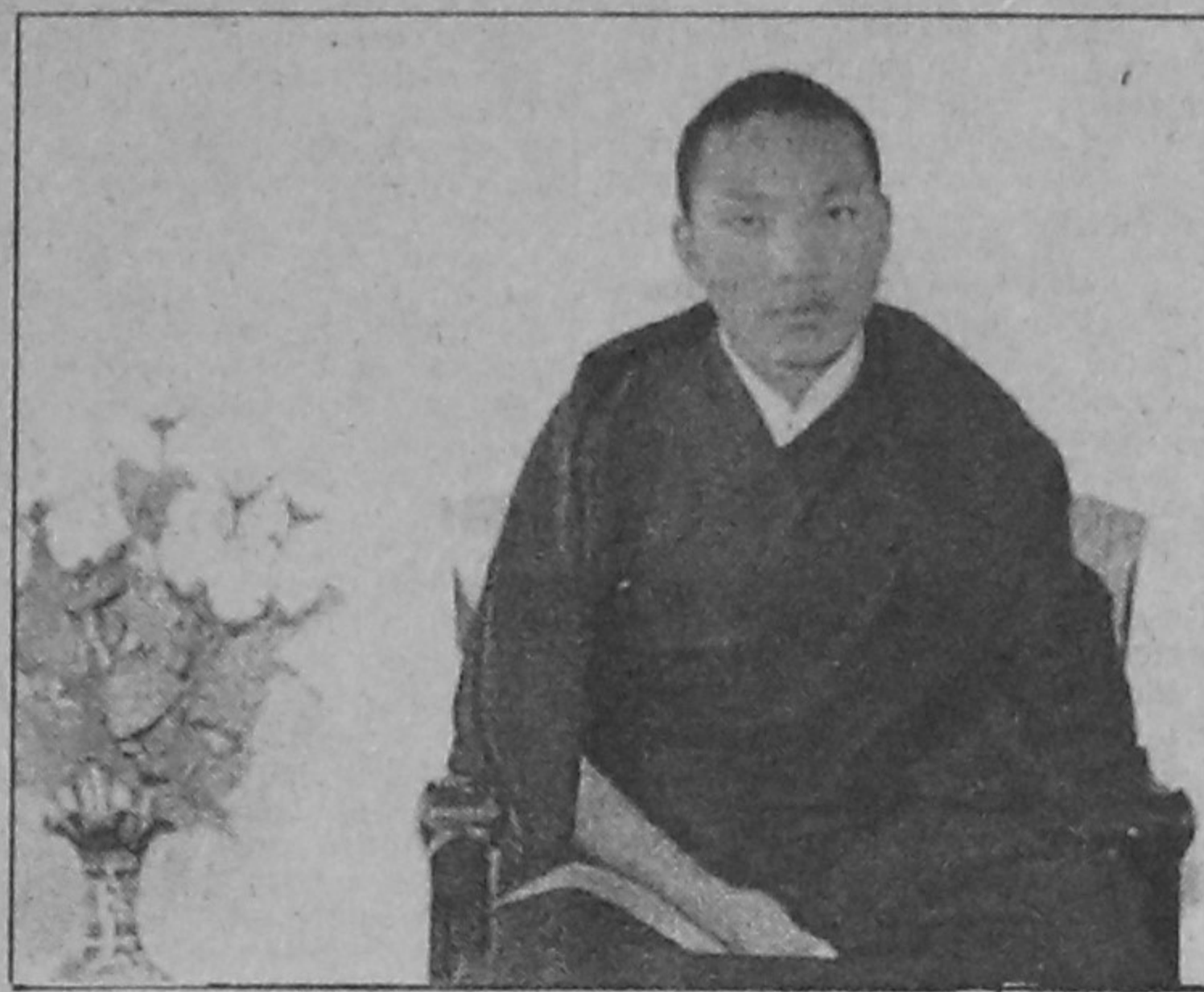
The 17th Karmapa Rinpoche poses for a picture at an undisclosed location, near Dharamsala, India, on Monday. The fourteen-year-old, considered the most senior spiritual leaders in Tibetan Buddhism, arrived in India on January 5 after a harrowing escape from China. According to exiled Tibetan officials in Dharamsala, the 17th Karmapa Rinpoche is destined to become a senior leader of the entire Tibetan movement.

Tibet. We oppose any infiltration by any religious extremist and we are also opposed to any interference in China's internal affairs by any religious forces outside China," Zhu said. Chinese State Councillor Ismail Amat Monday also alleged that there were attempts by hostile elements to split China, further underscoring the religious strife amongst Chinese minorities. "China will adhere to the reform and opening up policy while firmly resisting hostile overseas forces that use religion to infiltrate into China," Amat told a conference of Chinese religious leaders. "We will strengthen the management of religious affairs while respecting the religious beliefs of ethnic minorities and will firmly prevent and oppose hostile foreign forces from using religious issues to engage in ethnic splitting activities," he said, according to the official press. Chinese Premier Zhu Rongji addressed the religious conference Tuesday and urged religious leaders to rally China's diverse religious groups around the leadership of the atheist Communist Party, Xinhua said.