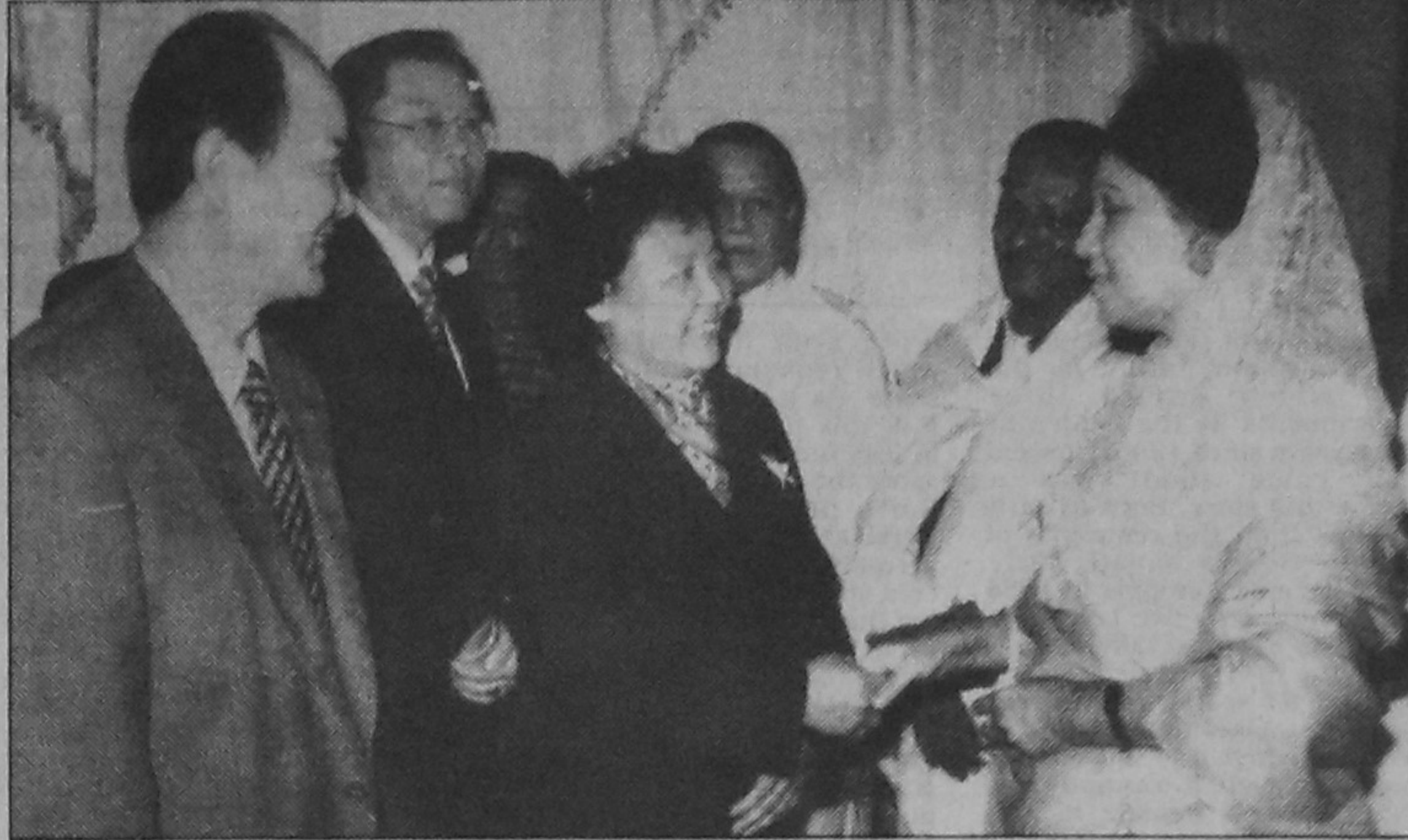
Leader of Opposition in the parliament and BNP chairperson Khaleda Zia exchanging Eid greetings with diplomats during a reception held at her 29, Minto Road residence.

Monipur Picnic Spot & Resort Fully furnished cottages with attached toilet at Joydevpur. Existing other facilities are good for Picnic, get together, holidaying, day spending overnight staying Bar-BQ's & what not! 50 Km / 1 Hr. drive away. Phone: 9663676, 500892. http://countryinn.webjump.com