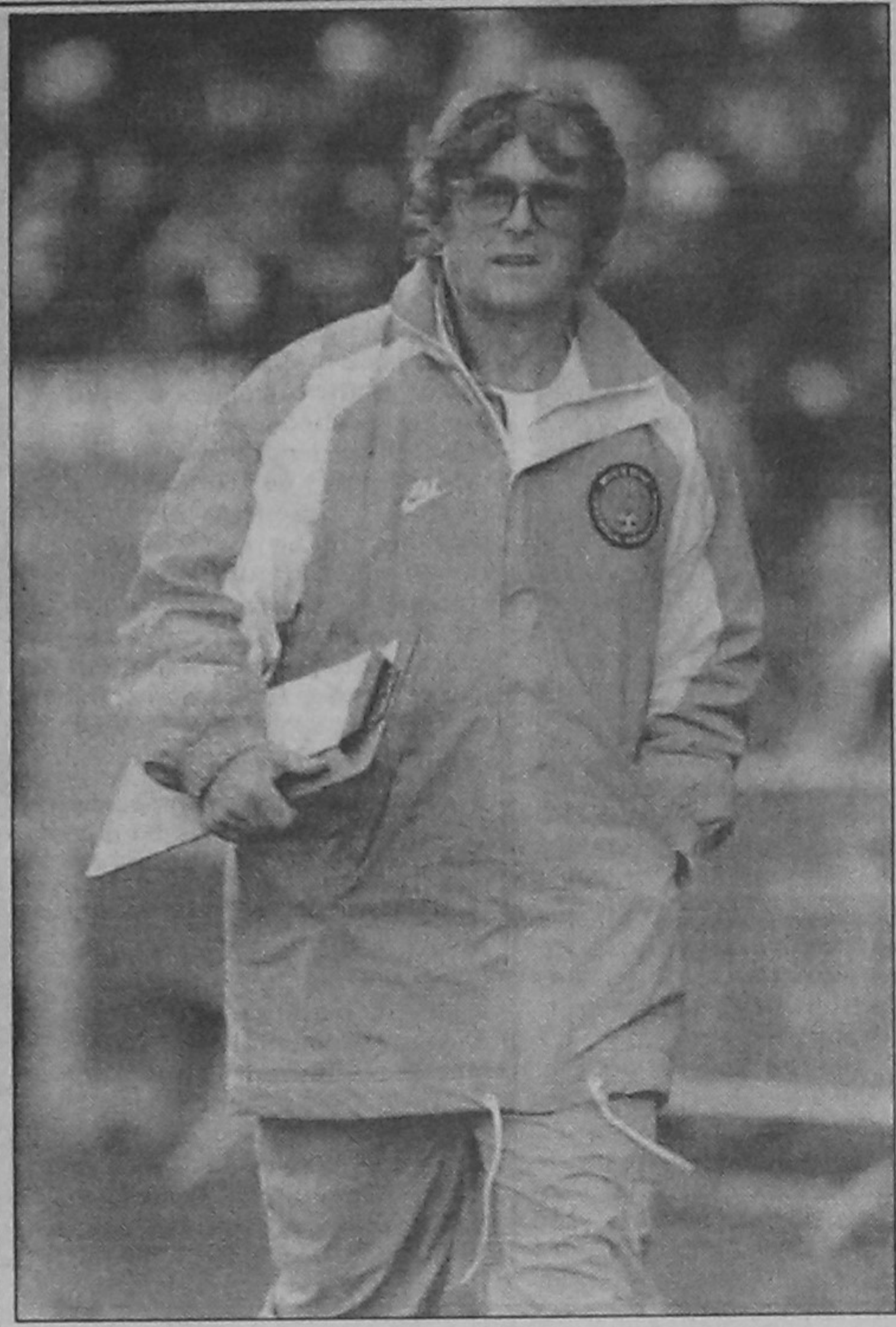
An AFP file photo of Yugoslav-born Bora Milutinovic.

Other matches see Real Sociedad play Oviedo and Alaves host Athletic Bilbao as eighth meets seventh.