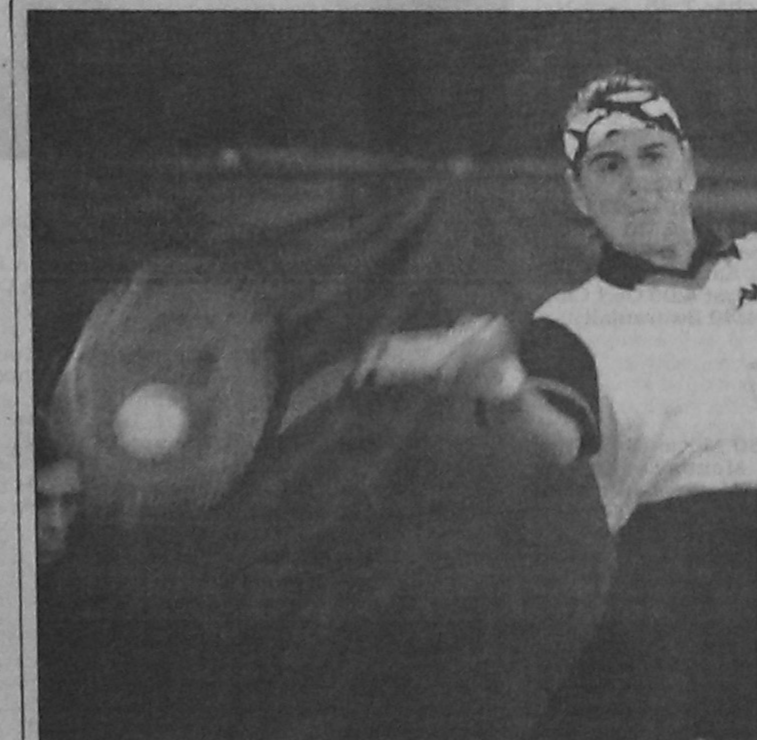
Spaniard Conchita Martinez plays forehand against Nathalie Dechy of France at the Australian women's hardcourt championship at Gold Coast yesterday.

Sunday: Arsenal v Leicester City (k/o 1600), Manchester City v Leeds United (k/o 1400) Monday: Liverpool v Blackburn (k/o 1945)