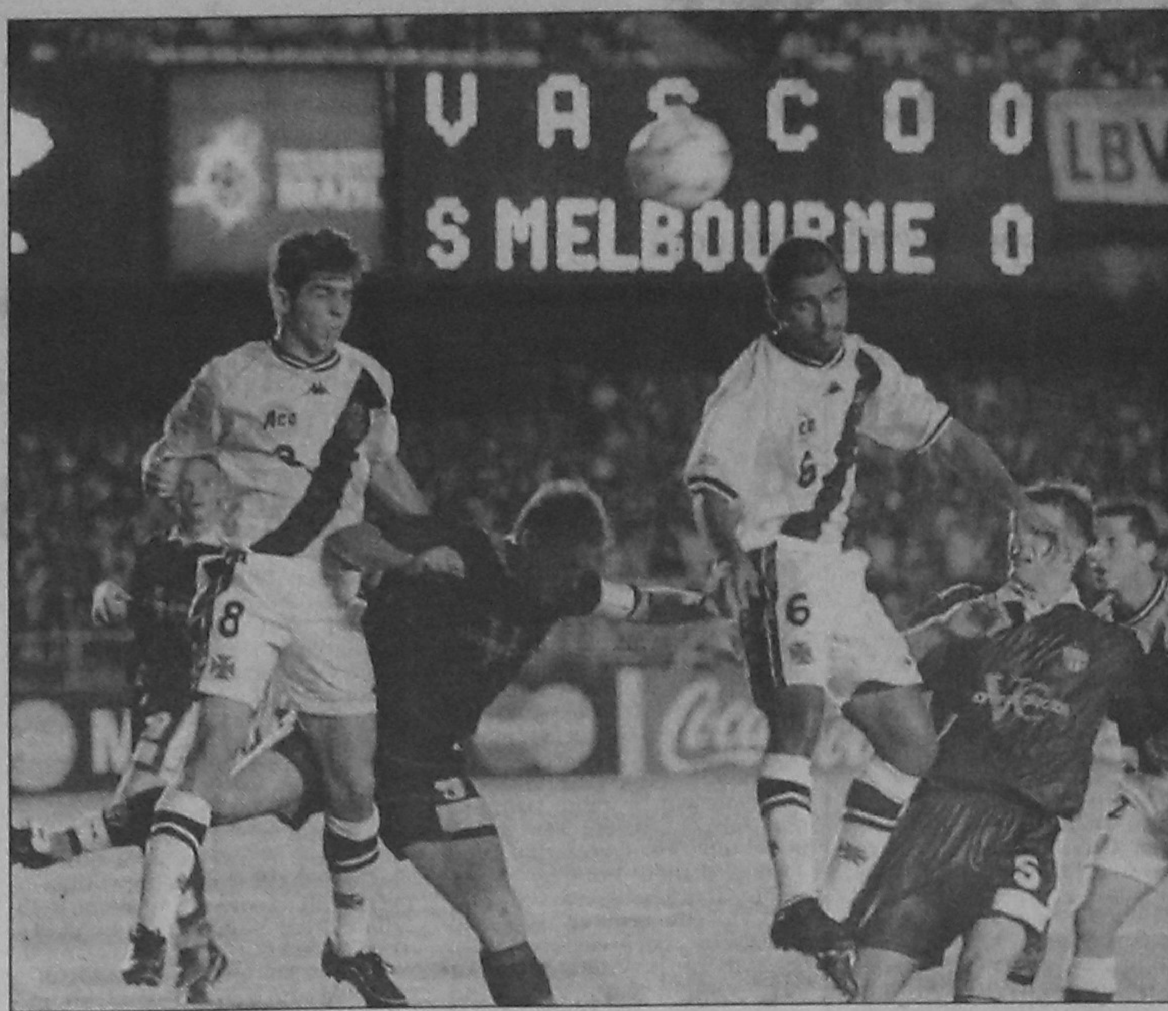
Vasco da Gama's Juninho and Felipe (white jerseys) threatening the South Melbourne goal during their World Club Championship clash in Rio de Janeiro on January 6.