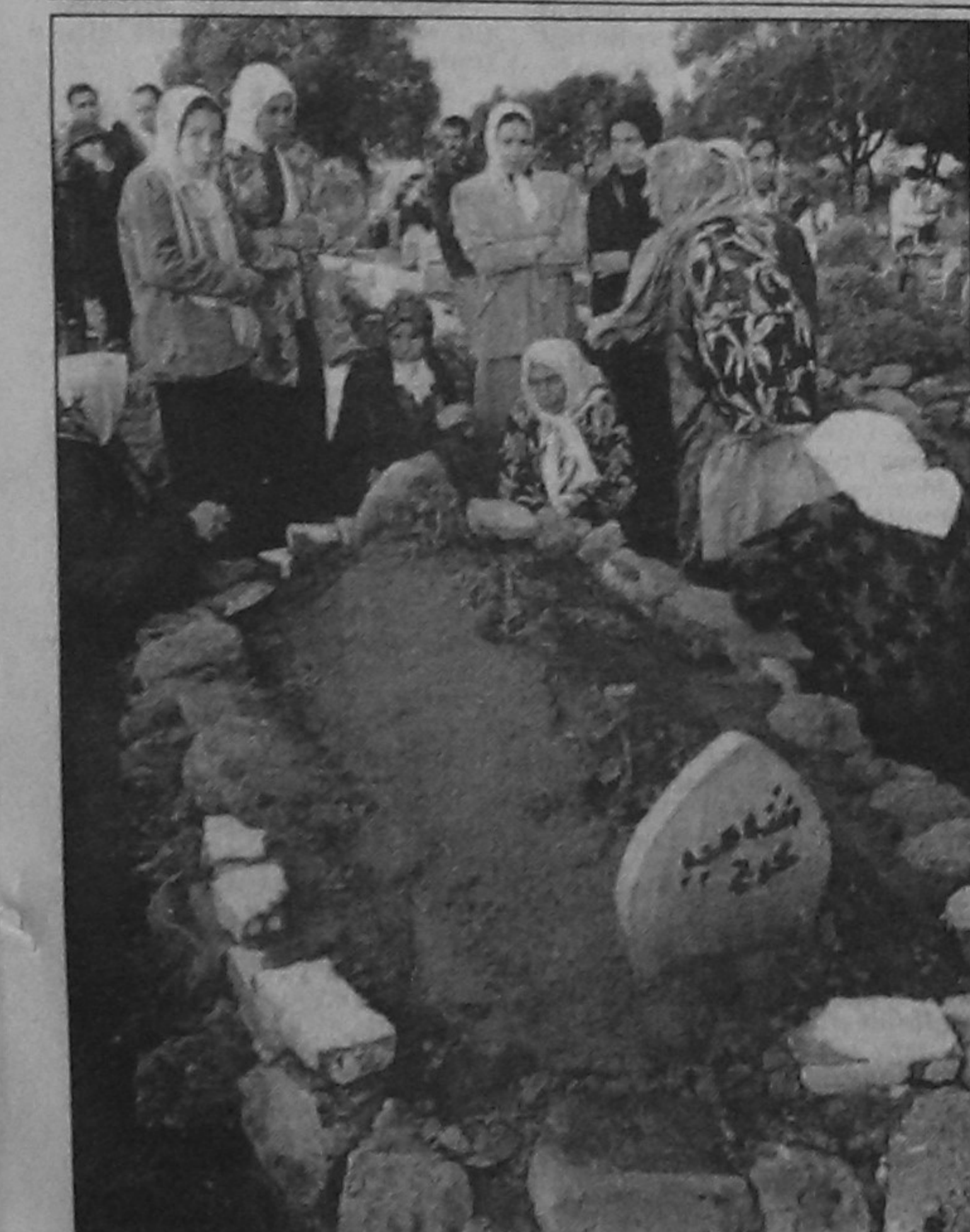
Algerian women gather in Bou Ismaïel's cemetery, around the grave of one of the member of their family killed during an attack which left 15 people dead last December. Algerians celebrate Eid-ul-Fitr yesterday.

All 33 journalists were killed either while on assignment or as a direct result of their work,