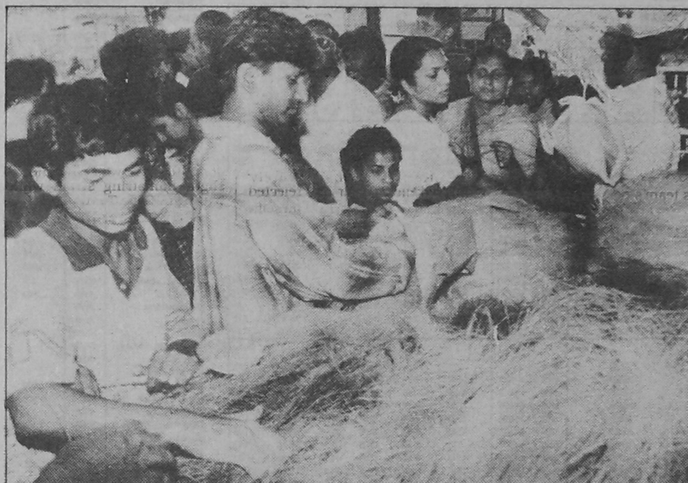
Sweetening the taste bud with shemai