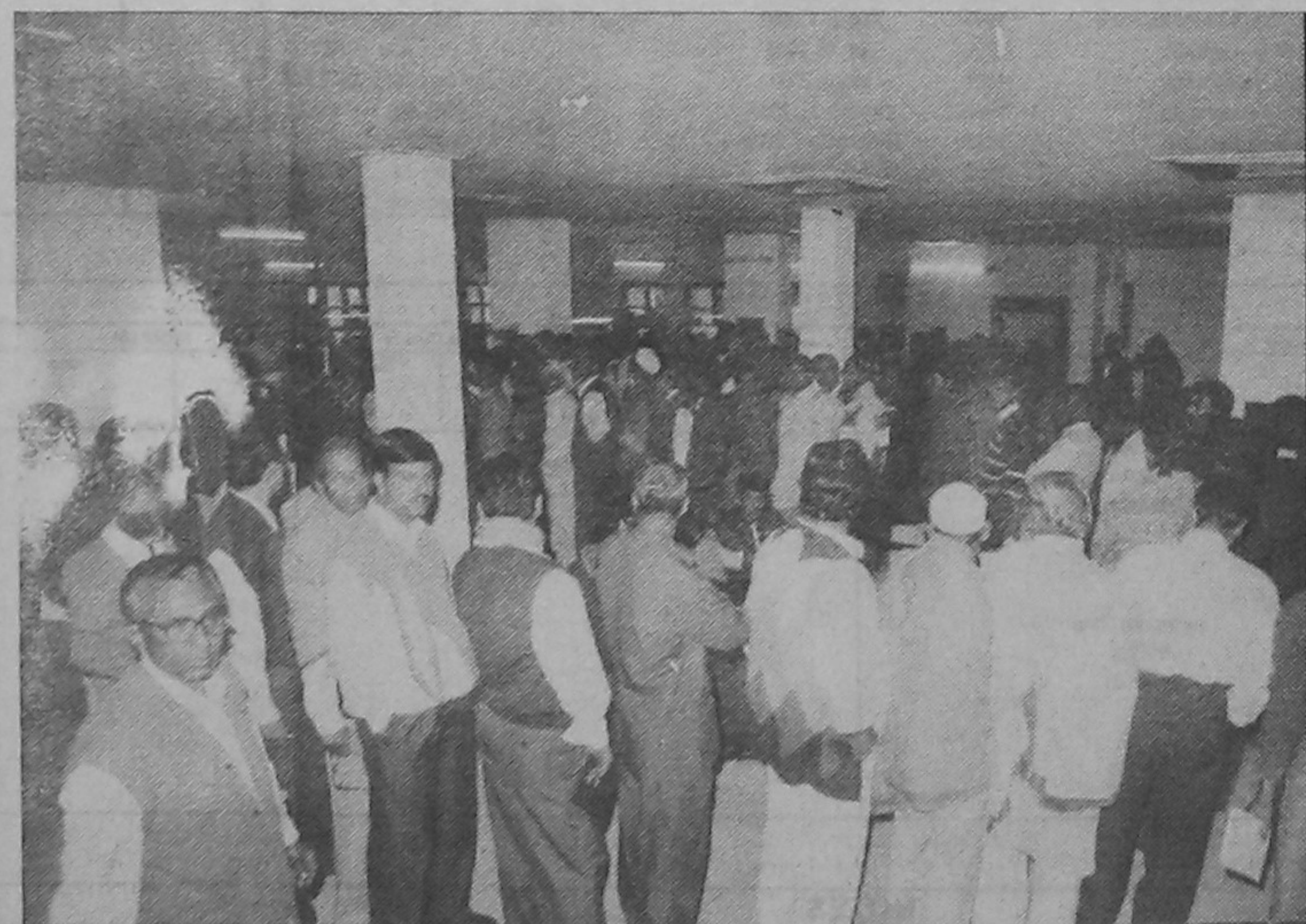
Money matters, doesn't it? A long queue at the cash counter