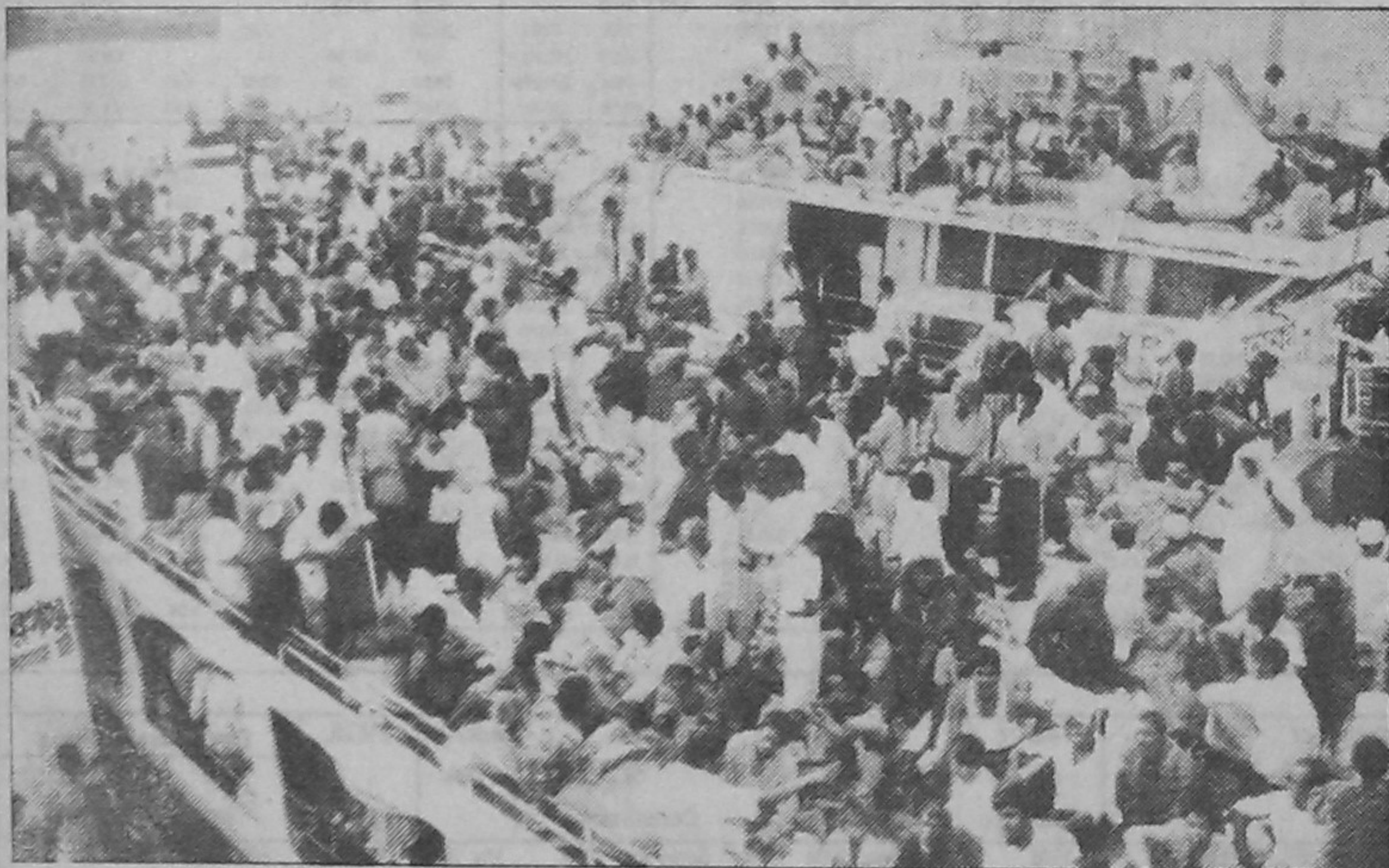
Mad rush for a place on the home-bound boat