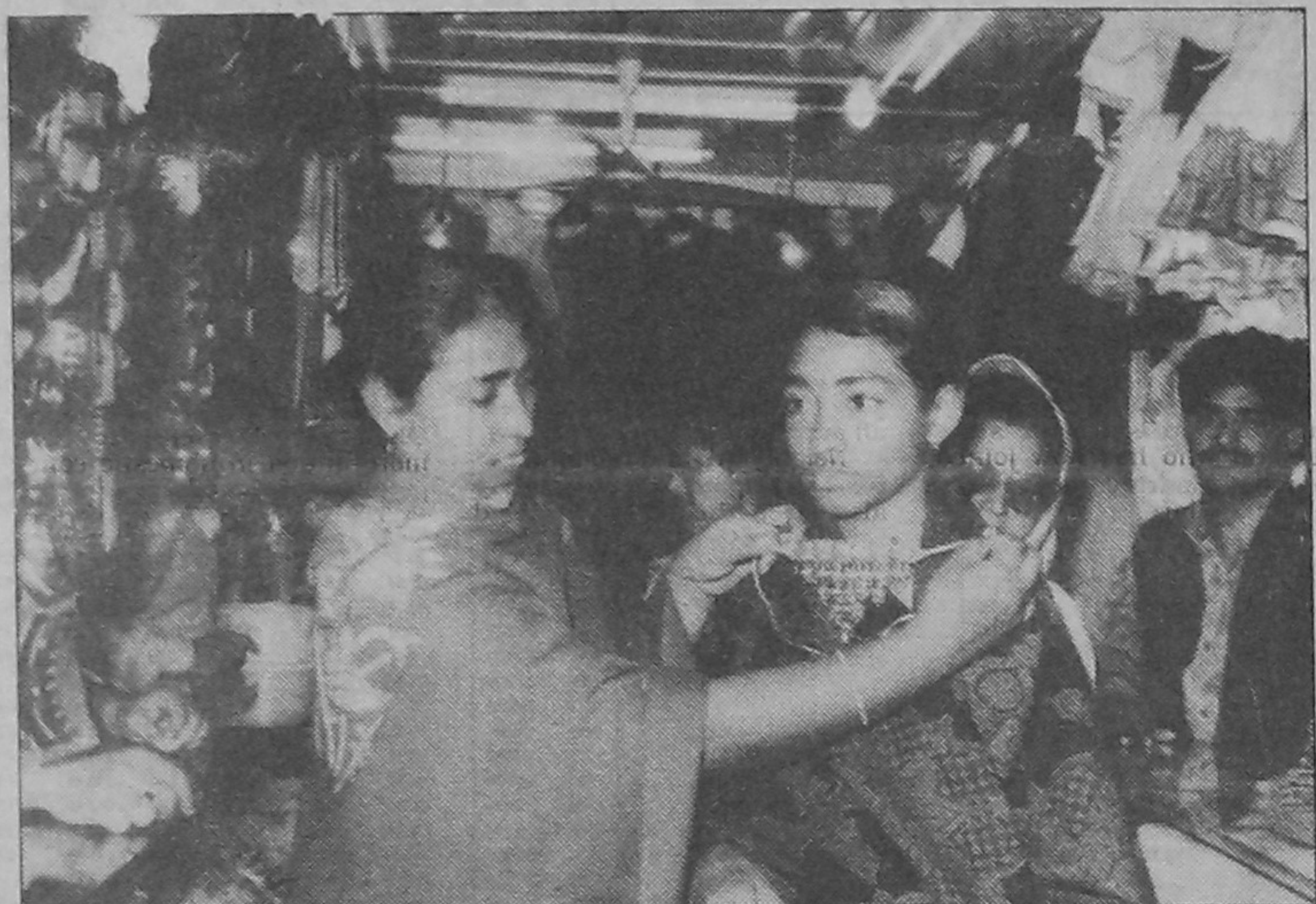
May not be of gold, jewellery nevertheless