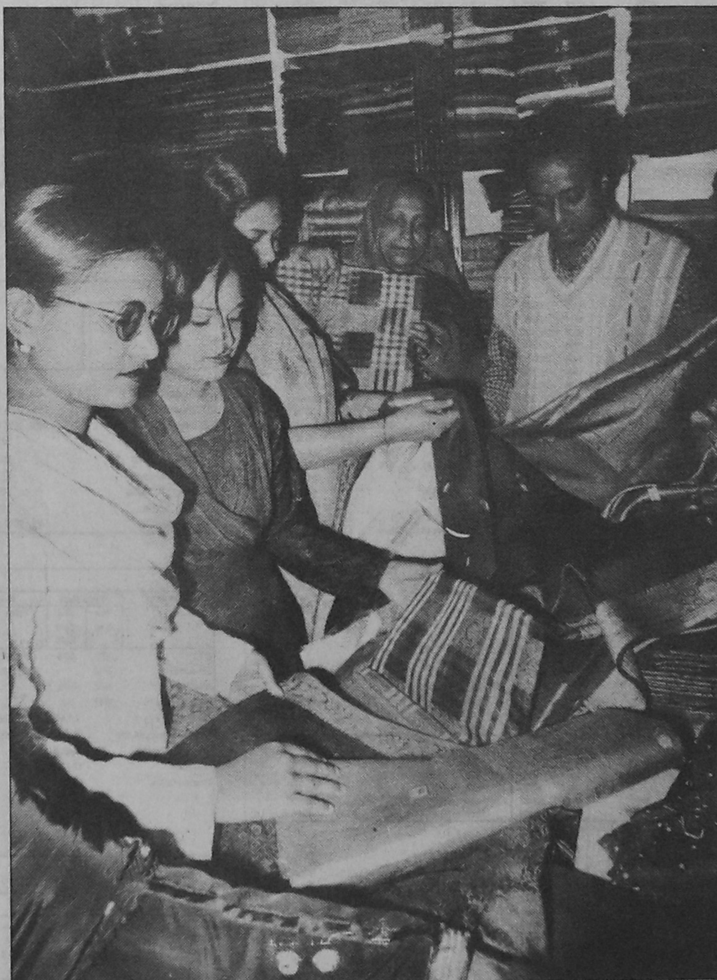
Reaching out for colour and design on fashionable fabric