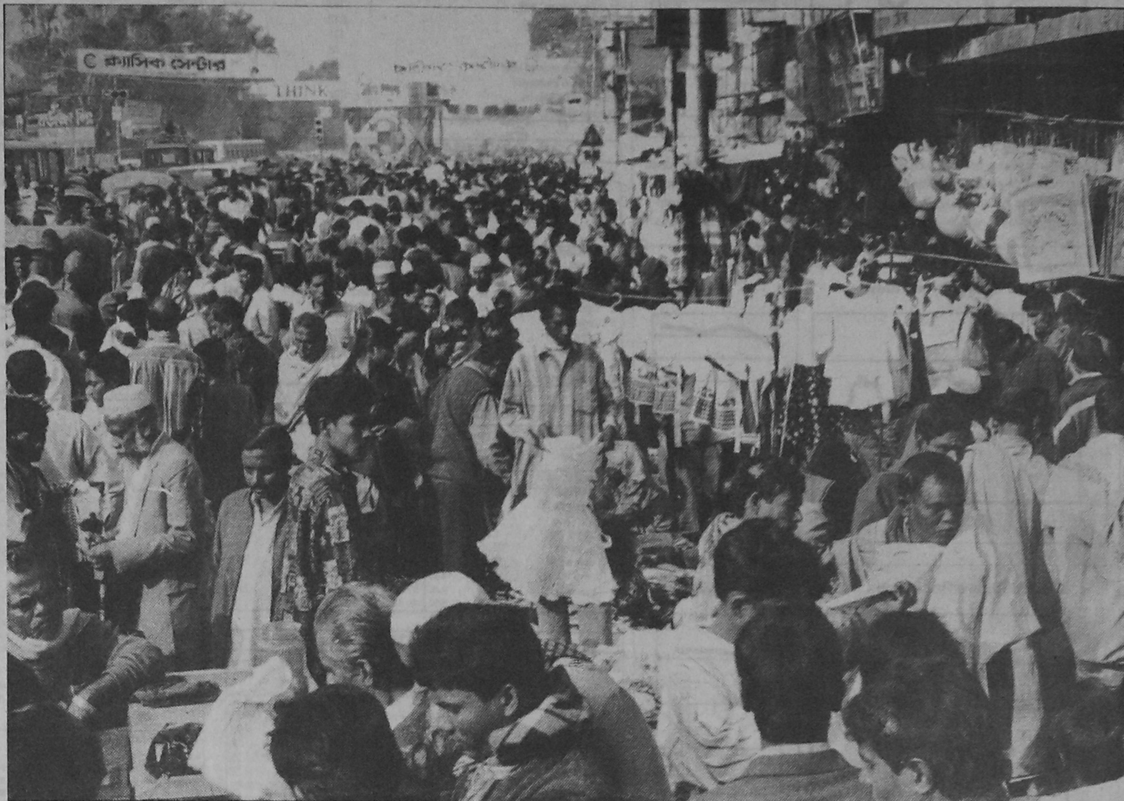
Under the open sky, on the side-walk, it's their own shopping mall