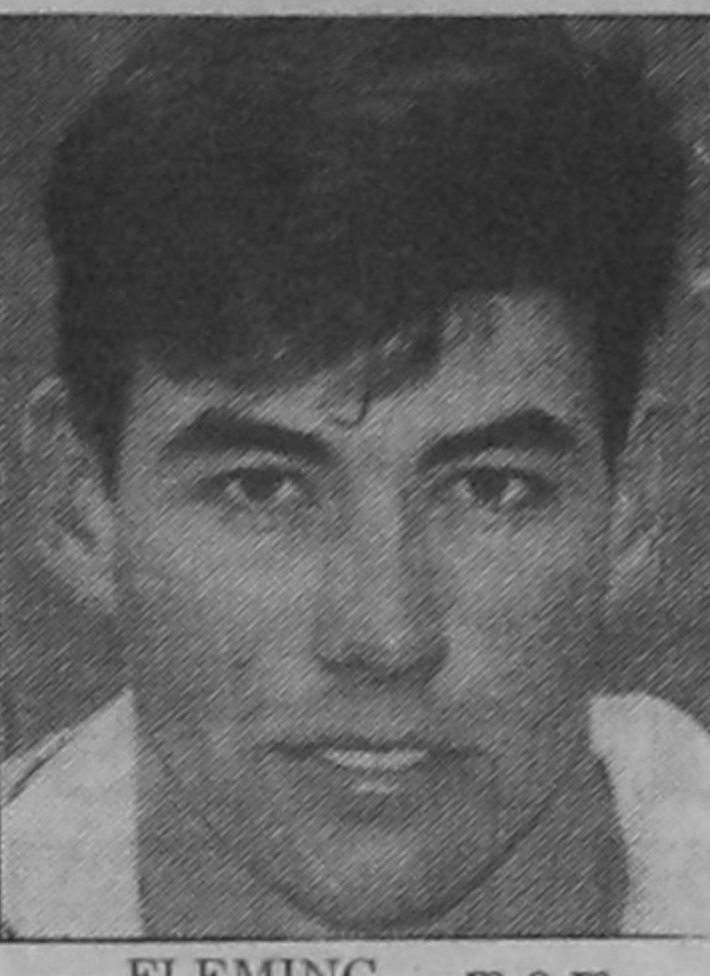
FLEMING ... m-o-m recovery. The loss was the West Indies' fifth in a row on their winless tour after two test losses to New Zealand. The fourth match of the series is at Wellington's new stadium on Saturday, when a 34,500 capacity crowd is expected for the venue's first big occasion. SCOREBOARD Scoreboard of the New Zealand-West Indies third one-day international in Napier on Thursday: WEST INDIES Campbell c Parore b Cairns 0

five behind John Wright. It was another limp batting performance by the tourists. Lara, after winning the toss and batting first, was sixth out for 30 which basically scuttled any slim hopes of a West Indies recovery. The loss was the West Indies' fifth in a row on their winless tour after two test losses to New Zealand.