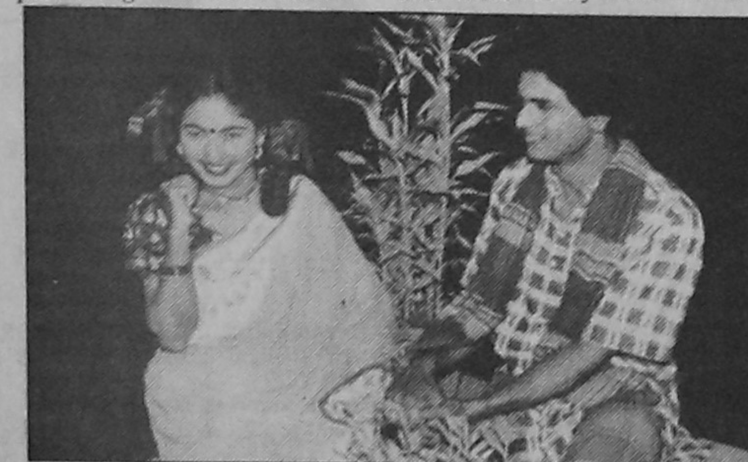
A scene from Priyatoma on TEN