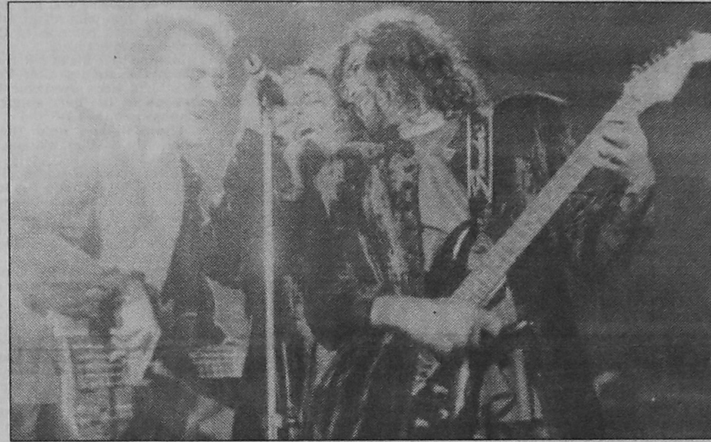
Junoon performing on TEN