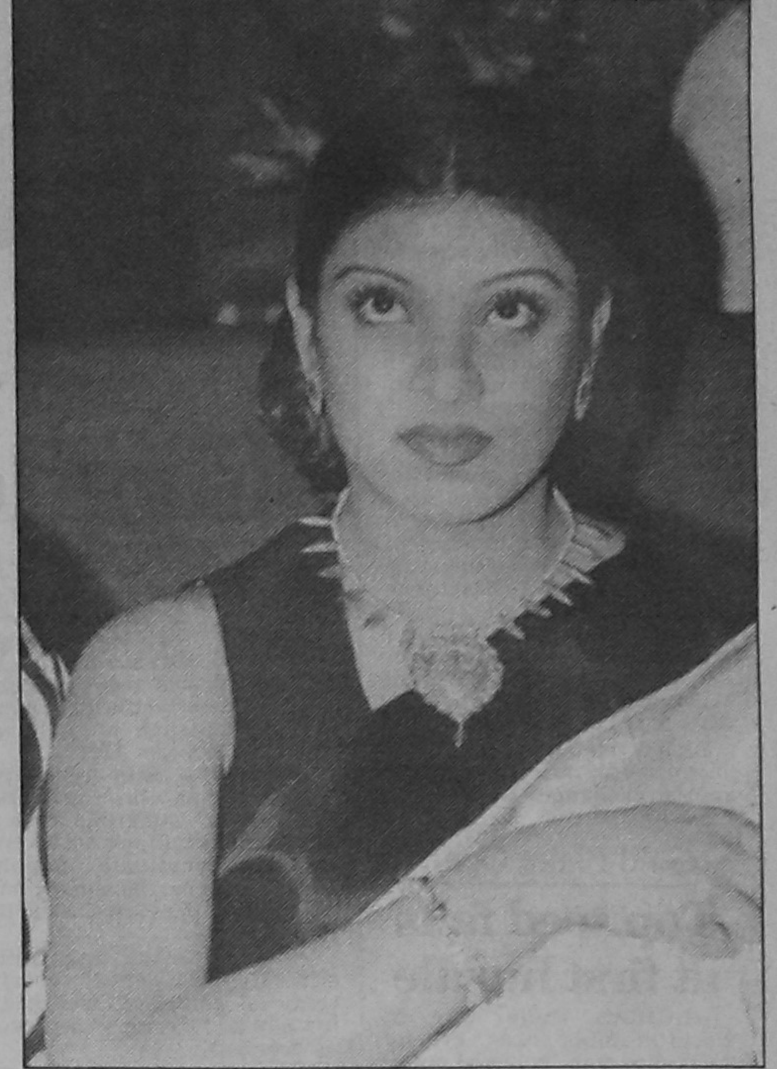
A scene from the drama Kusum Kata to be aired on Channel TEN on January 9.