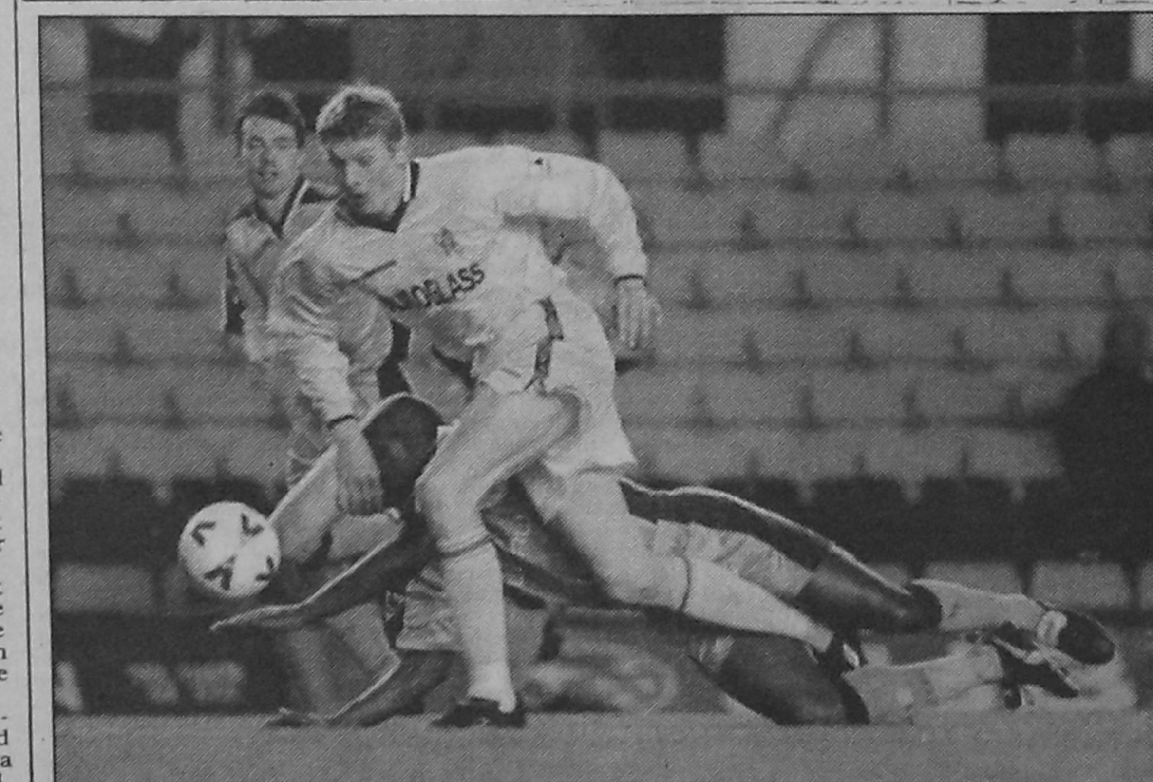
FLO IN FULL FLOW: Chelsea's Norwegian international striker Tore Andre Flo (in white), trying to battle his way past a diving Loventry defender Paul Williams during their Premiership encounter at Coventry on January 4.

Attempts to buy them at the advertised Internet address also proved fruitless, they said.