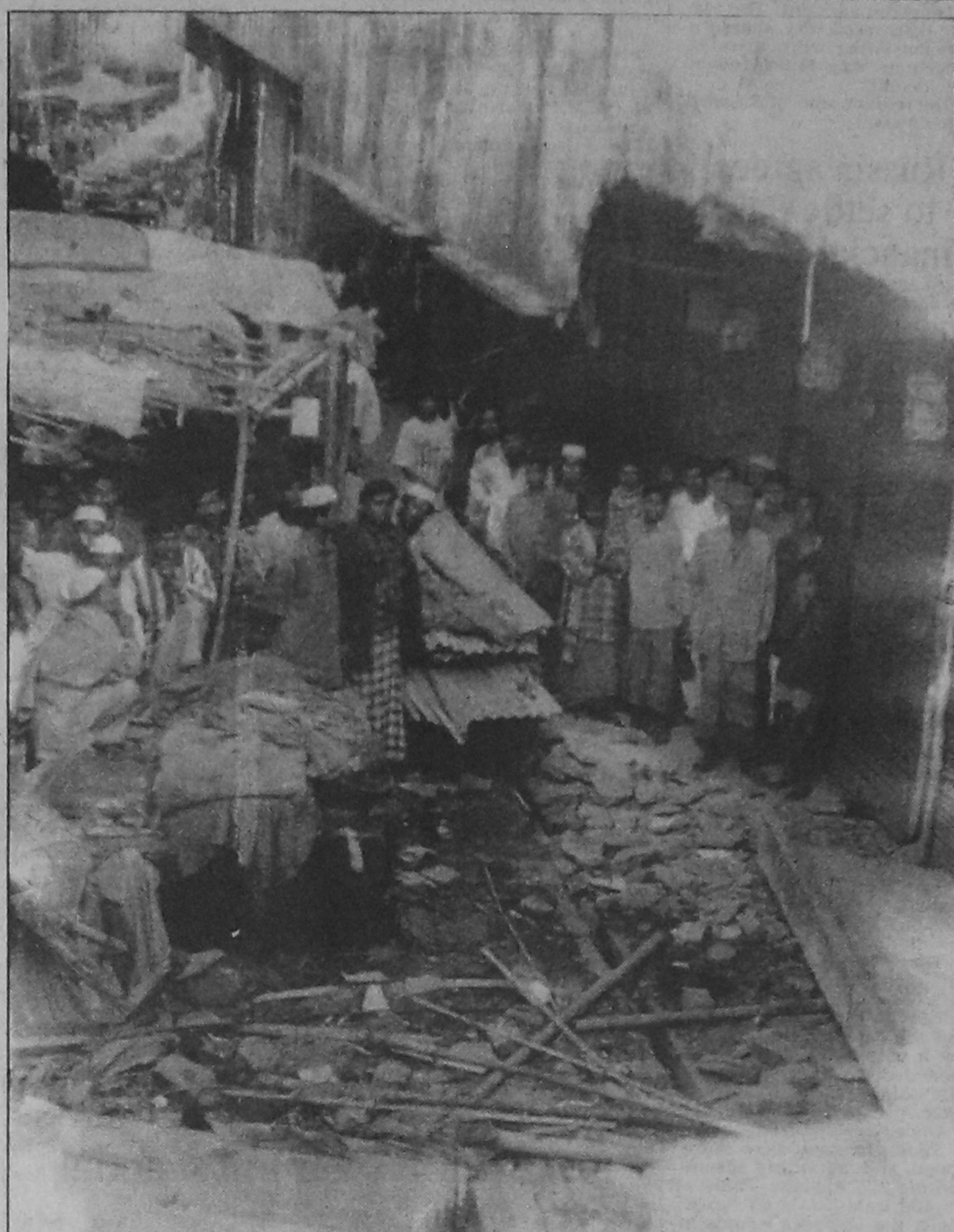
An under-construction building collapsed at Rayer Bazar in the city injuring five people yesterday.

By Special Correspondent The Dhaka City Corporation (DCC) has served a notice upon the lessee of the landing ghat (pier) on the south bank of the Turag river, asking him to explain why he had expanded the jetty upon the river bed. DCC sources said. The DCC notice followed a Daily Star report on December 31, 1999 on the encroachment on the river by the lessee, changing the river's course and threatening the Mirpur bridge. Since he had taken lease to facilitate the unloading of construction materials, he had expanded his landing ghat, encroaching upon the river bed, DCC officials confirmed. The Daily Star report after conducting their own probe. We conducted an investigation and found that the lessee had violated the agreement. The investigation was ordered in the wake of the report and subsequently the lessee was served with a notice on Sunday. He has been given seven days to reply, a DCC official said. The lessee was not available for comment. His lease is due to expire in June this year, the DCC official said.