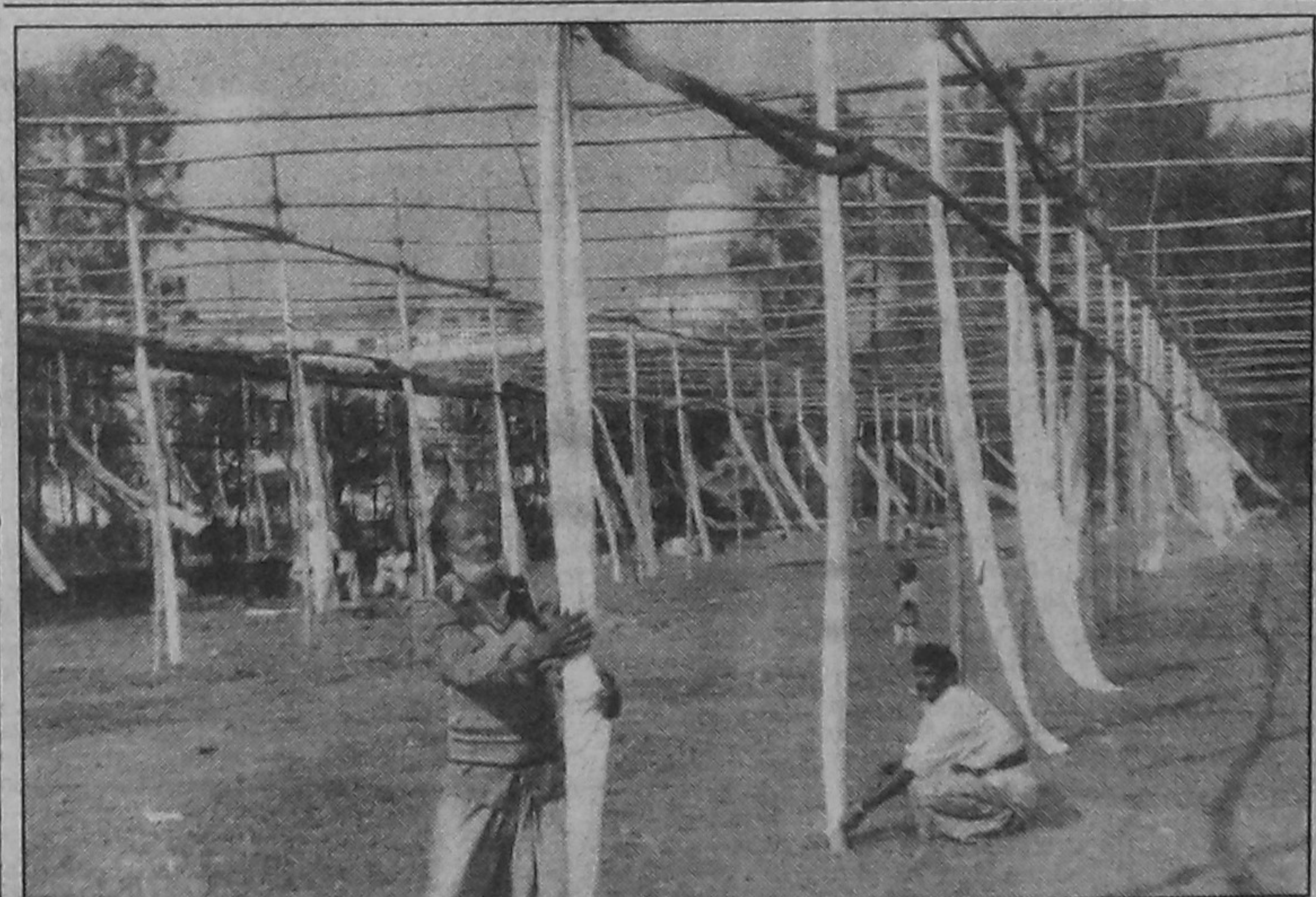
Preparations are on for the main Eid congregation at the National Eidgah in the city.

From page 1 Sagor-7. In a desperate bid to avoid collision, the huge passenger launch swerved left just to hit the three-decker Super-sonic on its rear. This sent the vessel on the path of Sagor-4, with fatal results. Sagor-4 hit the belly of Super-sonic with a loud bang. Sources concerned at Barisal said Super-sonic was badly damaged and four members of its crew were injured, two of them seriously. The two were admitted to Barisal Medical College Hospital. "Had there been the eid rush on board Super-sonic, casualties would be much higher," said a BIWTA official in Barisal quoting eyewitnesses. BIWTA officials at Sadarghat launch terminal in the city said they had no information about the accident. Neither Sagor-4 nor Sagor-7 of Howladar Navigation Co Ltd reported it to the authorities on arrival at Sadarghat. River port officials at Chandpur also said they did not know anything about the accident. Super-sonic came from Dhaka and halted at Chandpur before leaving for Barisal, they added.