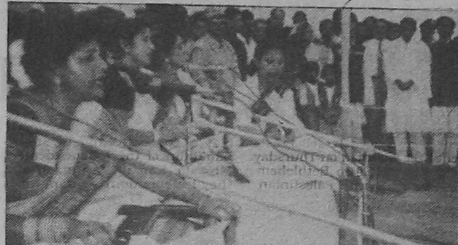
Artists rendering patriotic songs at a cultural function, arranged on the occasion of the inauguration of Chandpur Auditorium by Prime Minister Sheikh Hasina recently.