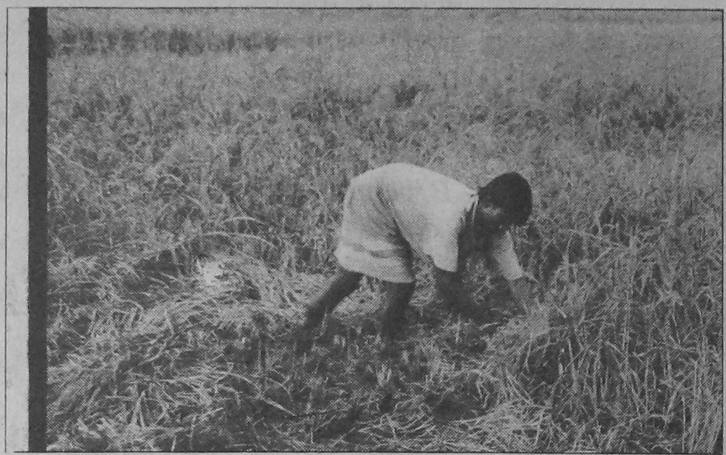
Golden paddy: Jhenidah farmers have achieved good production of Aman paddy this year despite heavy rains. Photo shows a delighted farmer harvesting the crop at village Roshimpur in Kaliganj.

They urged the authorities concerned to provide them warm clothes.