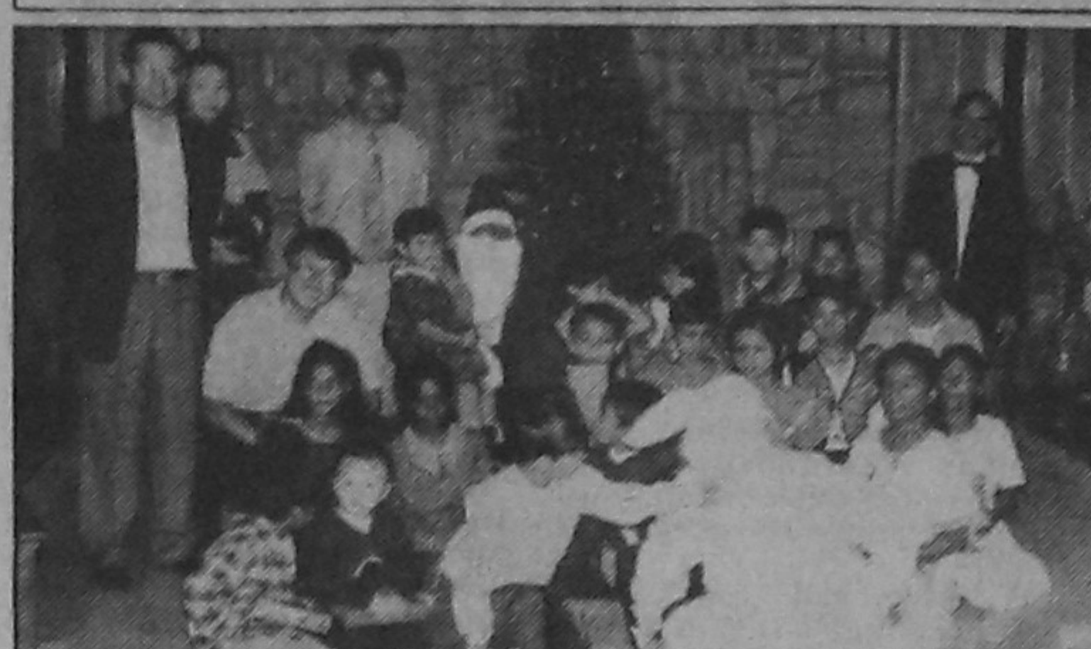
Santa Claus amid Bangladeshi and foreign children on the occasion of Merry Christmas, the birthday of Jesus Christ, at Hotel Agrabad in Chittagong.