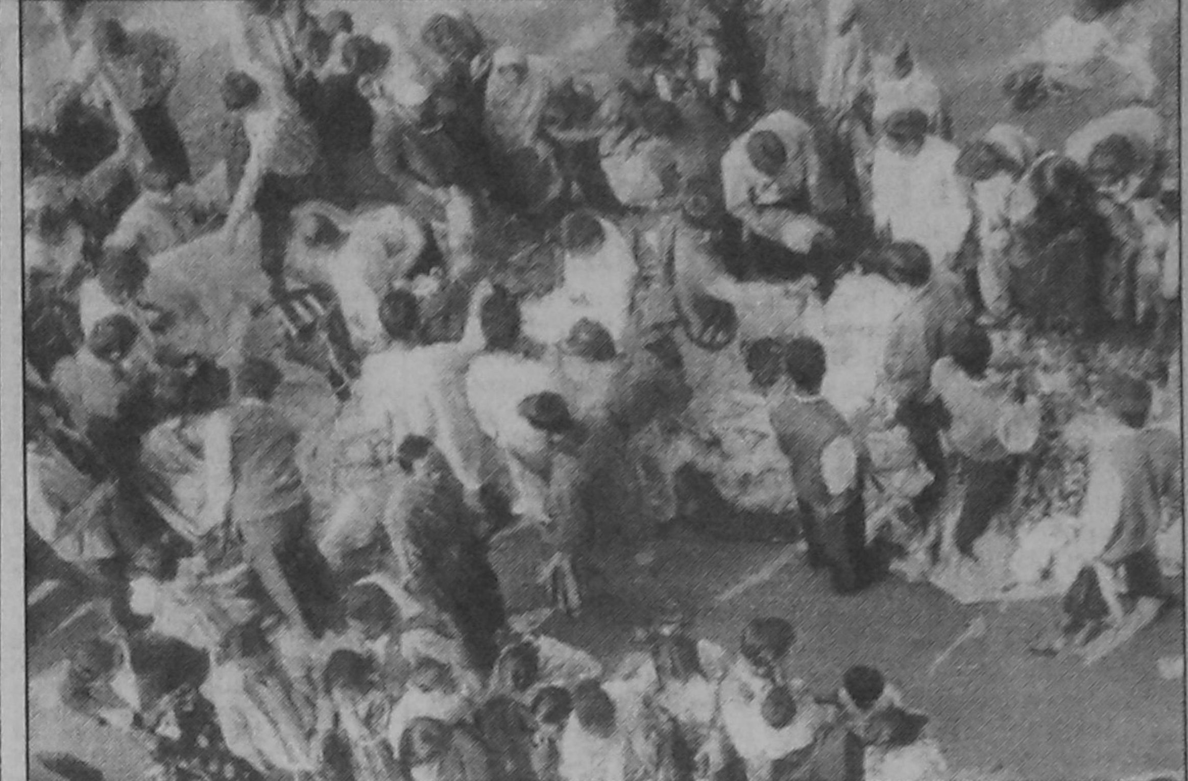
With only two or three more days left for the big occasion, sales on the footpath markets have reached its pinnacle, with buyers hurrying to finish up their shopping for Eid and head for home before the weekend ensues.

None was arrested in connection with the recovery.