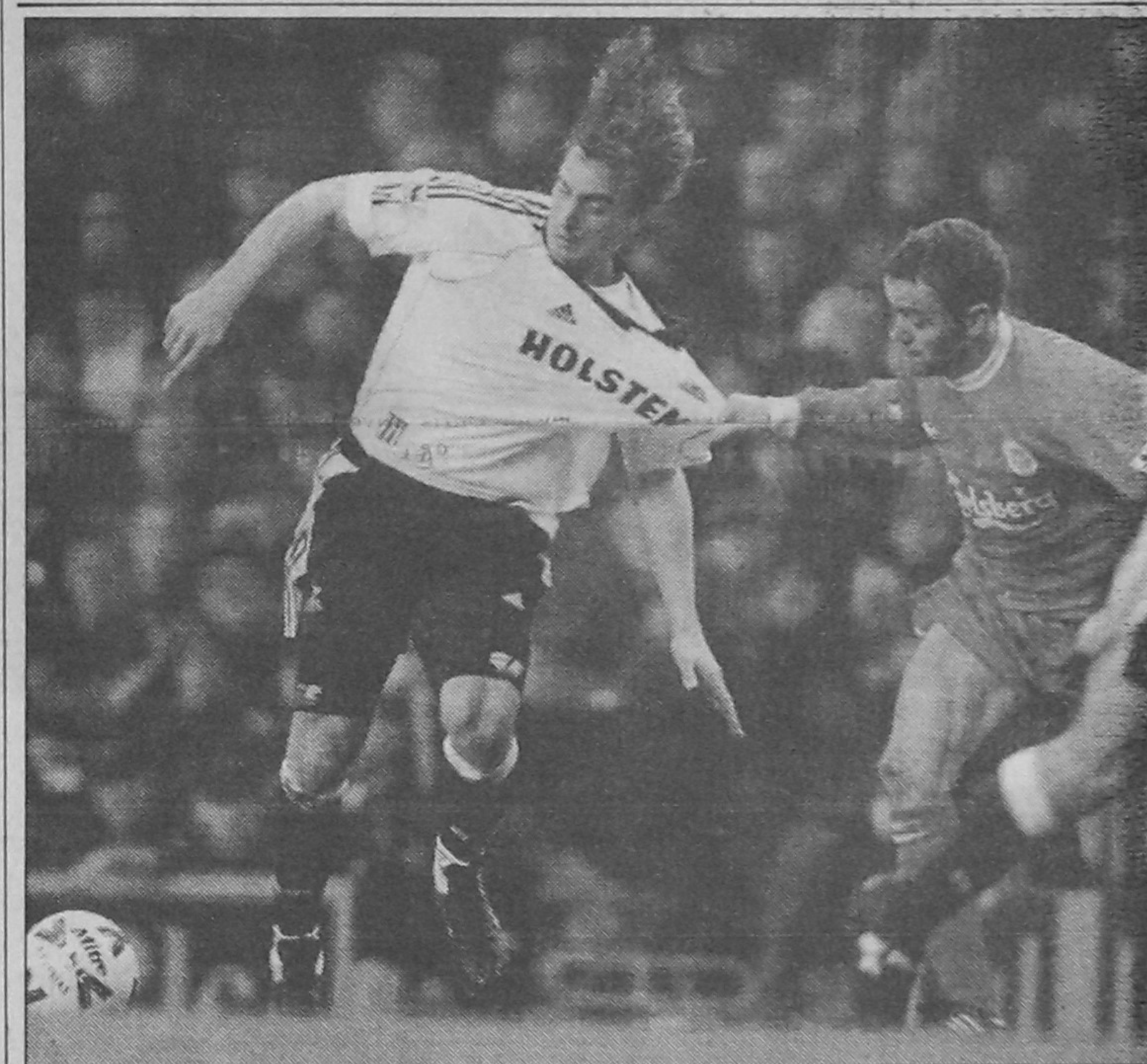
Liverpool's Vegard Heggem (R) holds back David Ginola of Tottenham Hotspur during their Premiership fixture at White Hart Lane on January 3.