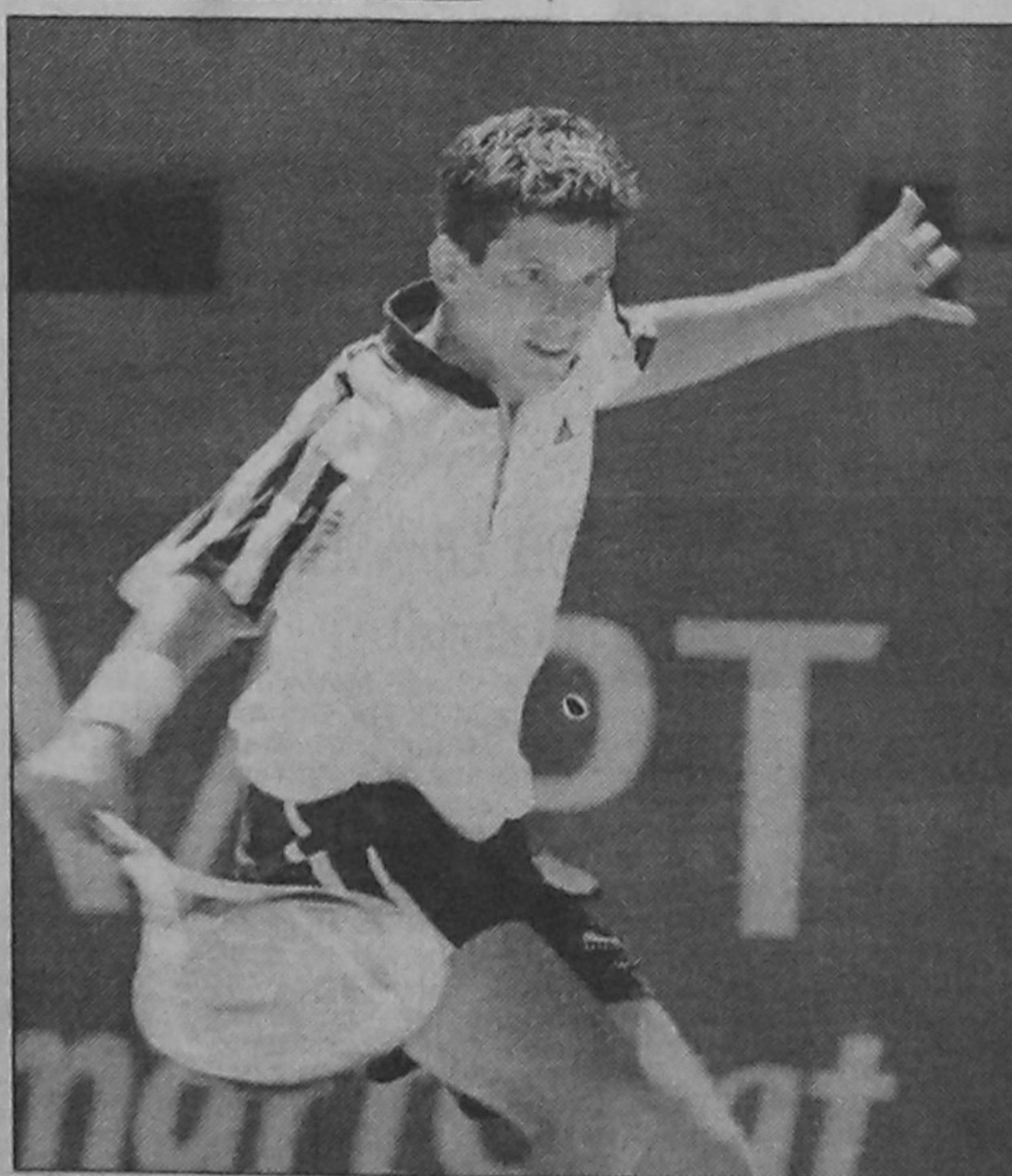
British Tim Henman in action against Spaniard Juan Balcells at the Hopman Cup yesterday.