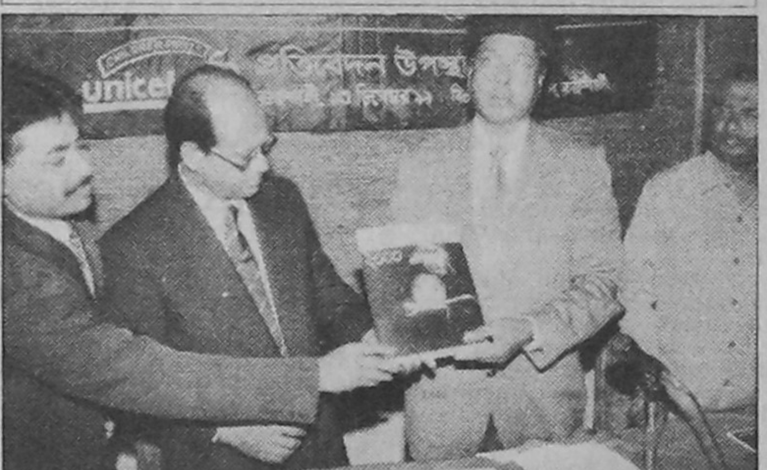
The launching ceremony of "State of the World Children" was held at a city hotel in Rajshahi on December 13. Khan Shahabuddin, Divisional Commissioner of Rajshahi inaugurated the ceremony.