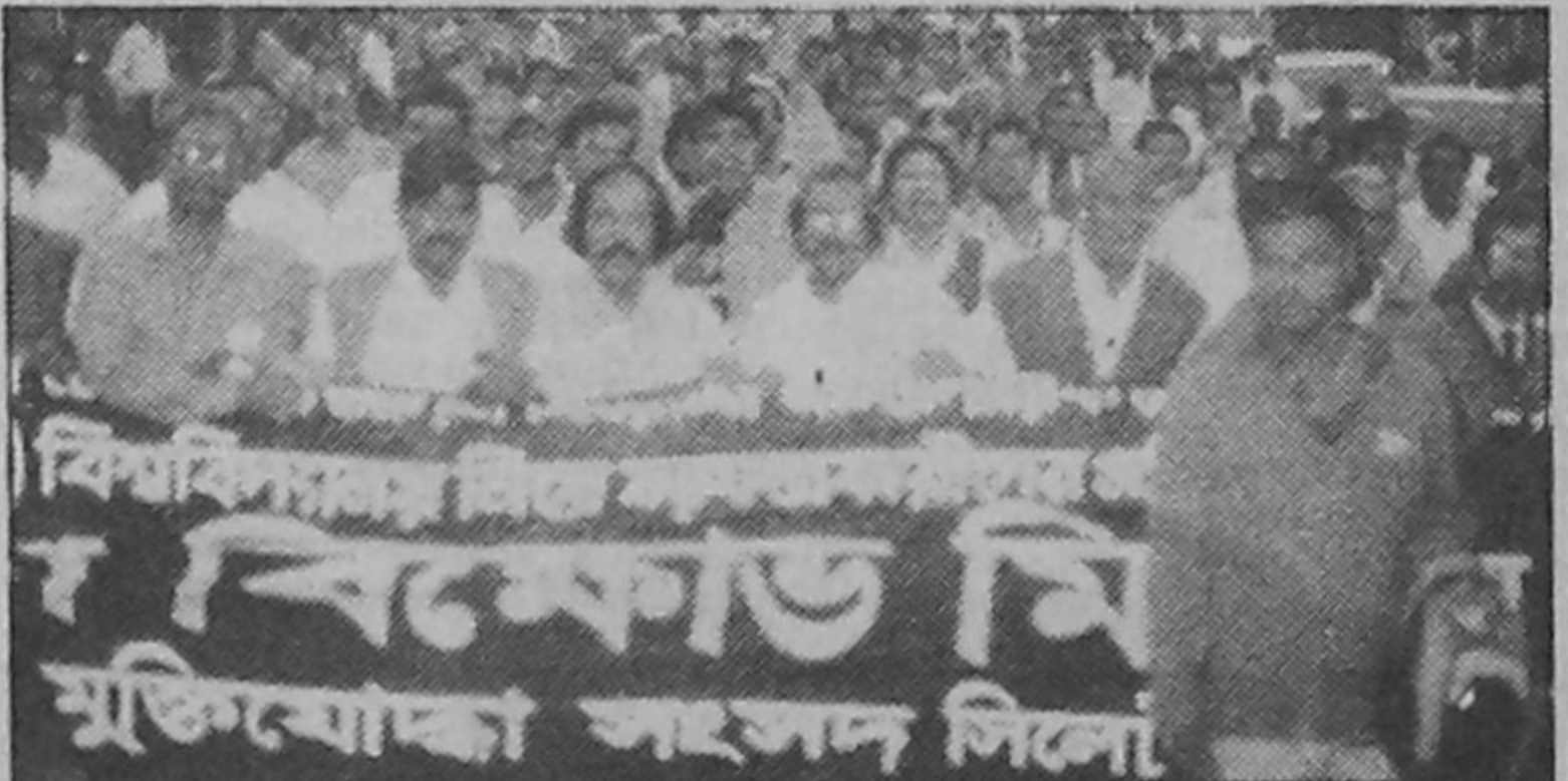
Freedom fighters' council of Sylhet district command brought out a procession in the town recently protesting the 'conspiracy' against Shahjalal University of Science and Technology.