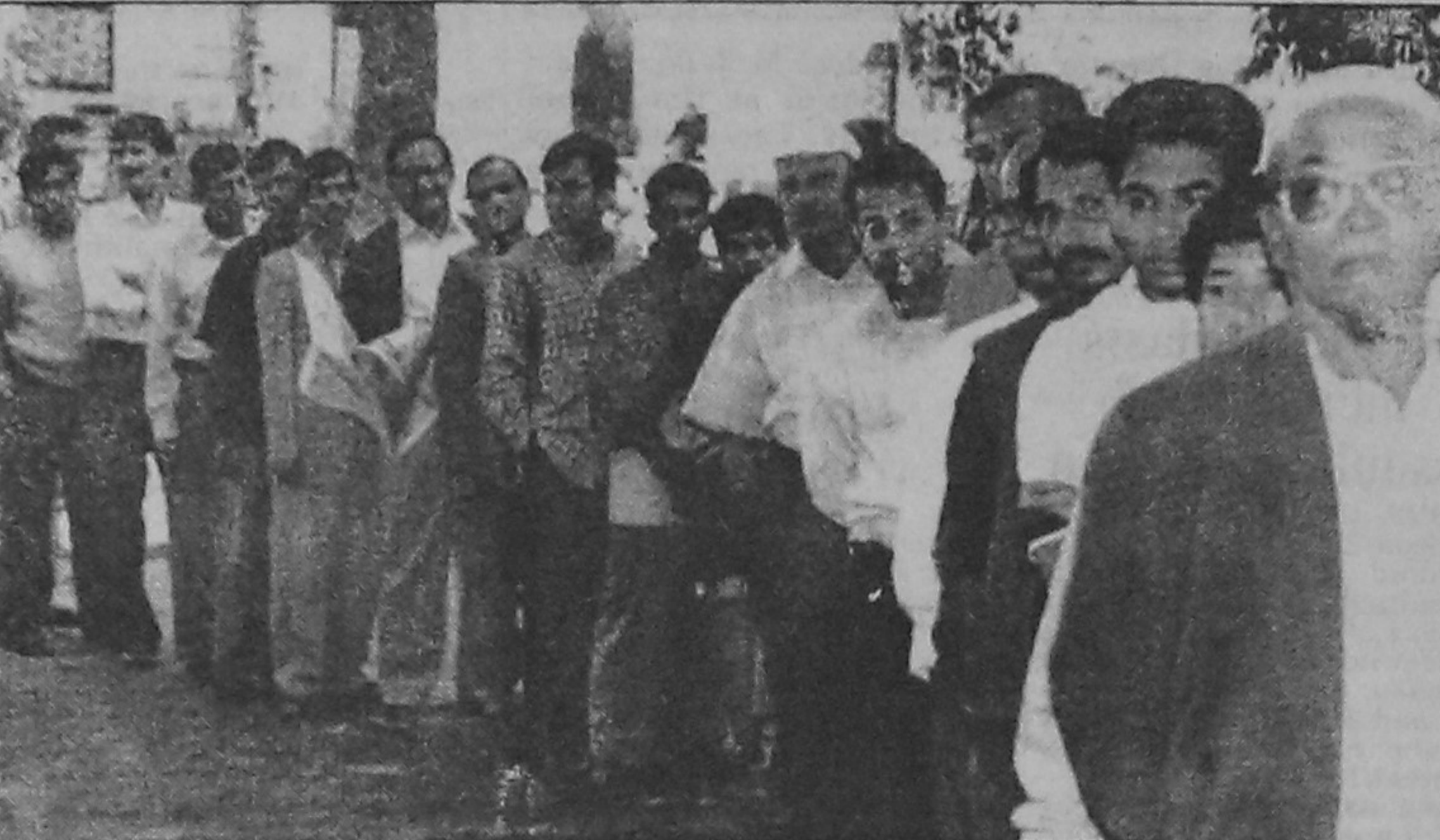
(Top) Voters run for cover after rival groups began fighting at UCEP School polling centre and (above) people queue to cast their votes at Doctor Khastagir Girls' School