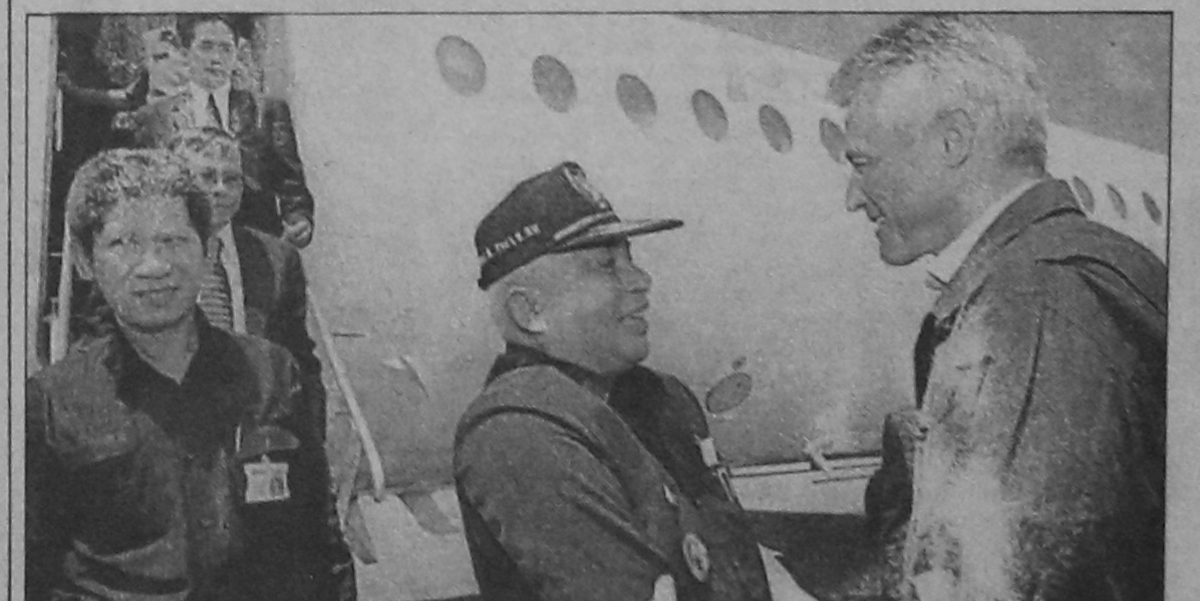
Chief of United Nation Transitional Administration in East Timor, Sergio Vieira de Mello (R), greets West Timor Governor, Piet A Tallo (C) shortly after Tallo arrived at Komoro airport in Dili yesterday, with a delegation from the Indonesian airline Merpati. The delegation arrived to take the first steps in restoring scheduled airline service between East Timor and Indonesia.

lowed to leave the northern Indian city of Amritsar, its first stop after being hijacked on Christmas Eve on a flight from Nepal to New Delhi.