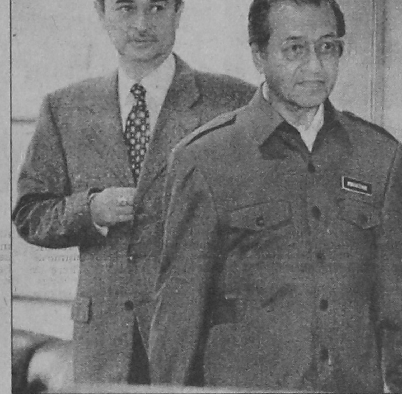
Malaysian Prime Minister Mahathir Mohamad (R) walks into the meeting room while being followed by Deputy Prime Minister Abdullah Ahmad Badawi before the UMNO Supreme Council meeting in Kuala Lumpur yesterday.

Mahathir said UMNO's annual general assembly -- which this year will vote on party leaders -- would be held on May 11-13, with the elections on the 11th.