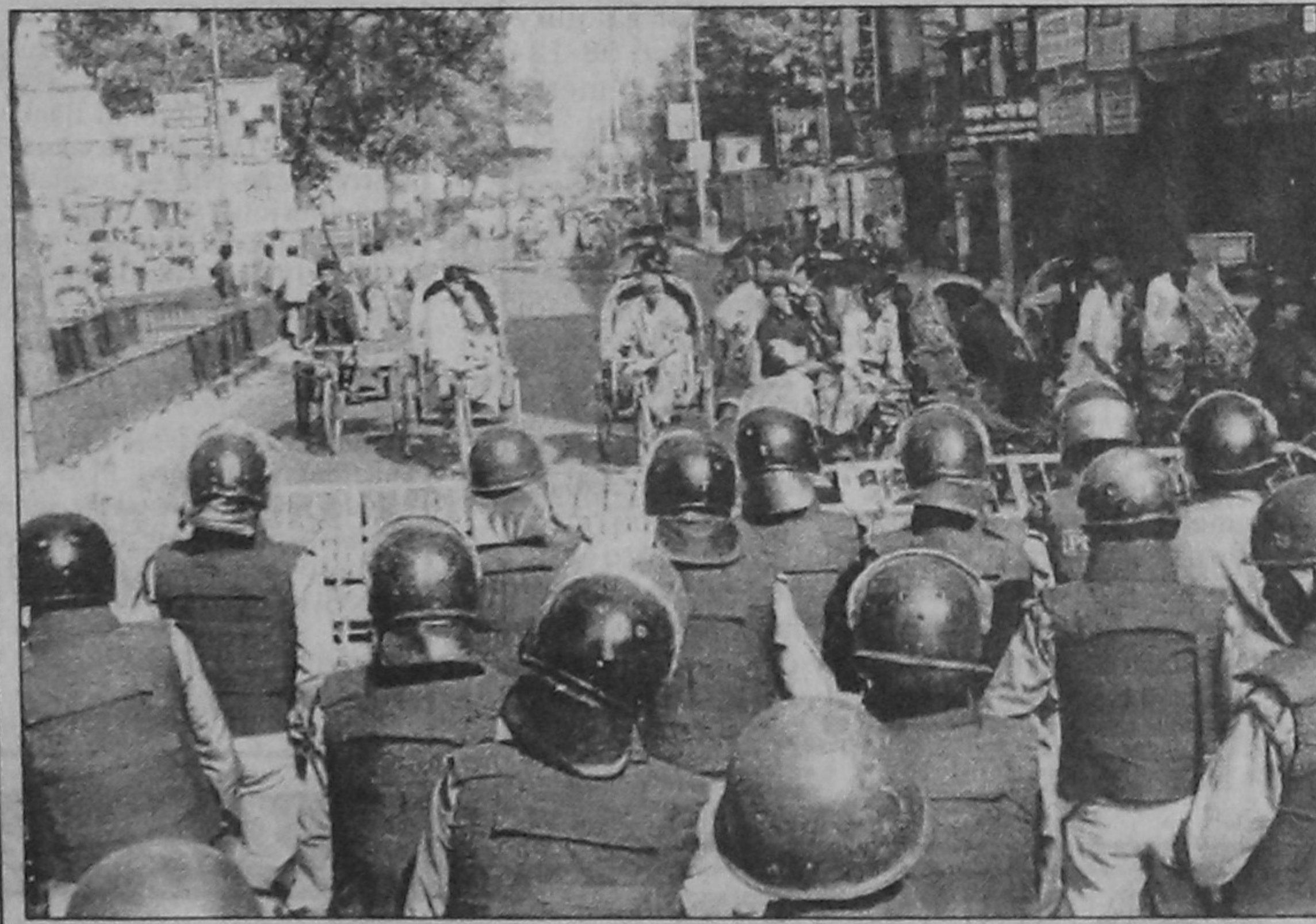
Police raised barbed-wire barricade on Bijoynagar road in the city during hartal yesterday.

Barrister Moudud Ahmed appeared on behalf of the petitioners and submitted that the cases have been lodged against the BNP leaders only to punish them for their political belief. He said the cases against the leaders are fabricated, baseless and manufactured.