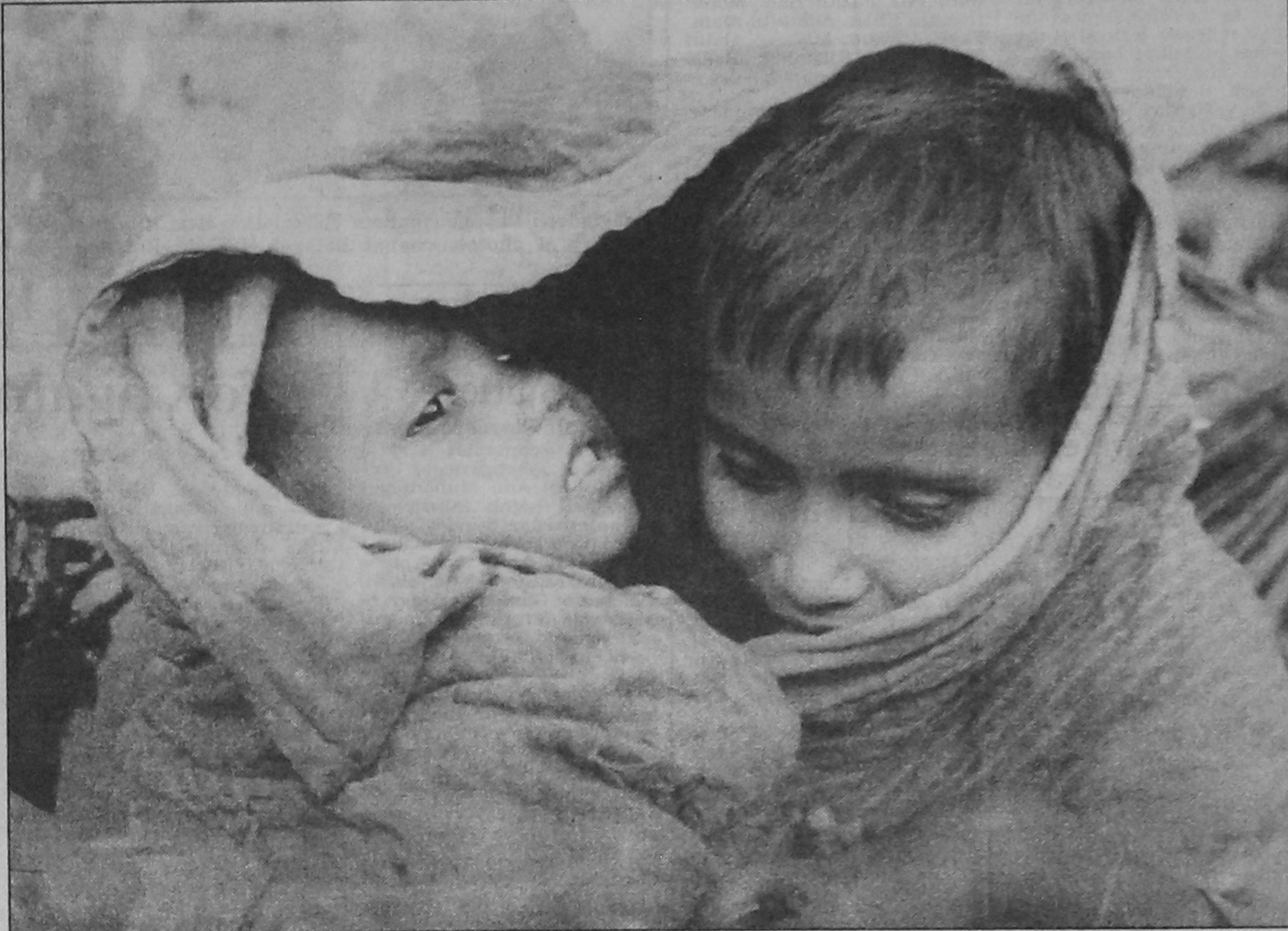
Two minor children struggle yesterday to cope with chilly morning on a city pavement as winter sets in more biting. Their only sin is they were born to poor parents.