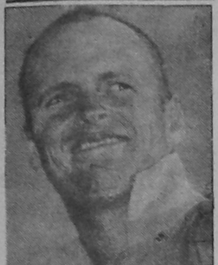
Gary Kirsten (South African opener) "You guys have put me under pressure." Speaking after scoring 275 against England last week.