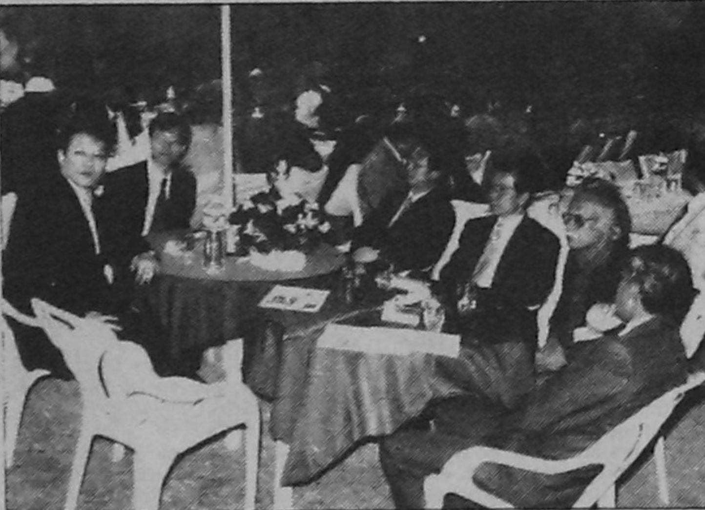
Korea International Cooperation Agency (KOICA) Dhaka office celebrated "KOICA alumni get-together '99" at a local Korean restaurant in Gulshan recently. Picture shows from left to right, Resident Representative KOICA, Counsellor, First Secretary, Ambassador of Korea and the guests at the function.

Taekwondo skills were performed by female instructors, Korean songs were sung by students of Korean Language Centre were presented at the cultural programme that followed the function.