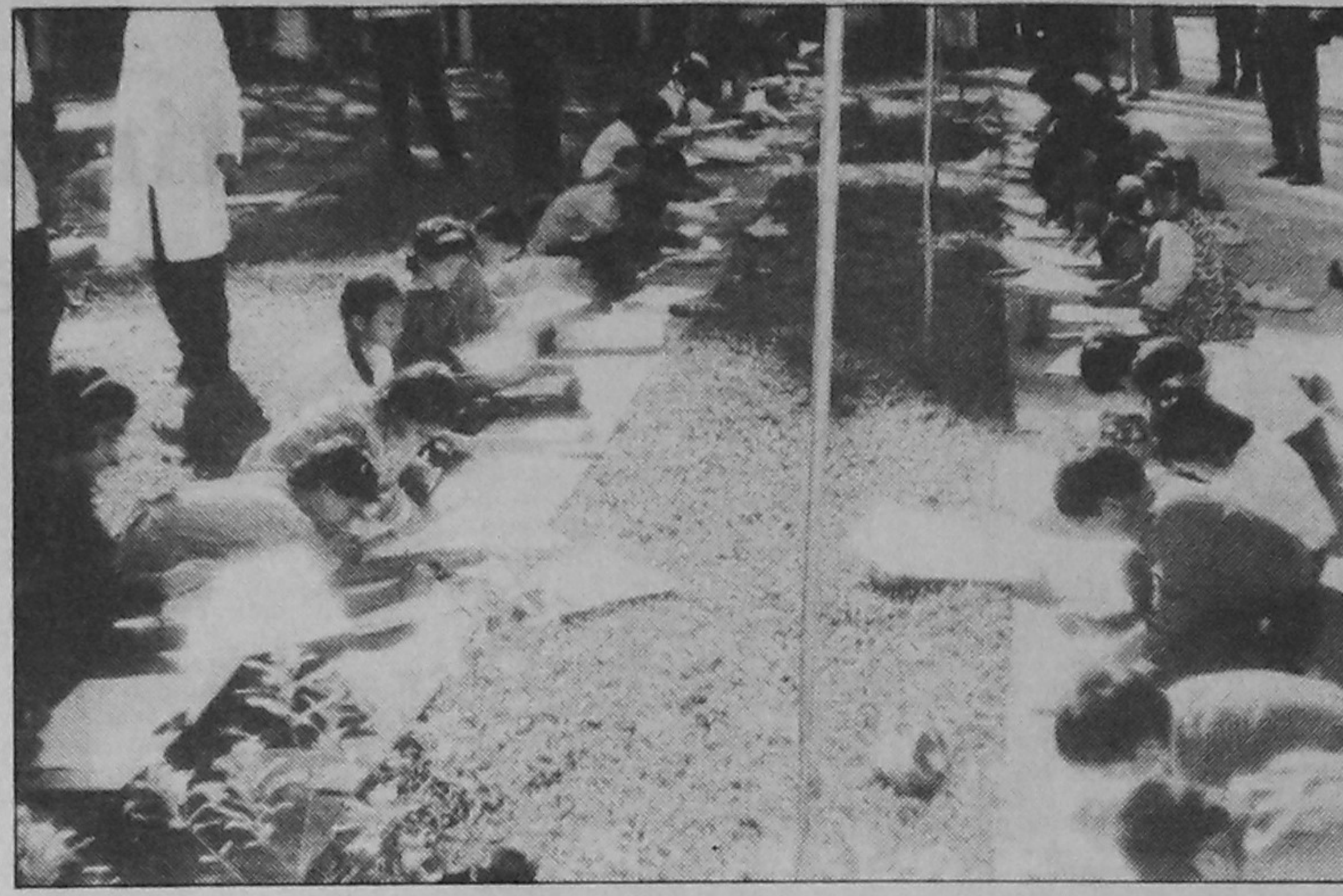
Osmani Museum, Sylhet arranged a drawing competition for children in observance of Victory Day.

Officials said the government steps would be implemented in two phases — the first during the current fiscal year and the last during the next fiscal year for which Tk 5 crore have already been allocated.