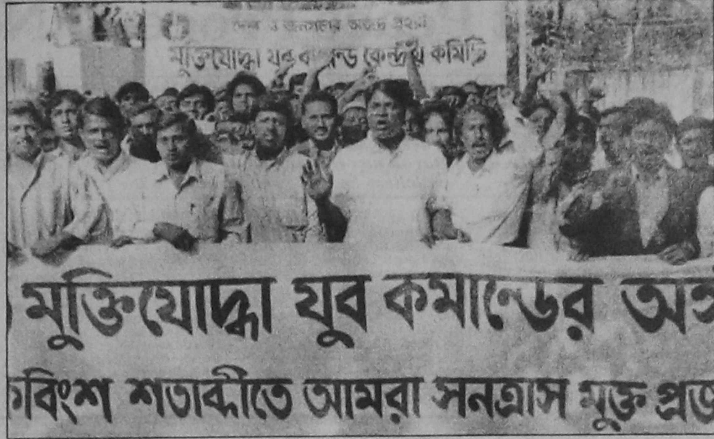
Muktijoddha Jubo Command brought out a procession welcoming the new millennium in the city yesterday.

A meeting of Bangladesh Krishak League Central committee will be held tomorrow at its central office at 23, Bangabandhu Avenue in the city with organisation president and State Minister for Land Rashed Mosharrat in the chair, reports BSS.