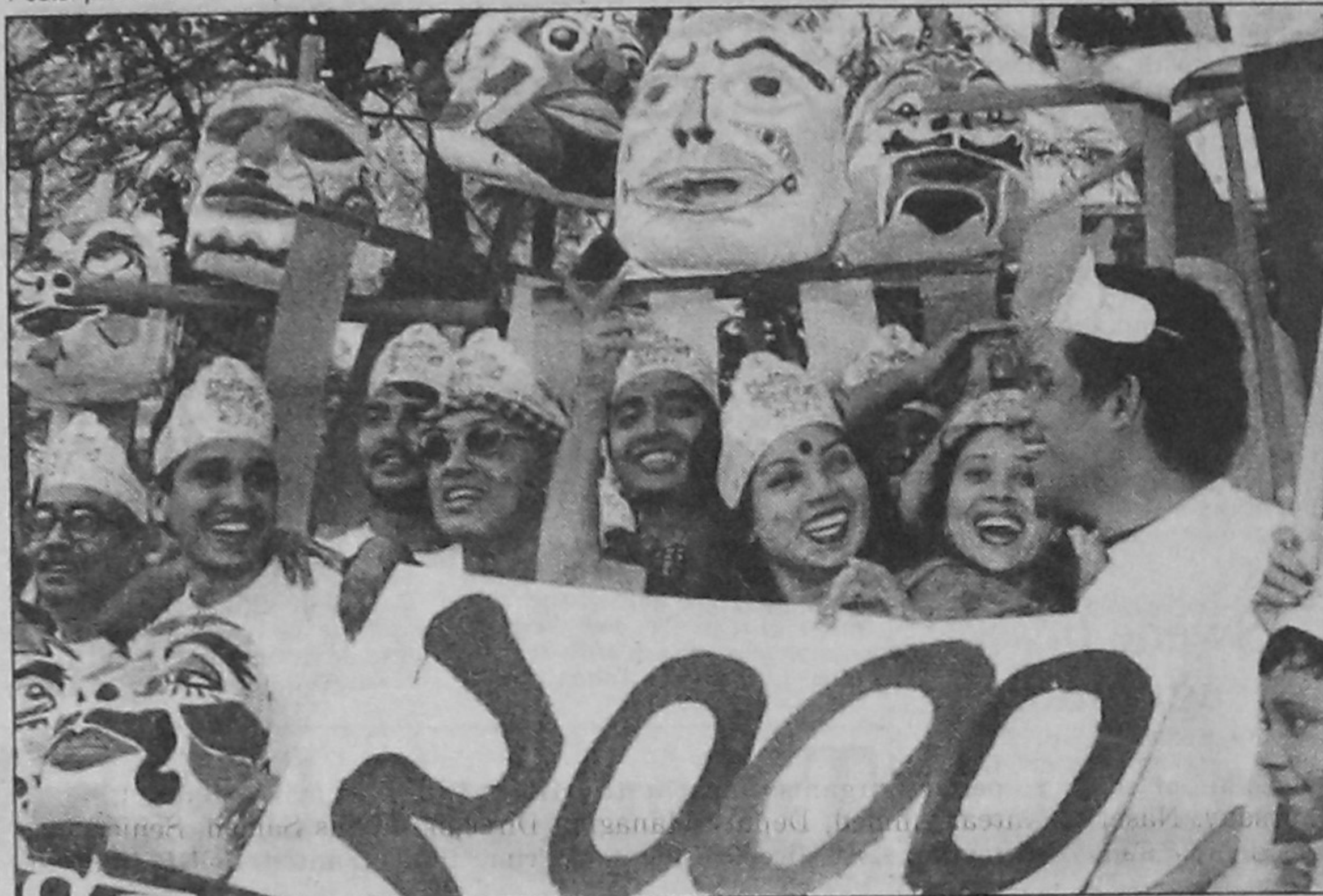
Nagarik Nattyangan brought out a colourful rally on their founding anniversary.