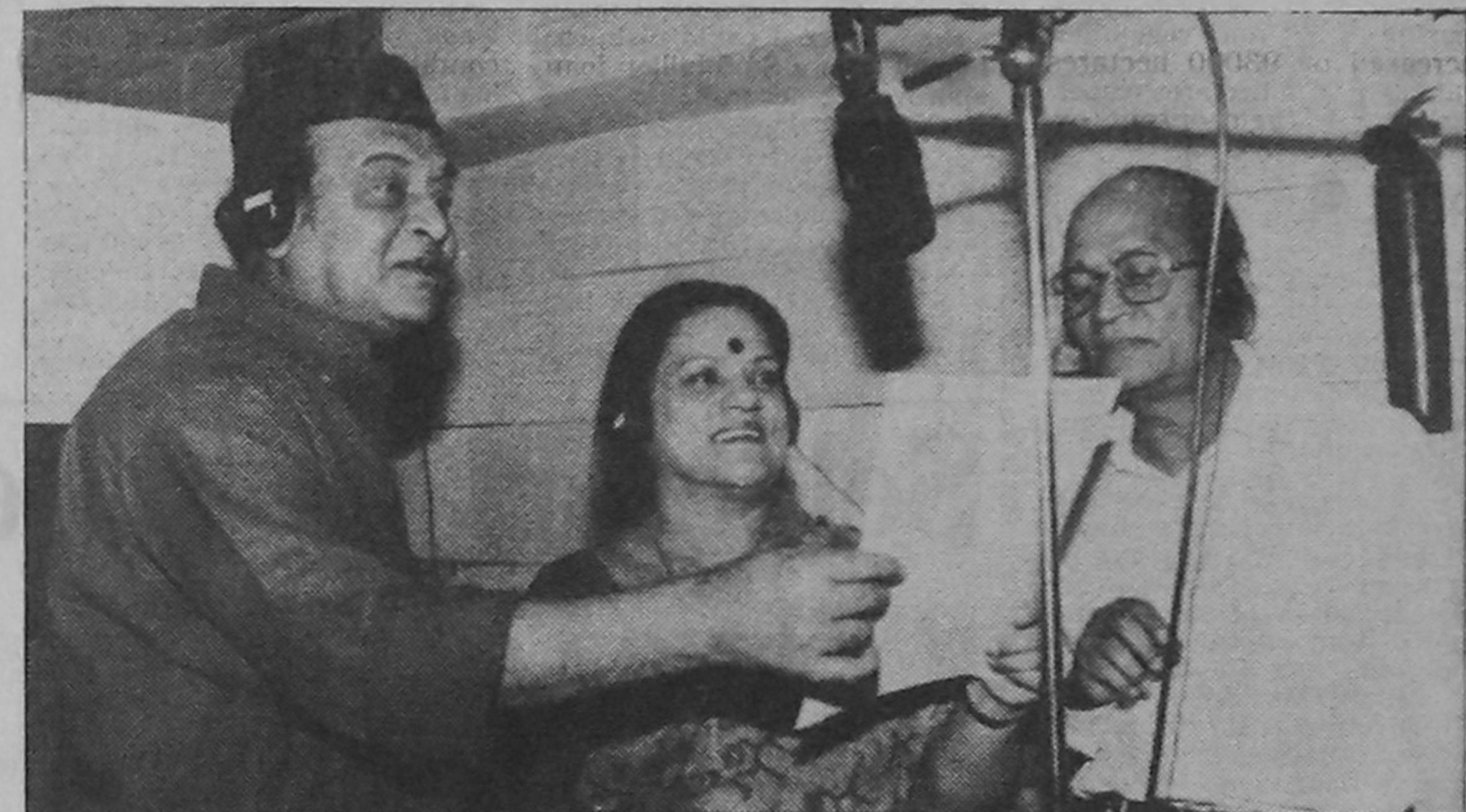
BTV will air a special musical show 'Shurur Aakash' on January 2, 2000, at 10.30pm. The programme will feature eminent singer, Asaf Khan. Asaf Khan will sing a number of popular Bangla Songs. He will also sing songs with Abdur Rahman Bayati, Bhupen Hazarika and Haimanti Shukla. This interesting programme will surely be a treat to the music lovers.