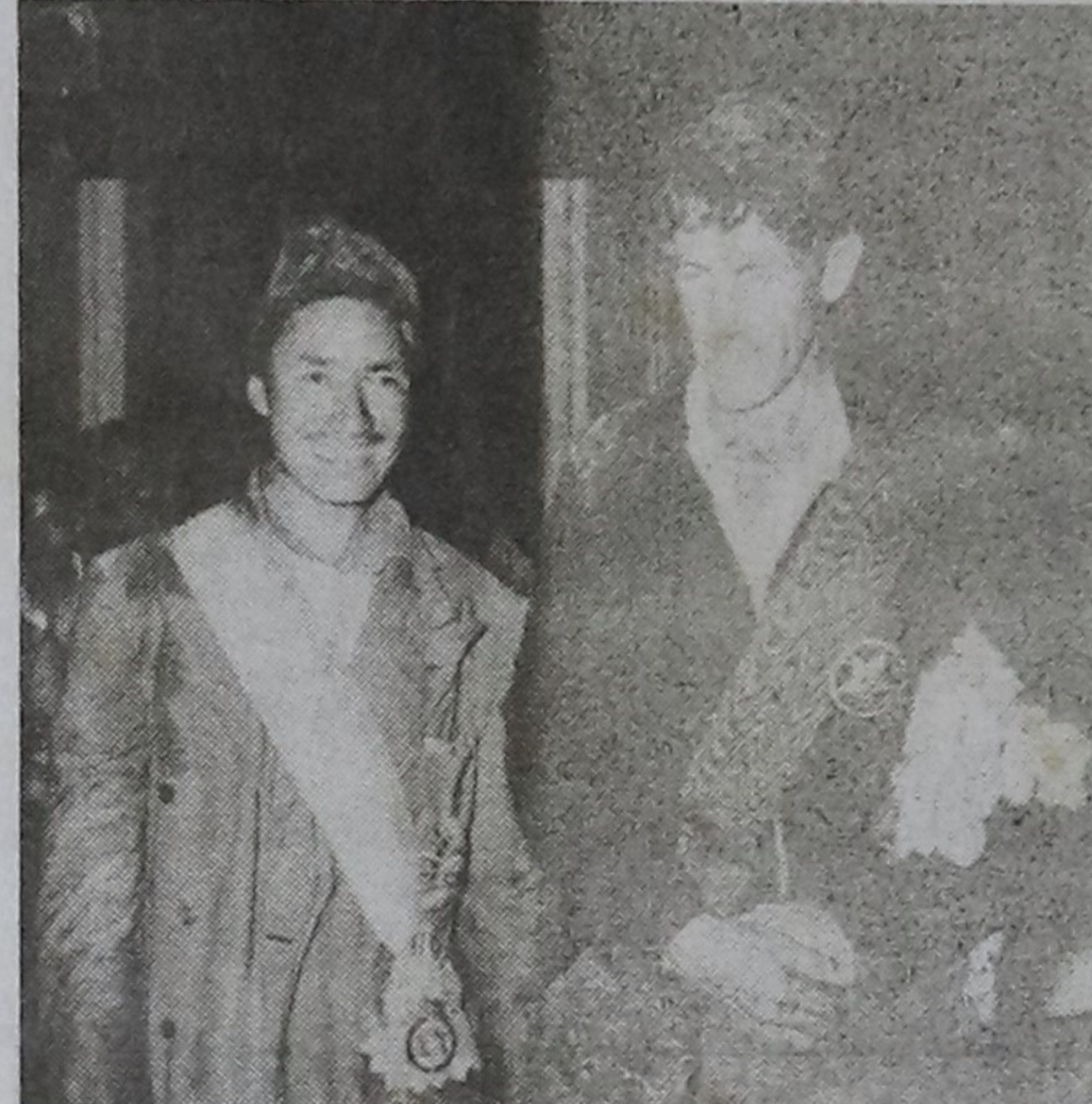
The conquerors of Mount Everest