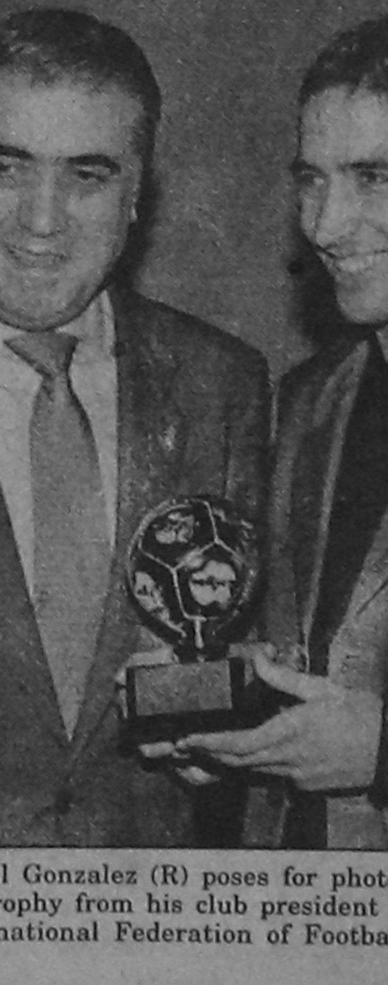
Real Madrid's star striker Raul Gonzalez (R) poses for photographers after receiving the World Top-Scorer-of-the-Year trophy from his club president Lorenzo Sanz in the Spanish capital on December 30. International Federation of Football History and Statistics announced the award.