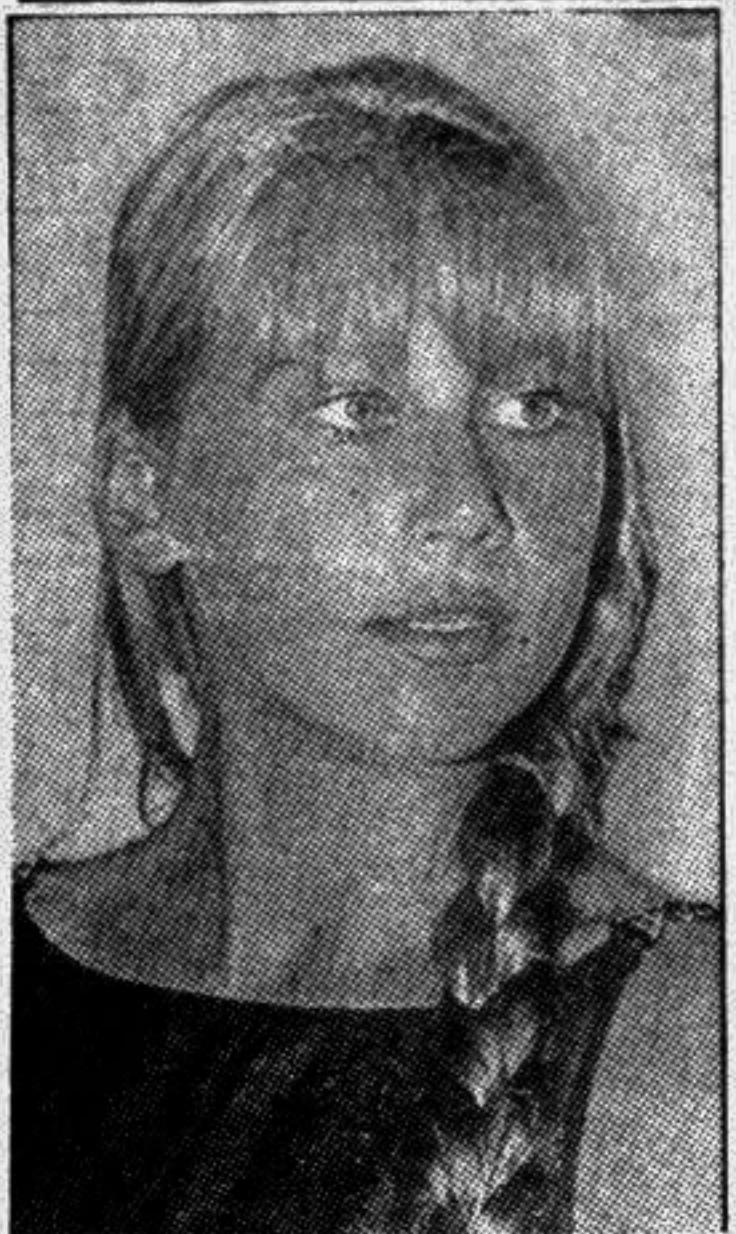
Anna Kournikova (Russian star tennis player) "I have to be focused, which I'm doing right now. I'm going to be number one." Said recently.