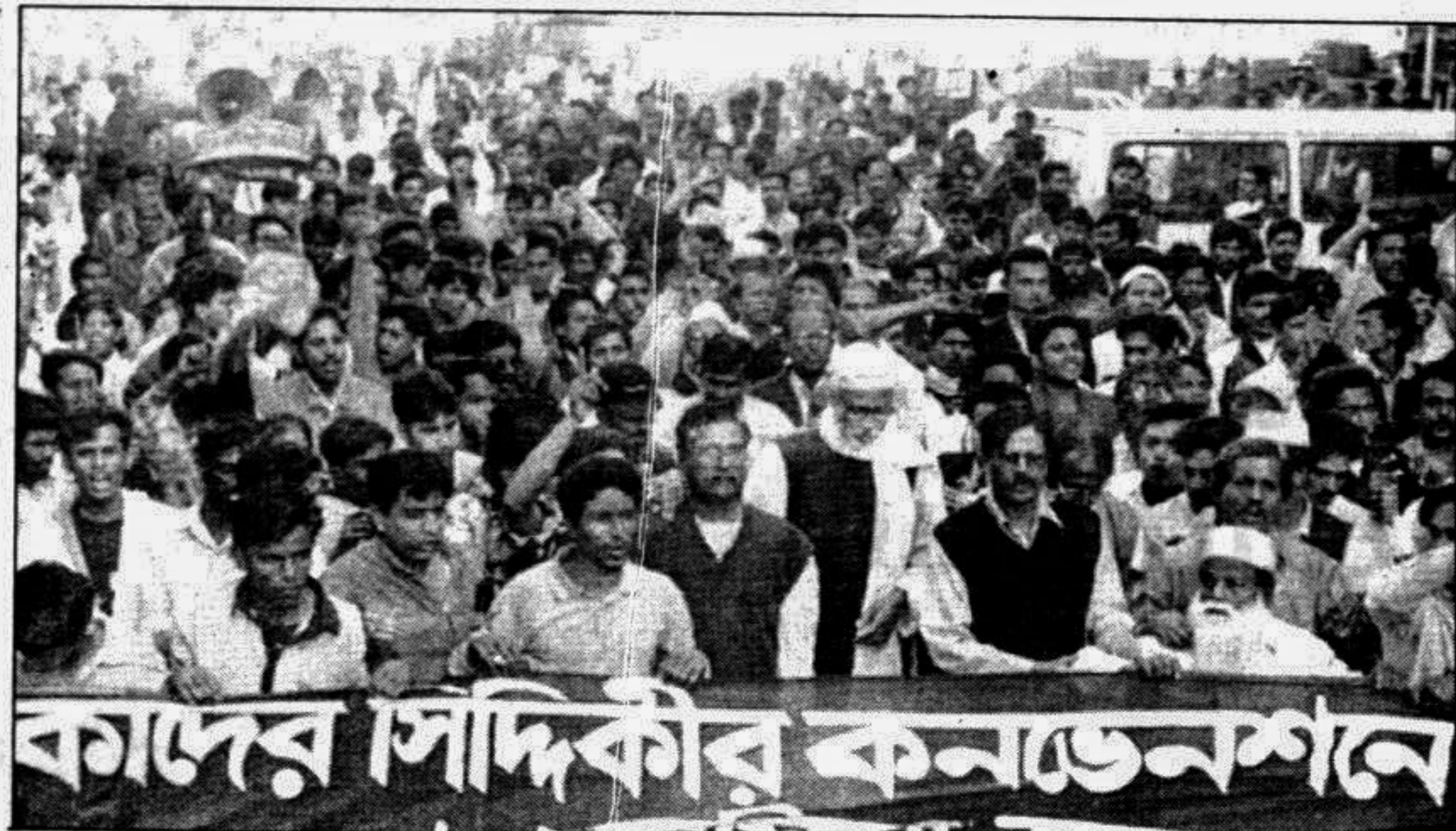
Krishok Sramik Janata League brought out a procession in the city yesterday to protest the attack by BCL activists on its convention earlier this week.