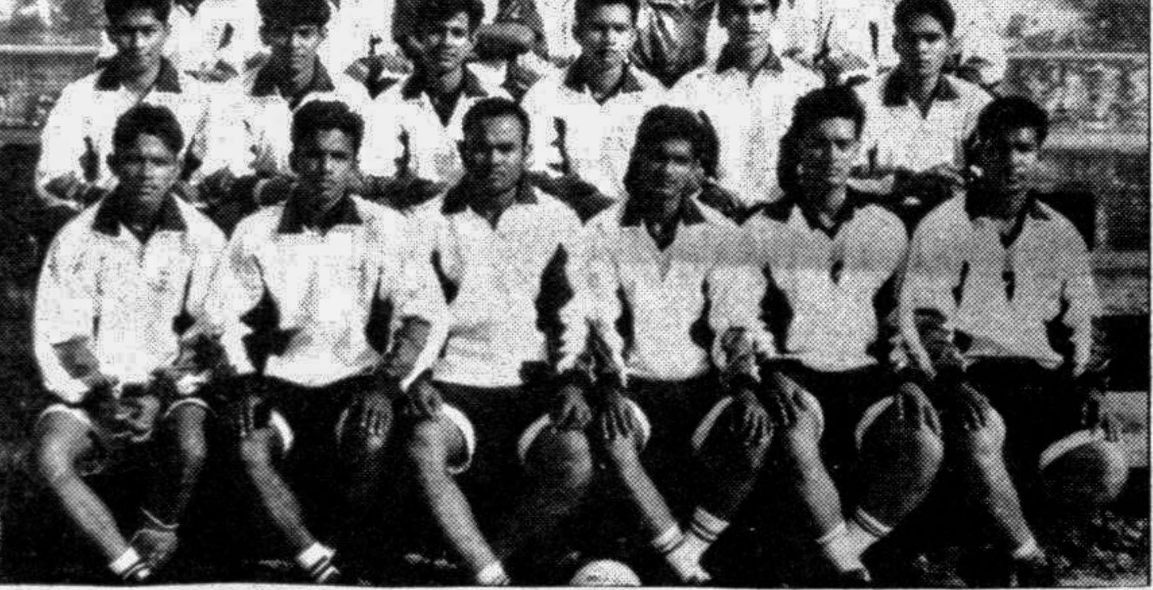
Players and officials of the Arambagh Kriha Sangha who became champions in the CUTE First Division handball league yesterday.