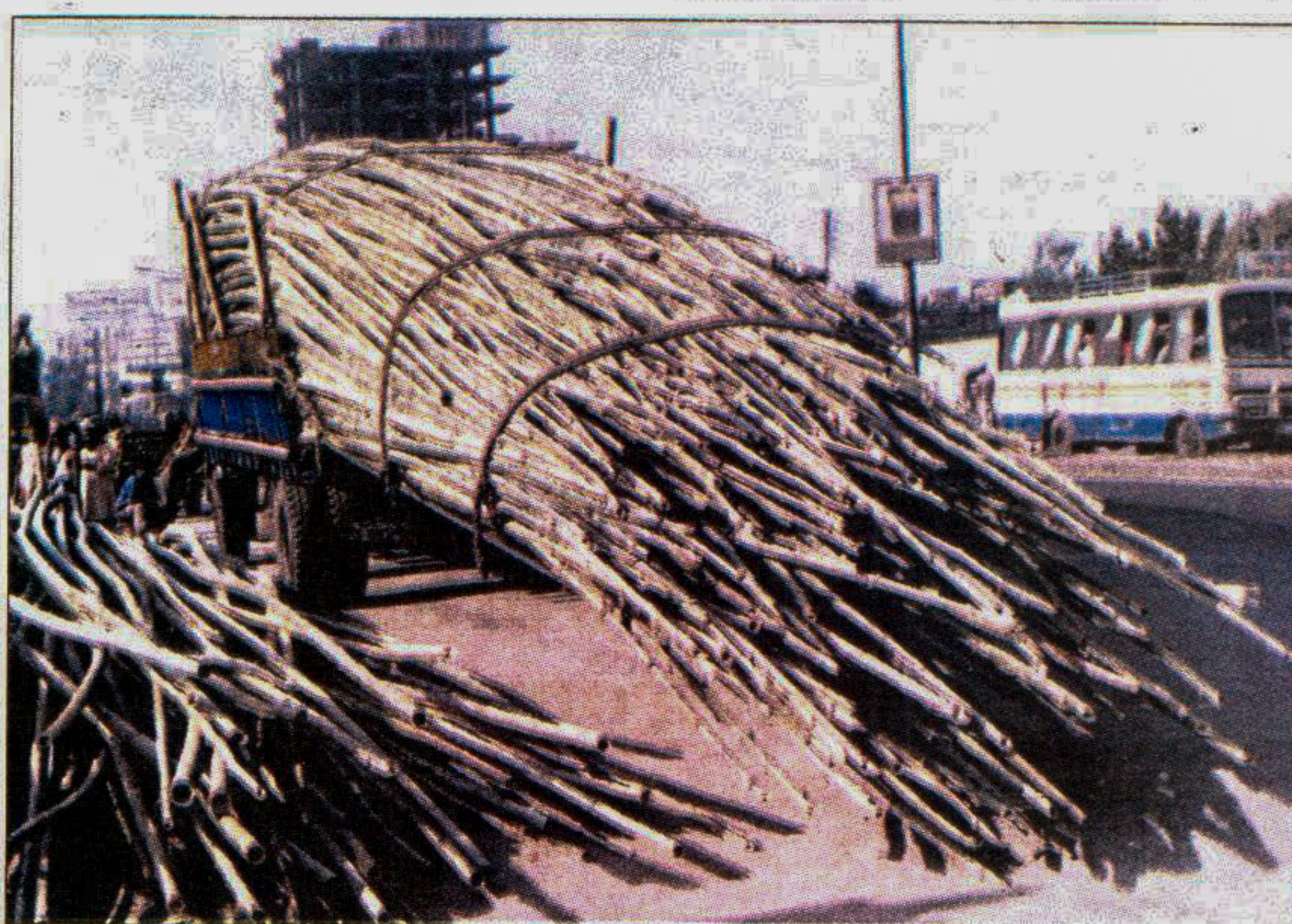
Breaking the bar

The NGOs, specially working in the environment sector, think air pollution in major cities, including the capital Dhaka, should be reduced by 80 per cent of its present magnitude.