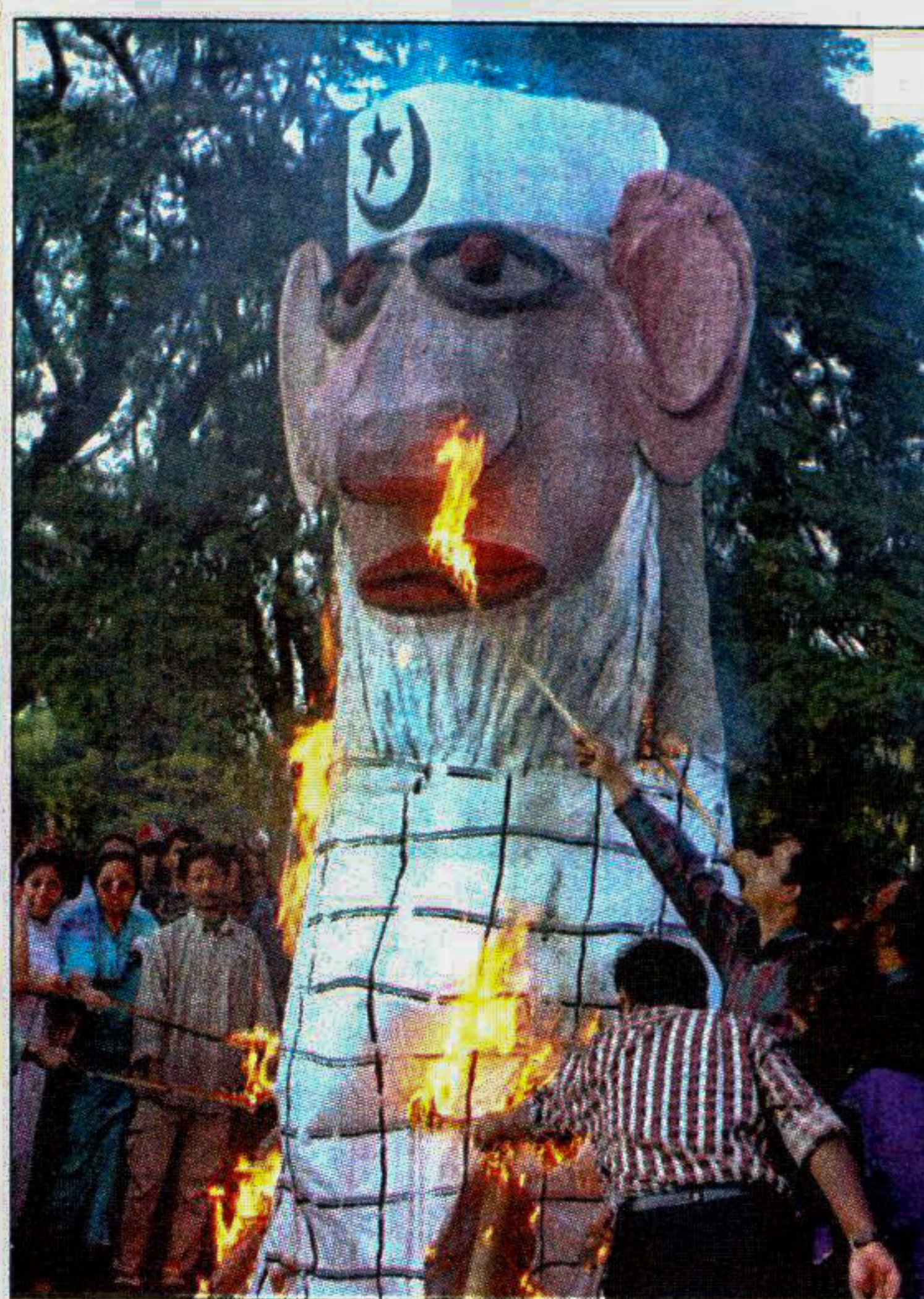
Members of Projoanno '71 burn an effigy of Jamaat chief Golam Azam in the city yesterday.