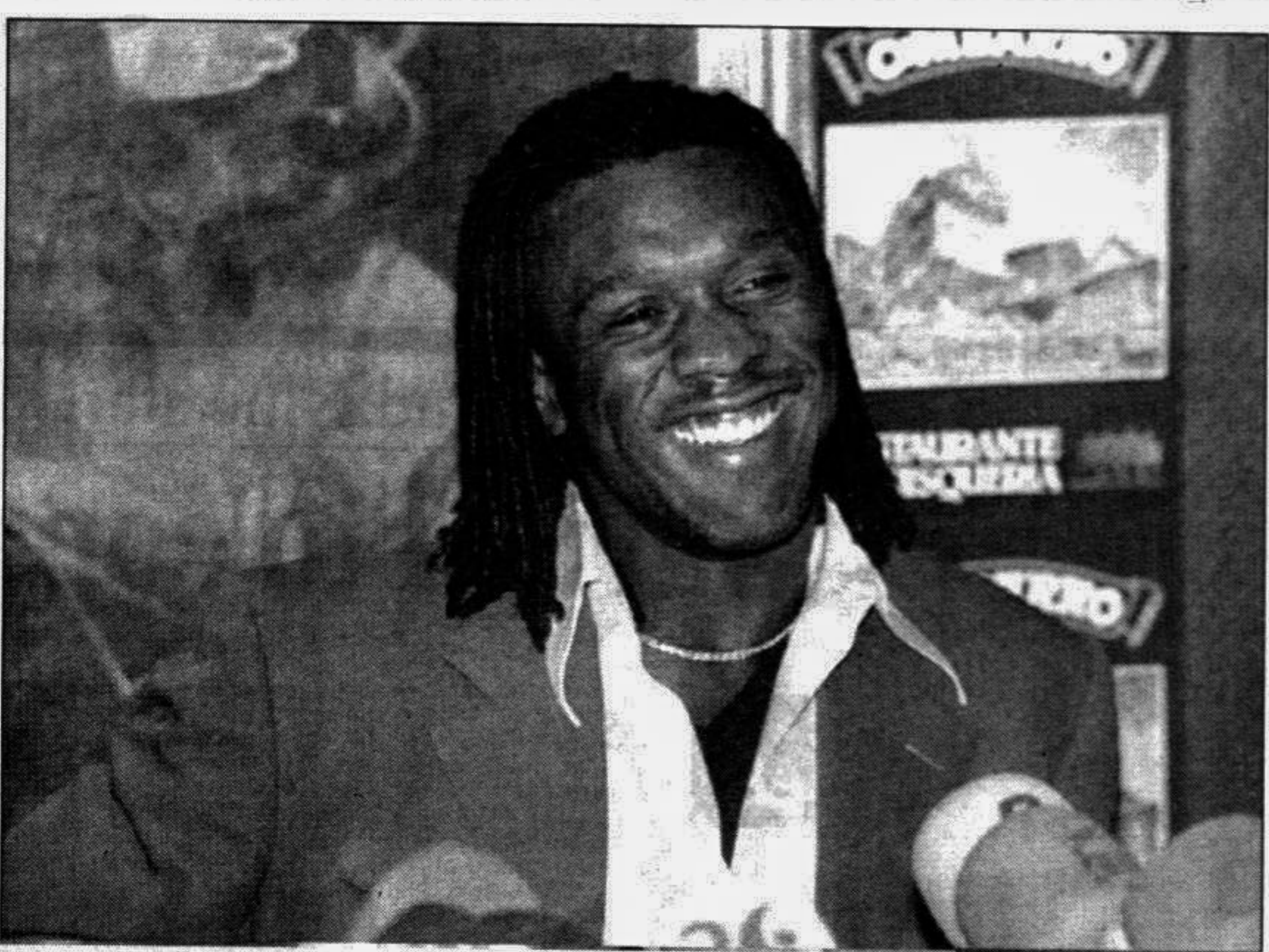
Dutch midfielder Clarence Seedorf smiles during a press briefing at Madrid restaurant on December 27. Seedorf confirmed his move from Real Madrid to Inter Milan.

The striker, who needs calf surgery and would not have been able to any take further part in the season, was a key member of the Bulgarian squad who reached the semifinals of the 1994 World Cup in the United States.