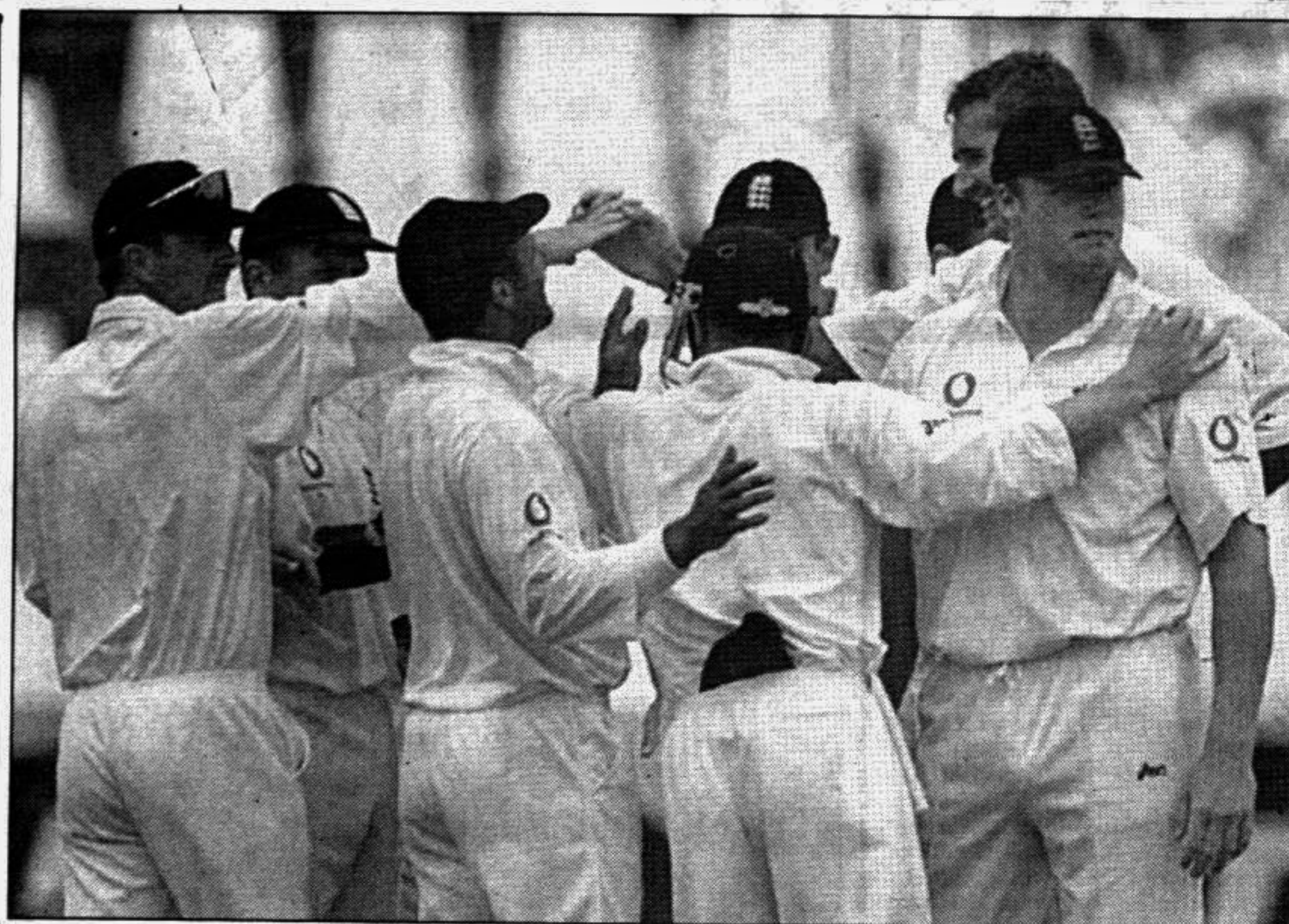
England players gather round paceman Andrew Caddick in Durban yesterday. Caddick took career-best 7/46.

Bowler O M R W McGrath 18 3 39 2 Fleming 15 0 62 1 Lee 17 2 44 5 Warne 24 5 77 1 M Waugh 1 0 5 0