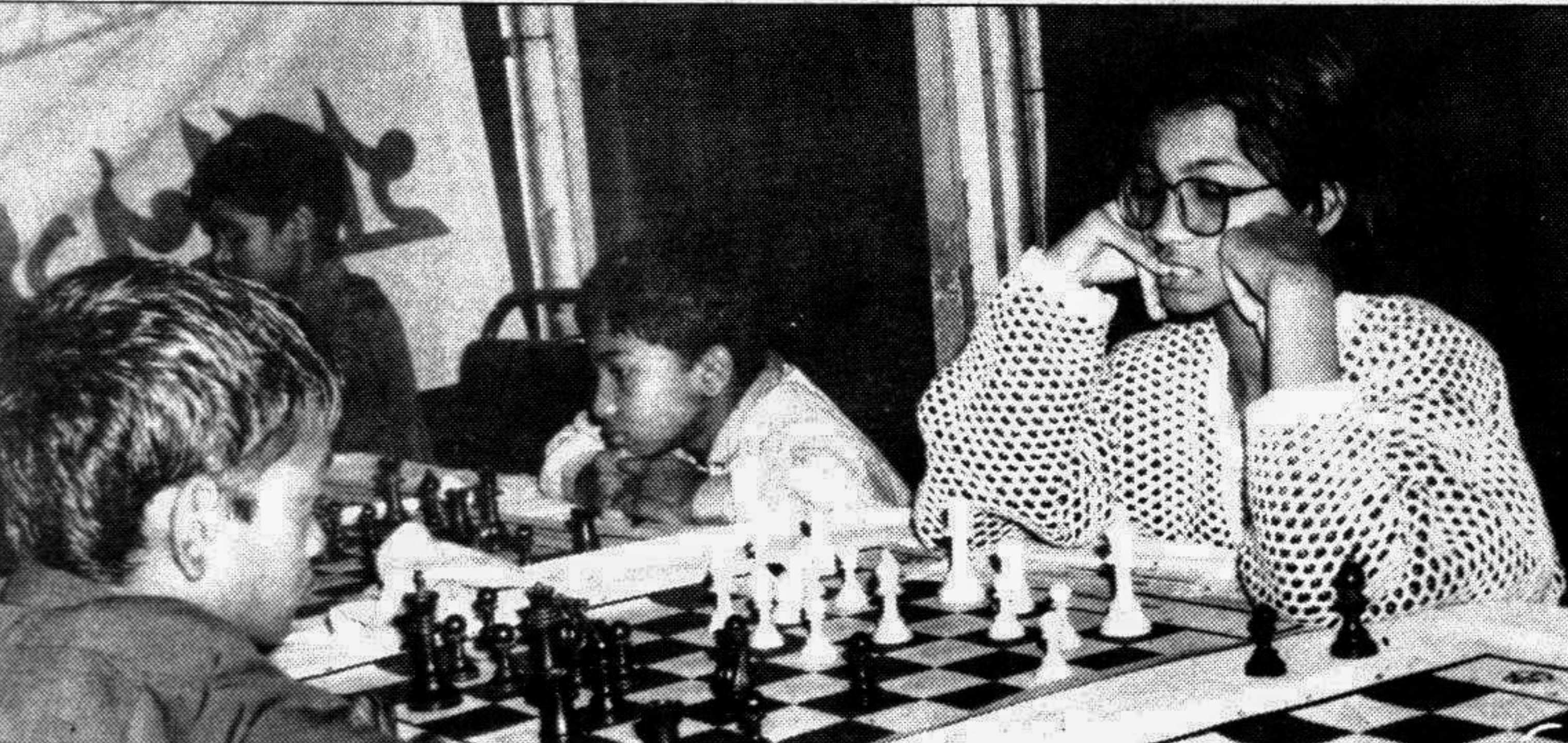
Scene from the eighth round matches of the 20th sub-junior chess championship at the NSC yesterday.

(* denotes currently involved in a Test match).