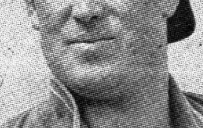
WARNE ... 350th wicket

MELBOURNE, Dec 28: Scoreboard at the close of play on the third day of the second cricket Test between Australia and India at the Melbourne Cricket Ground on Tuesday: AUSTRALIA: First innings (overnight 332-5) Slater c Srinath b V Prasad 91 Blewett b Srinath 2