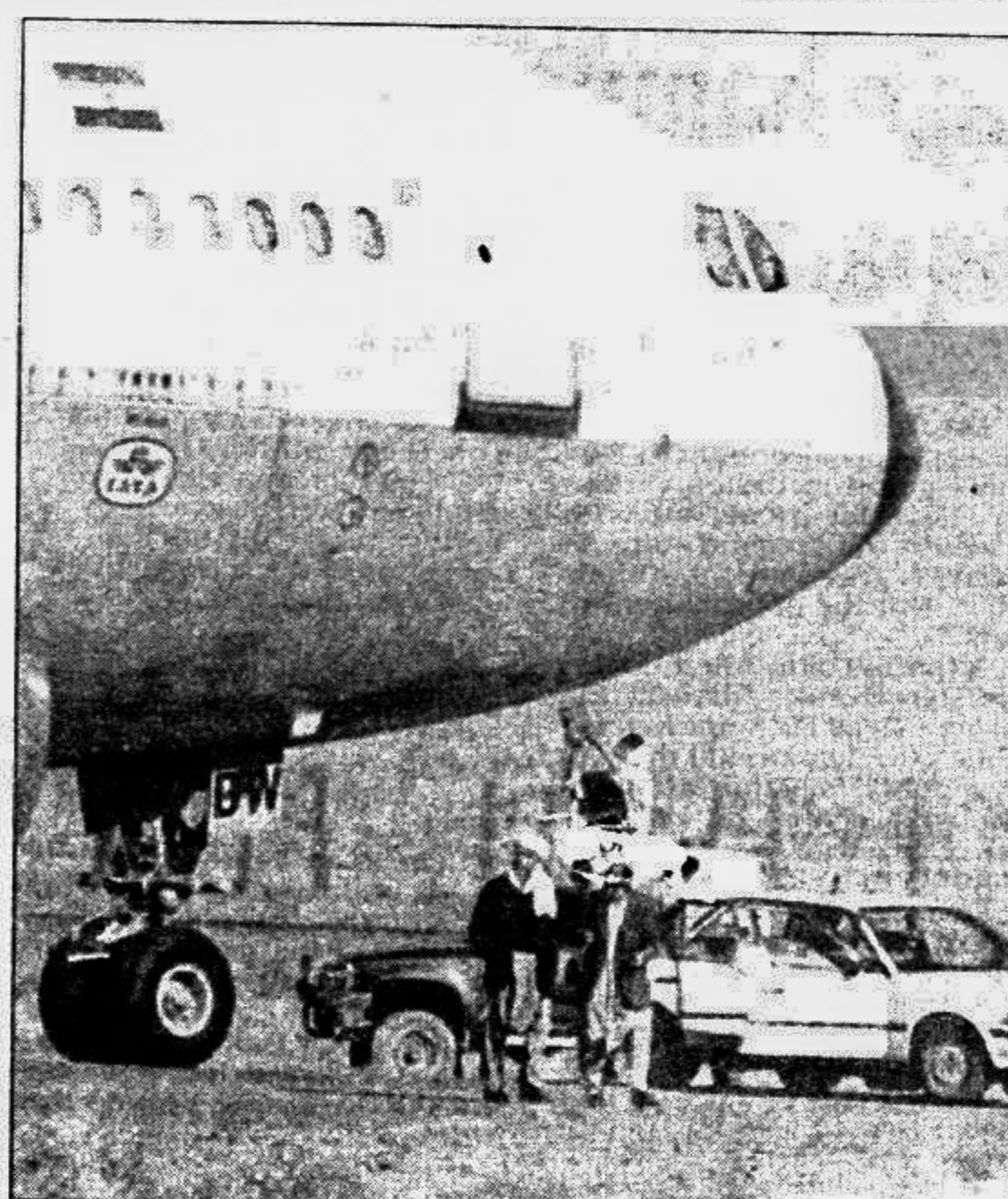
An airport security official belonging to religious Taliban militia provides water bottles to the hijackers for passengers inside the Indian hijacked plane at Kandahar Airport yesterday.