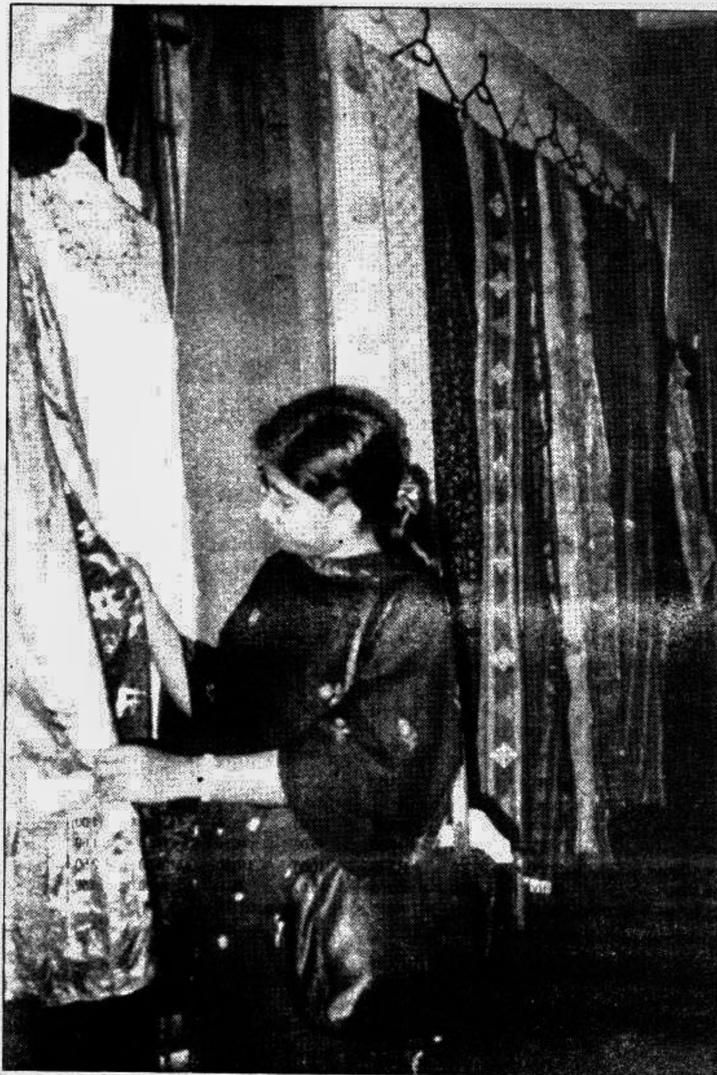
Viewers at Daman's exhibition

we only try to make things easy for our valued customers'.