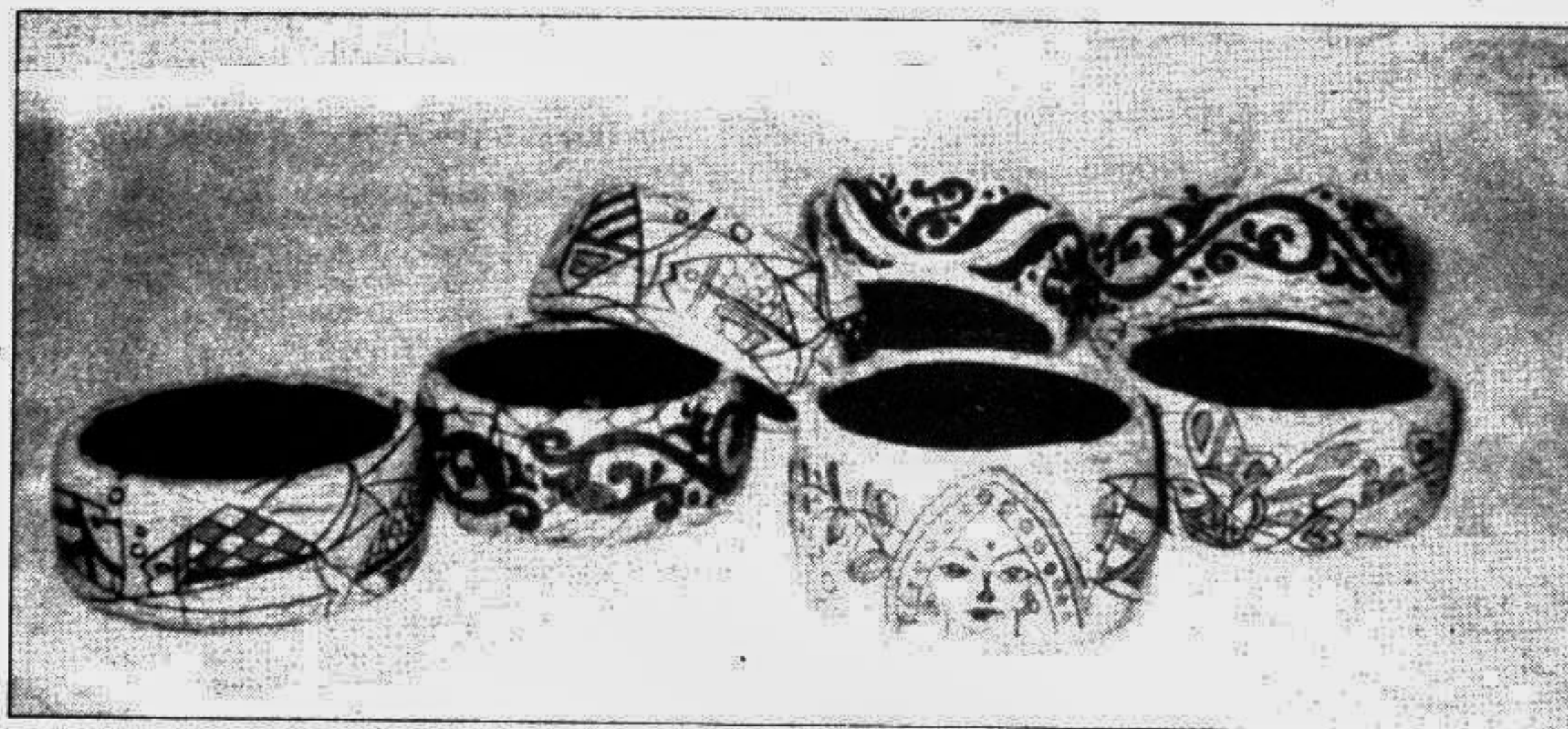
Leather goods displayed by the Sisters' Ideas