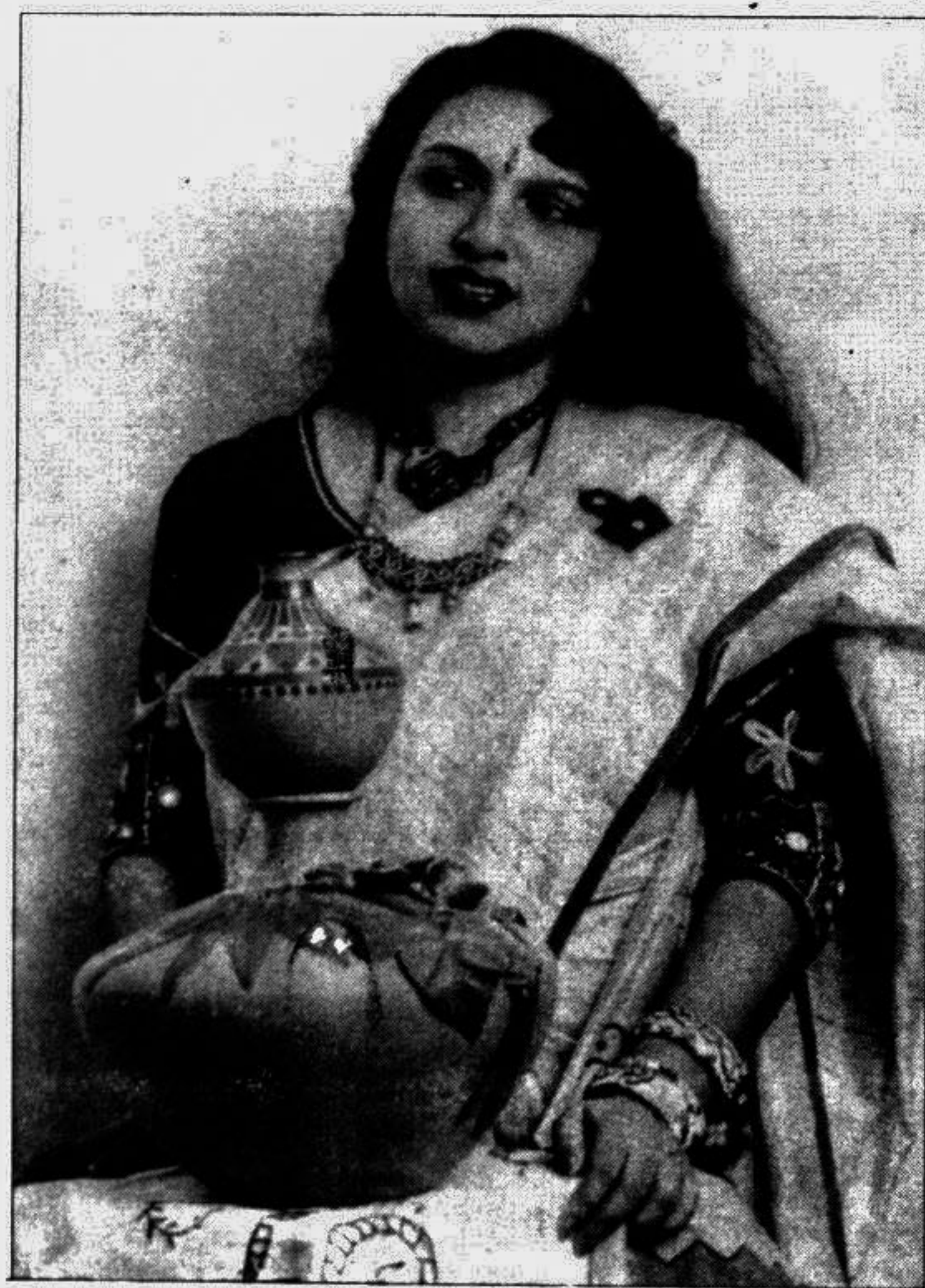
Pottery by Sisters' Ideas

France de Dhaka is a testimony to the growing popularity of fashion accessories side by side with dress materials.