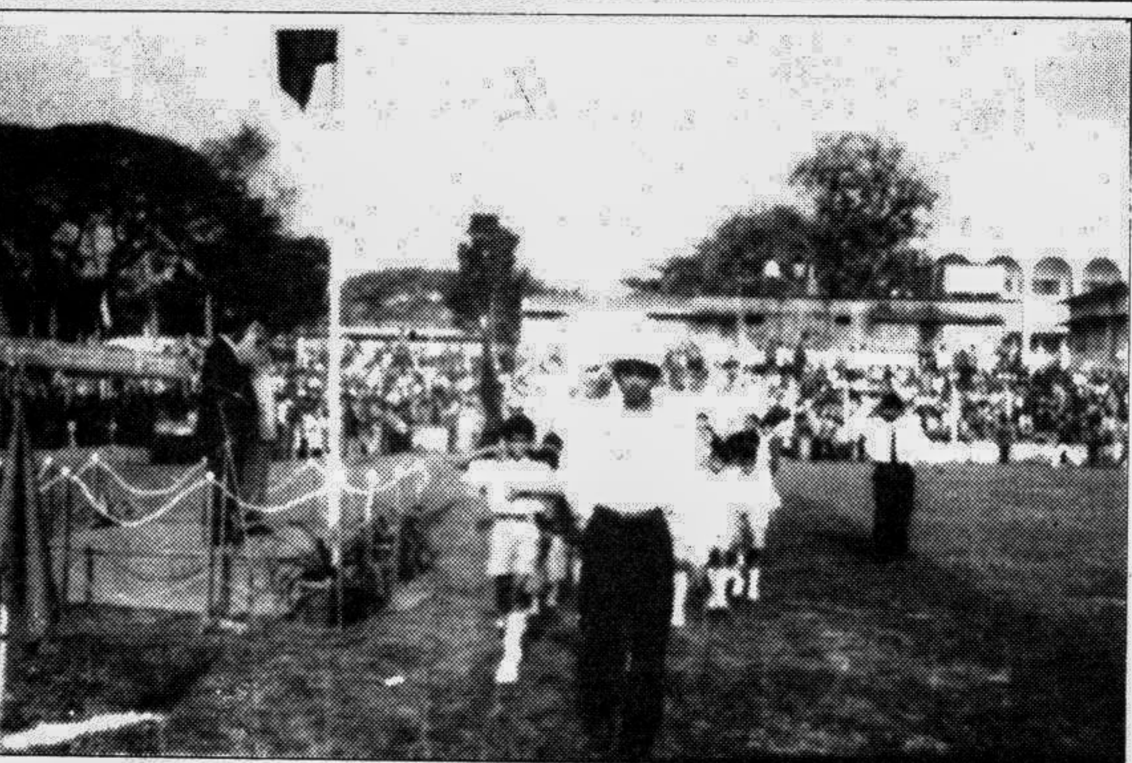
Victory Day march past at Gopalganj Stadium where the Deputy Commissioner, Iqbal Mahmud, taking salute.

ment. He committed to contribute Taka 50,000 more after starting of the work. But no initiative has been taken by the same committee to implement the programme after five years of its formation. On contact with some members of the committee they expressed their ignorance.