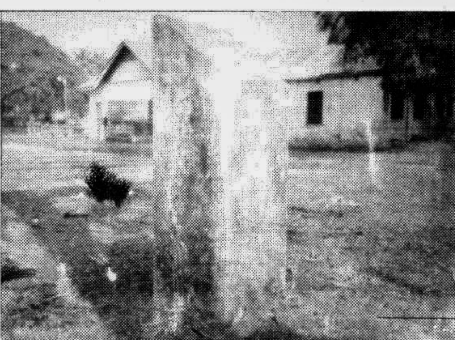
Foundation stone of memorial monument in Gaibandha town.

However, the aforesaid committee laid the foundation stone of the monument at the western side of Gaibandha Public Library. A renowned dramatist named Nasiruddin Yousuf donated Taka 50,000 for the foundation work of the monu-