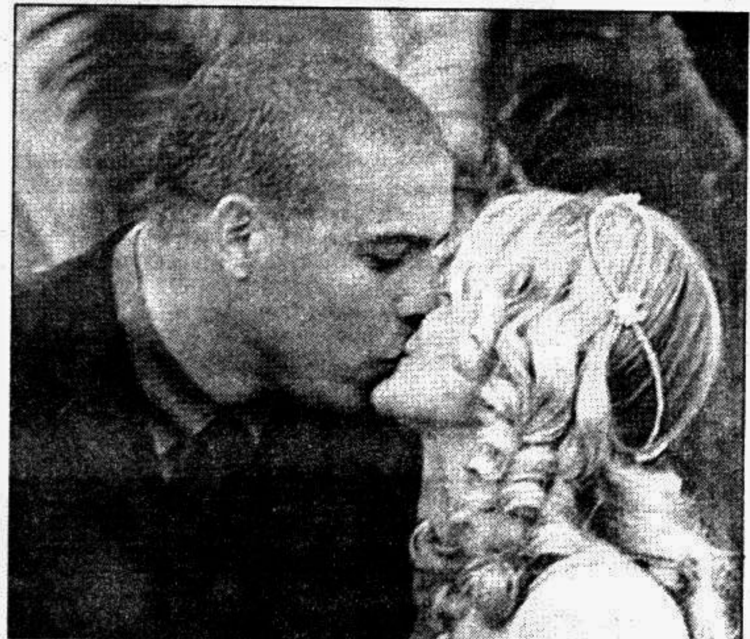
The newly-wed couple kiss after exchanging their vows.