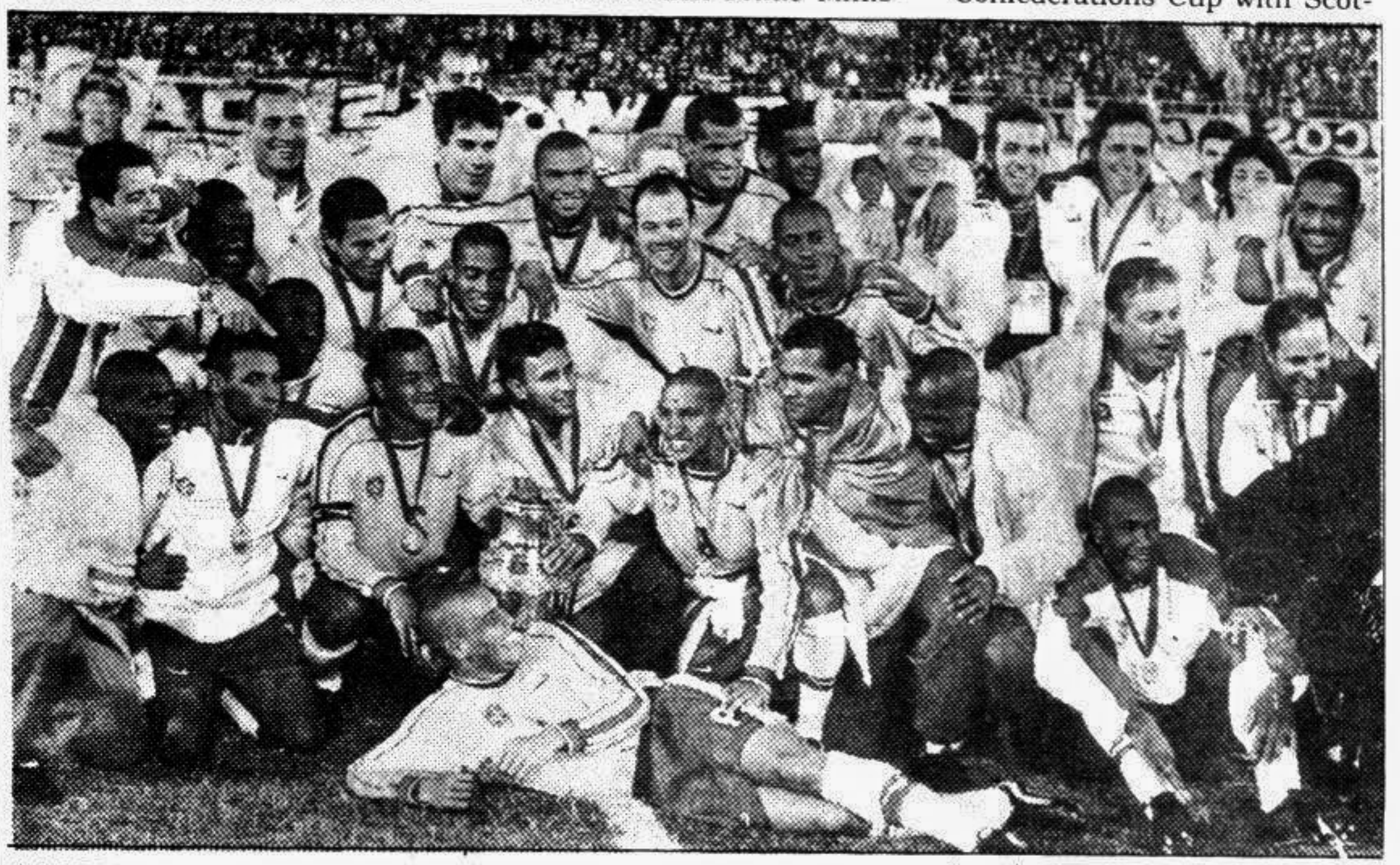
SAMBA BACK ON TRACK: The victorious Brazilian team which clinched the Copa America trophy.

The other established giants of European football - France, Germany, Spain and Italy - also qualified, some more convincingly than others.